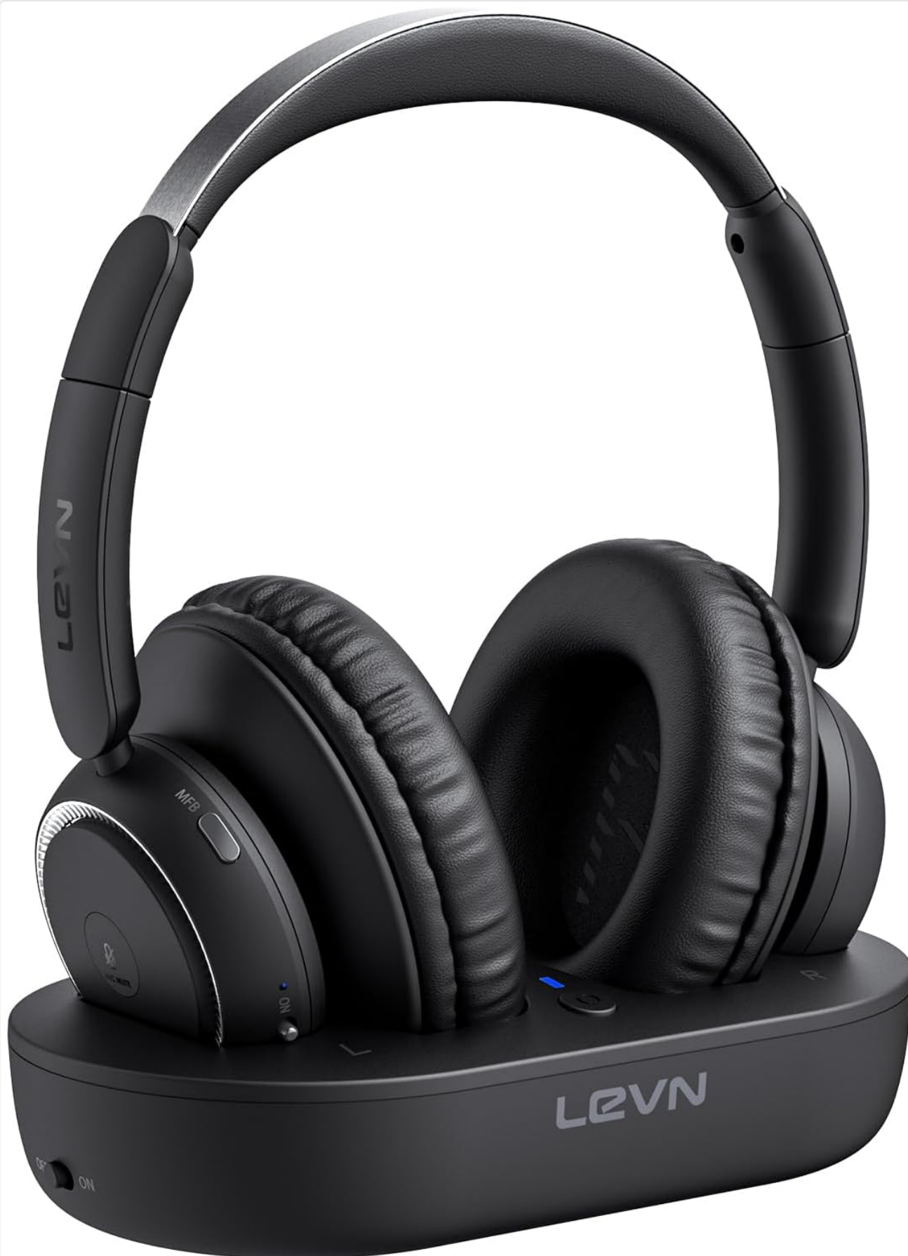
Image: The LEVN Wireless Headphones resting on their charging base, showcasing the sleek black design. This is the primary product unit.