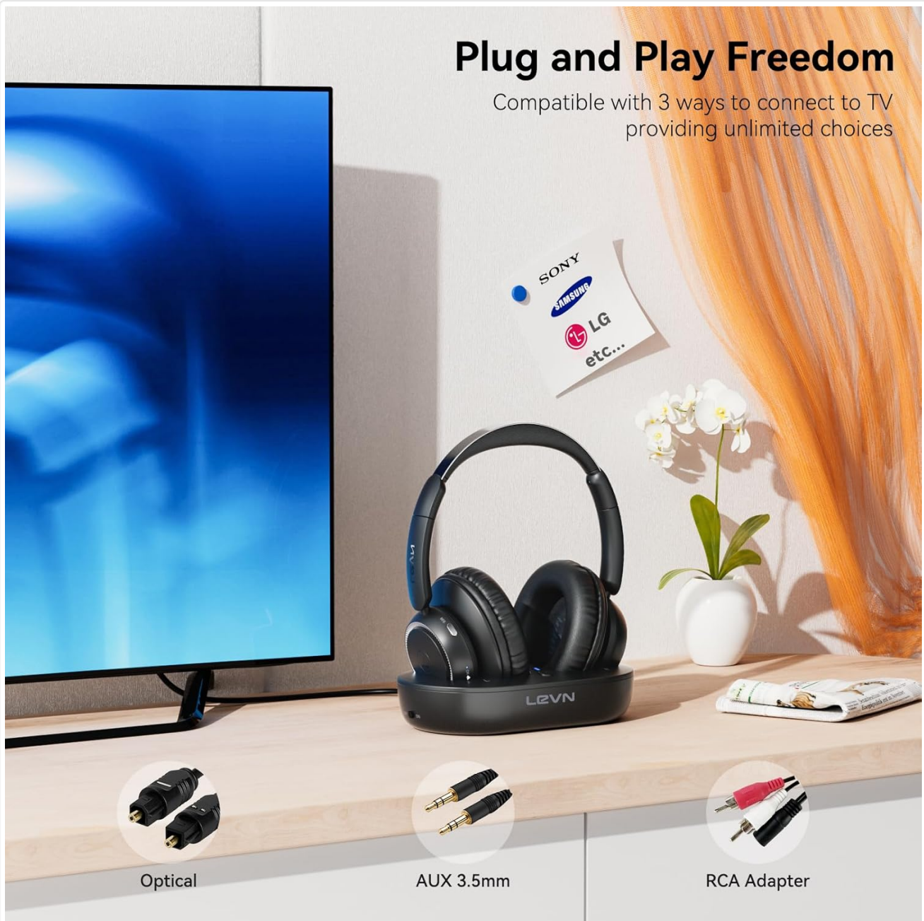
Image: The LEVN Wireless Headphones and transmitter base are positioned near a television, with illustrations of Optical, AUX 3.5mm, and RCA adapter audio cables, demonstrating the versatile 'Plug and Play Freedom' connection options.

Compatible with 3 ways to connect to TV providing unlimited choices