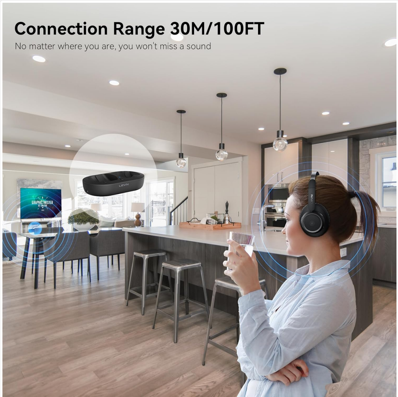
Image: A woman wearing the LEVN Wireless Headphones is shown walking through a spacious home, with a graphic indicating a 'Connection Range 30M/100FT' from the transmitter, emphasizing the extended wireless freedom.

The headphones offer a connection range of up to 30 meters (100 feet) from the transmitter, allowing for freedom of movement within your home without losing audio connection.