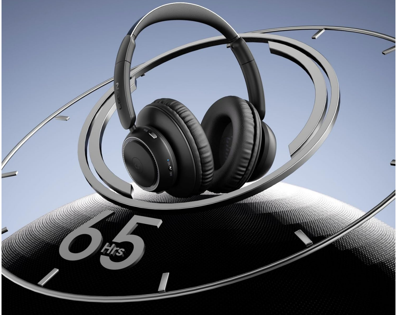
Image: The LEVN Wireless Headphones are depicted within a stylized clock face, with '65 Hrs' prominently displayed, signifying the impressive 65-hour battery life on a single charge.

Get 1 week of use on a single charge for uninterrupted watching fun