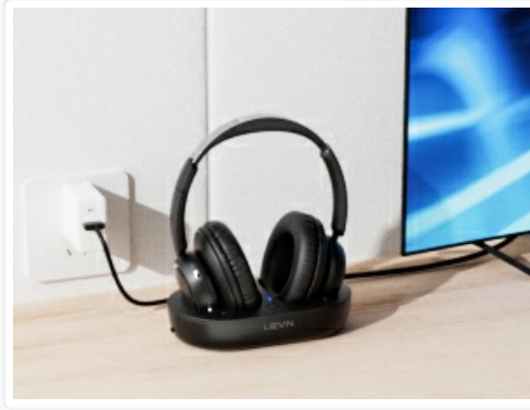
Image: The LEVN Wireless Headphones are shown on their charging base, which is connected to a power outlet, indicating the charging process.