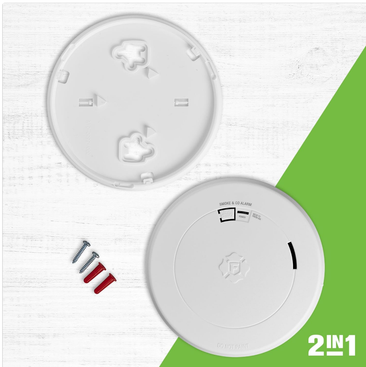
Figure 2: Contents of the First Alert SMC0210 package, showing the alarm unit, mounting bracket, screws, and anchors.