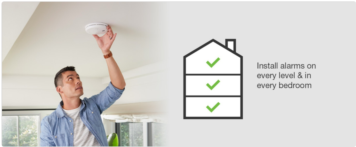
Figure 4: A person installing the First Alert SMCO210 alarm on a ceiling, demonstrating the ease of mounting.

Your browser does not support the video tag. Please update your browser.