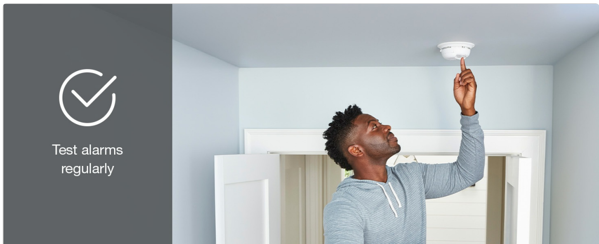
Figure 5: A person testing the alarm by pressing the central button, demonstrating a routine check for functionality.

Press and hold the 'TEST/SILENCE' button located on the front of the alarm to test its functionality. The alarm will emit a series of loud beeps, indicating that the smoke and CO sensors are working correctly. This button can also be used to silence nuisance alarms for a short period.