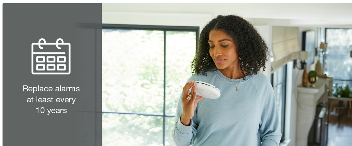
Figure 6: A visual reminder to replace the alarm unit after 10 years of service.

The SMCO210 alarm has a sealed 10-year battery and is designed to last for 10 years from the date of installation. After 10 years, the unit will signal an end-of-life warning (two chirps every 30 seconds), indicating it's time to replace the entire alarm unit. Do not attempt to replace the internal battery.