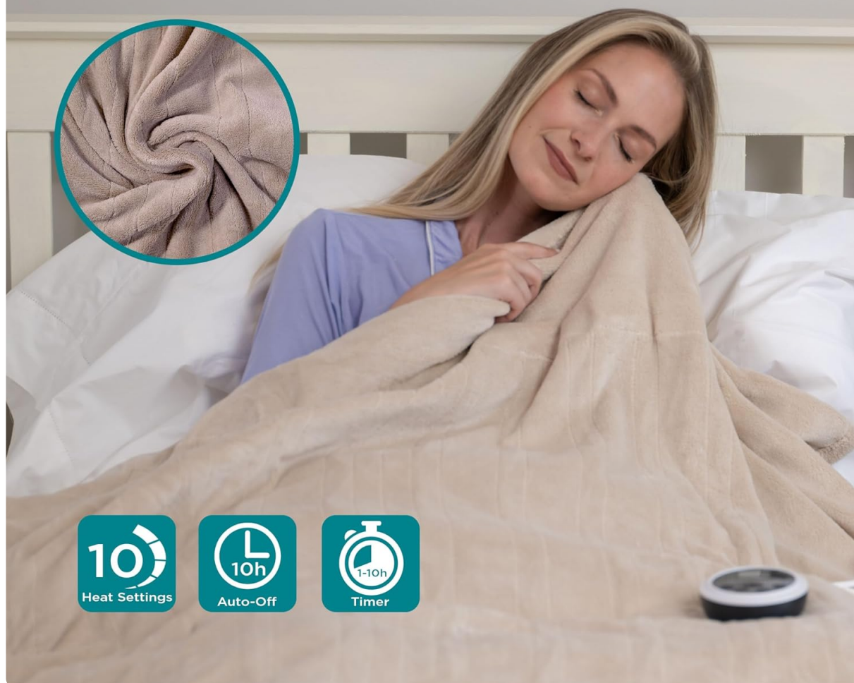
Image: A woman comfortably covered by the cream-colored BLACK+DECKER Heated Blanket in bed, holding a mug. Icons indicate 10 Heat Settings, 10h Auto-Off, and 1-10h Timer.