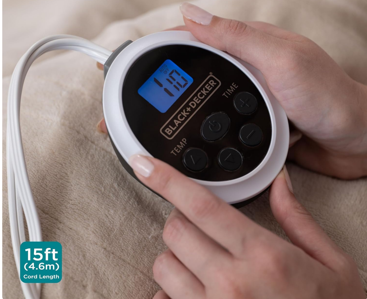
Image: A close-up view of the BLACK+DECKER digital controller, showing the display with '10' (indicating heat level) and buttons for temperature and timer adjustment. The 15ft (4.6m) cord length is also highlighted.