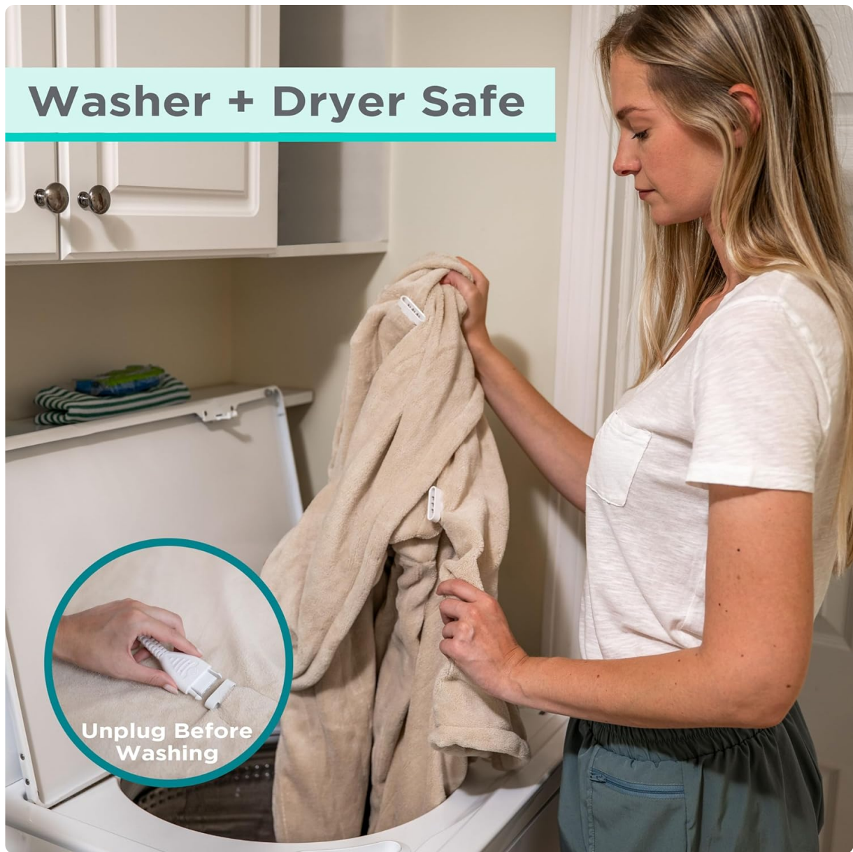
Image: A woman is shown unplugging the controller from the BLACK+DECKER Heated Blanket before placing it into a top-loading washing machine, illustrating the machine washable and dryer safe feature.