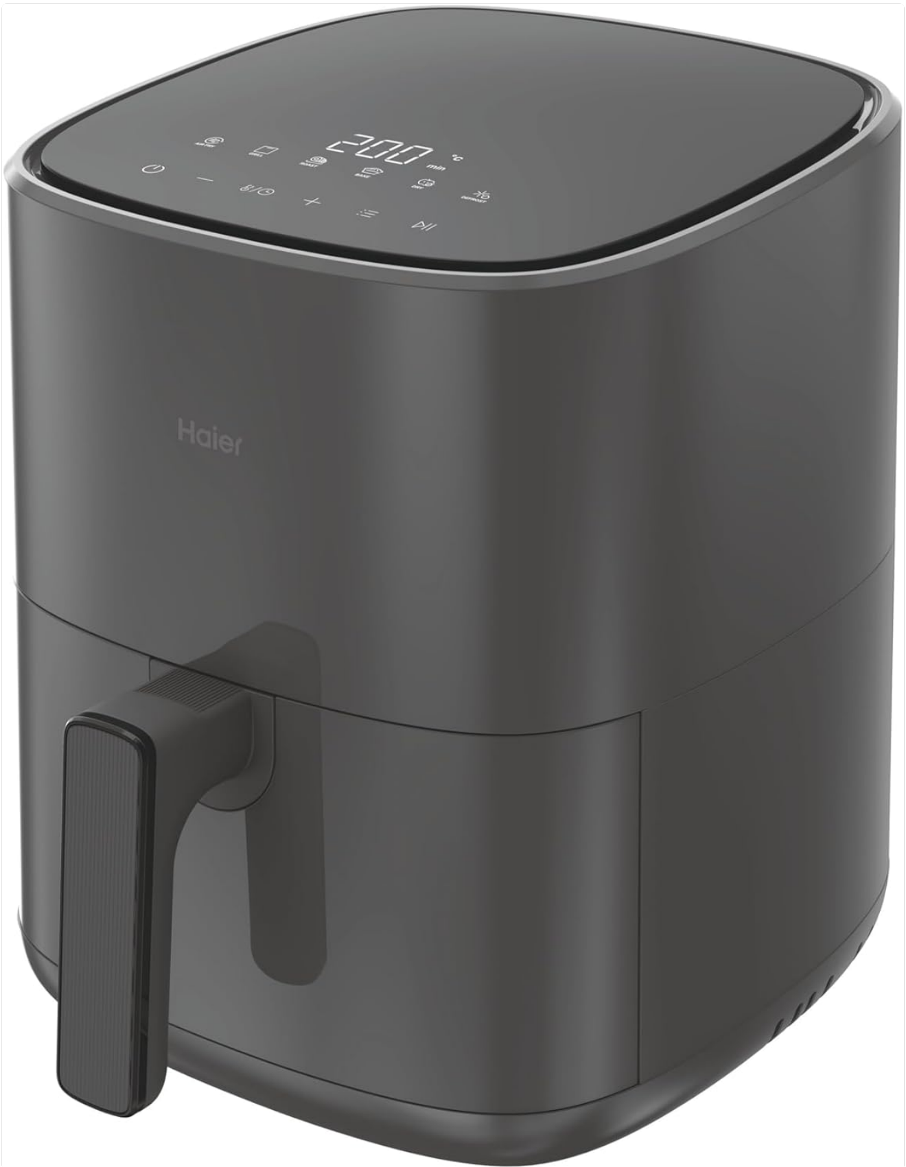
Figure 1: The Haier HAF5P Air Fryer, showcasing its compact design and digital control panel.