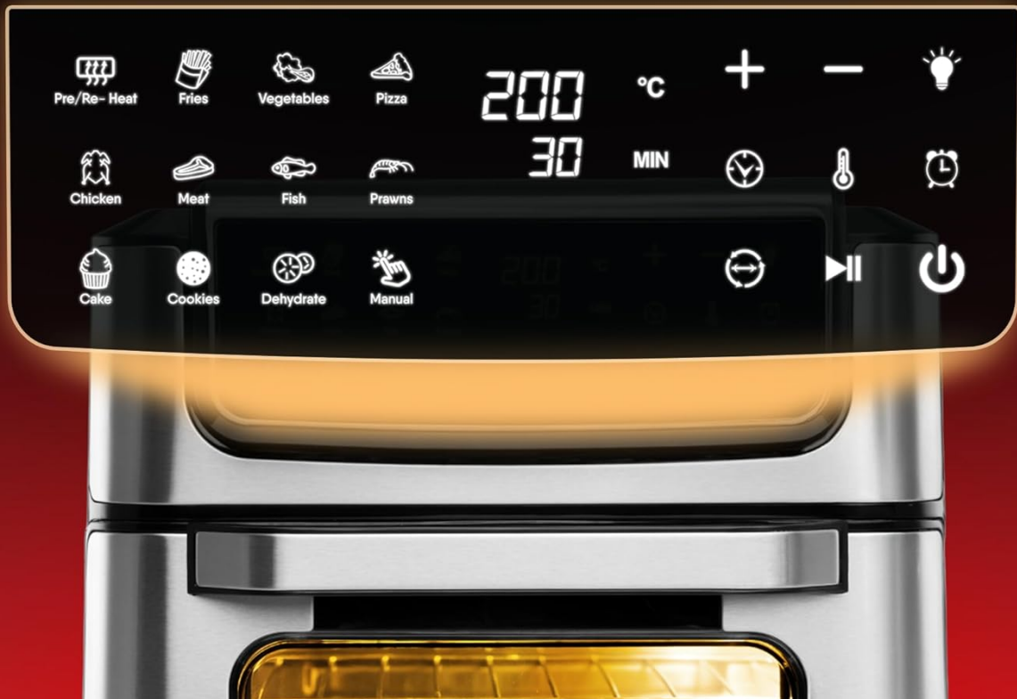
Figure 2: Smart Touch Control Panel.