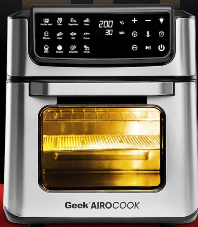
Figure 4: Rotisserie function in action.