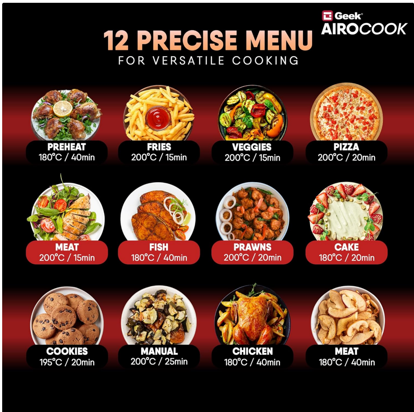
Figure 3: 12 Precise Menu Options.