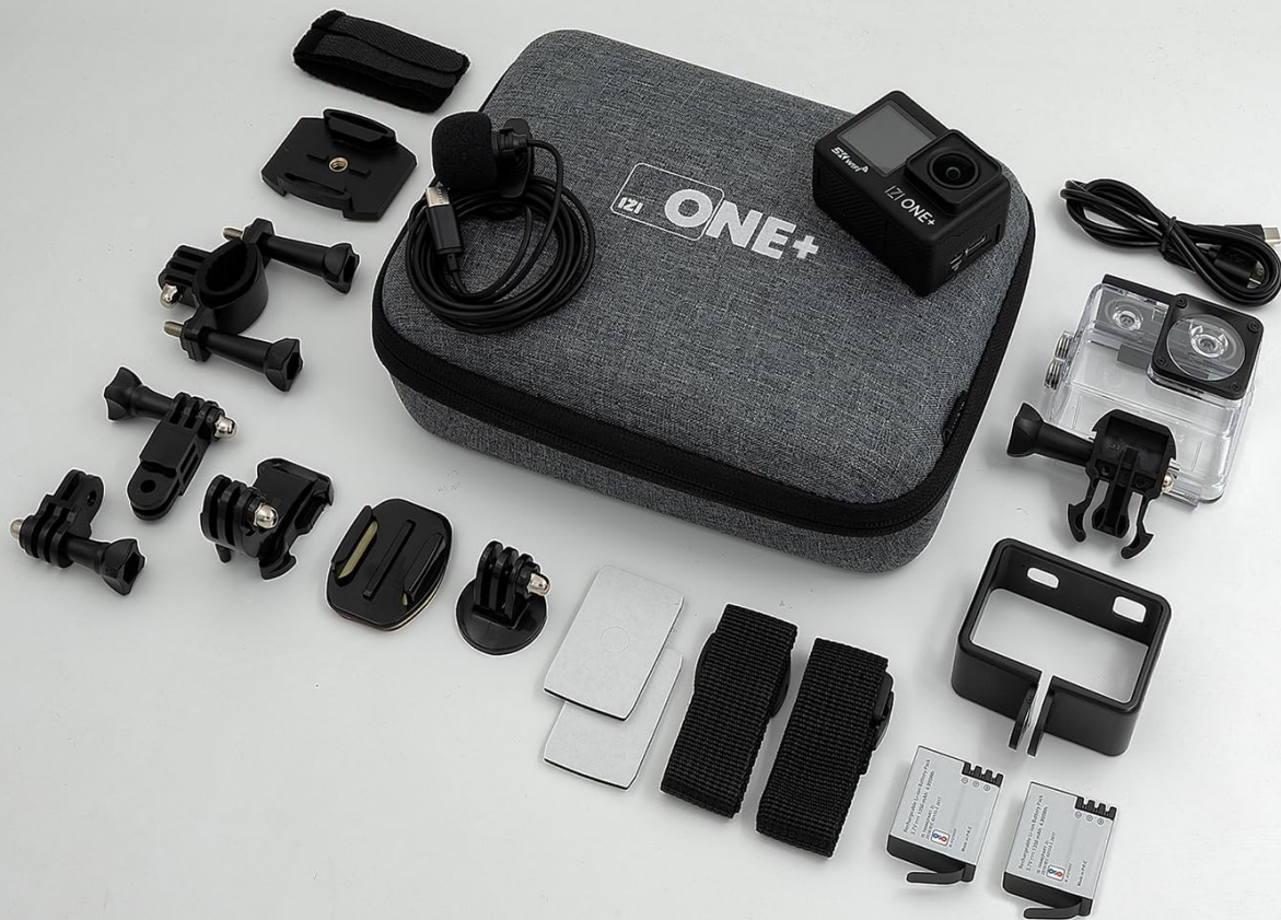
Figure 2: IZI ONE+ Package Contents