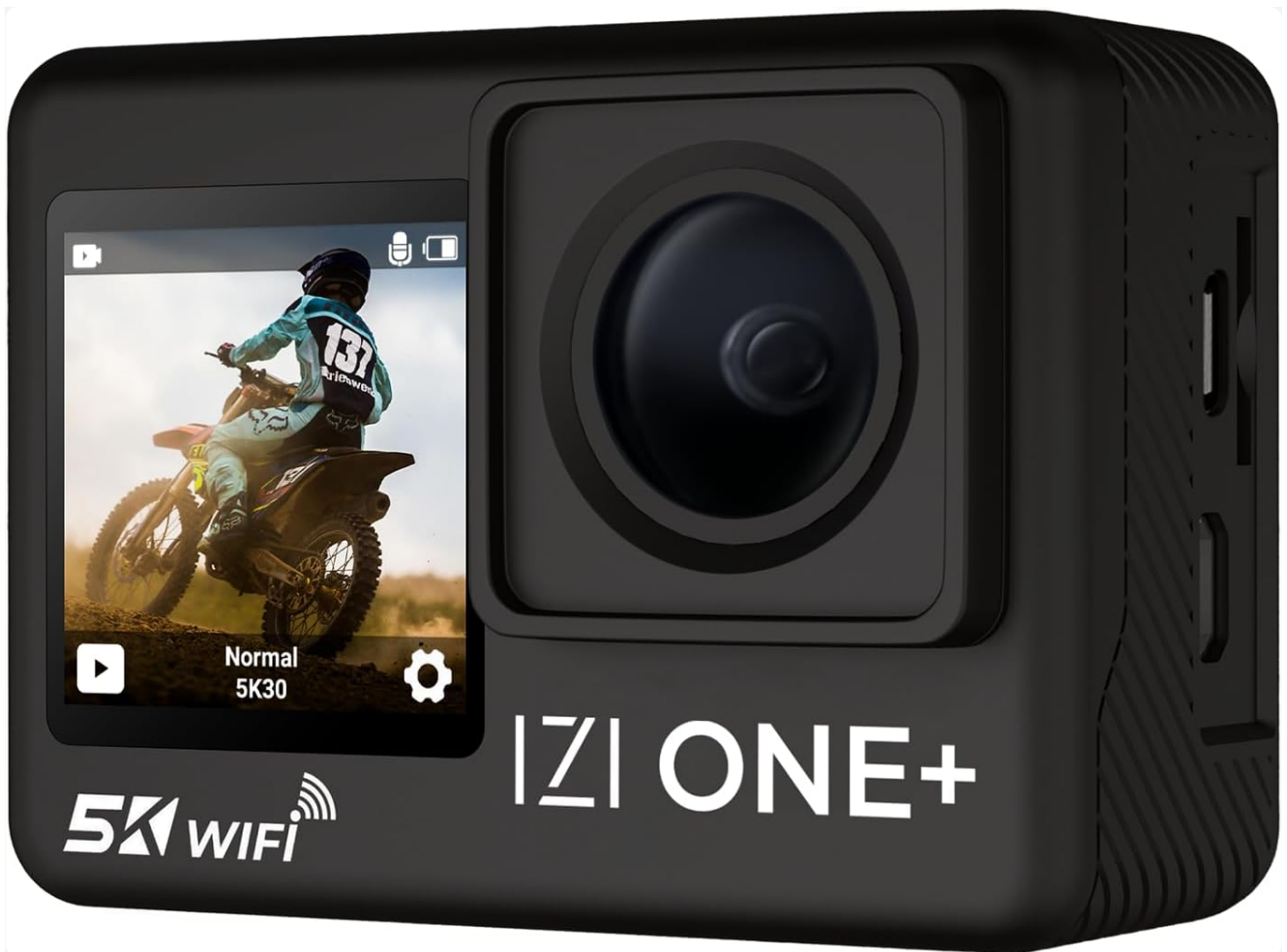
Figure 1: IZI ONE+ Action Camera