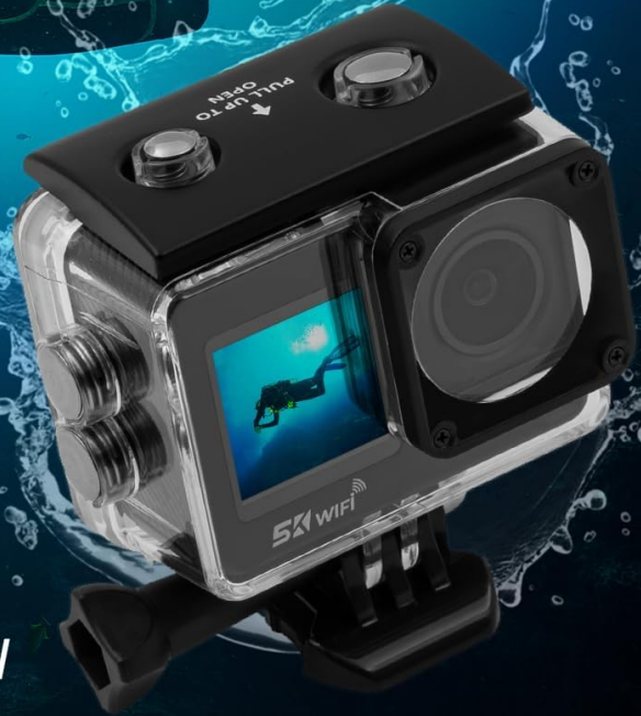
Figure 6: Waterproof Capability