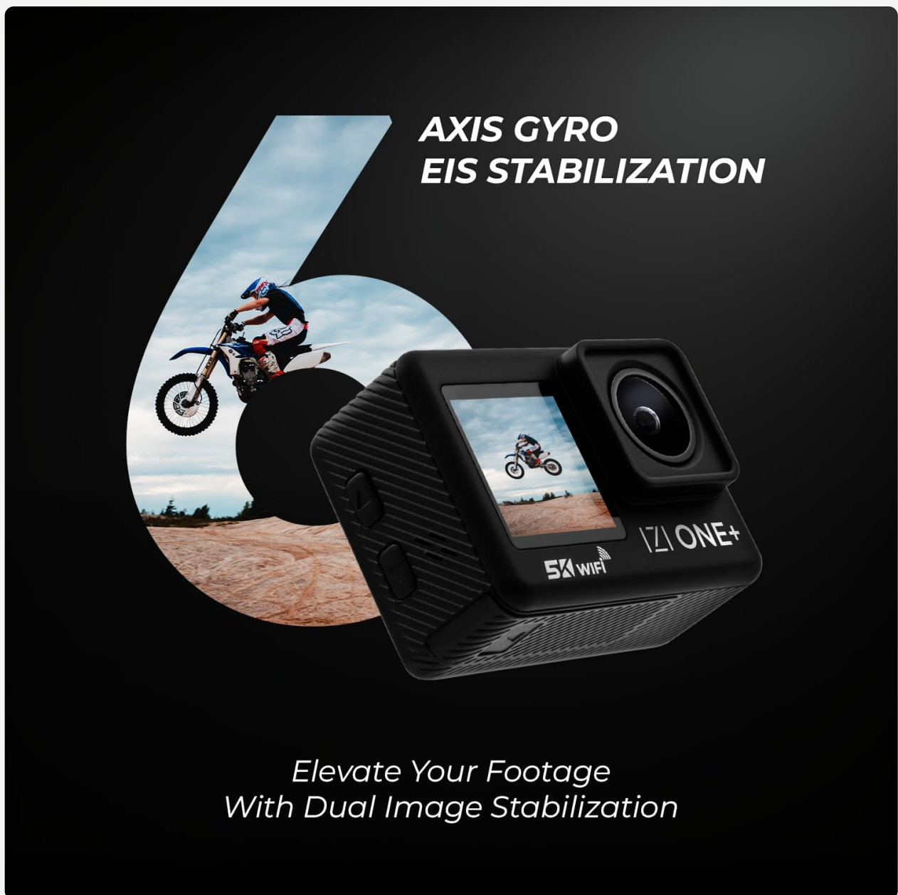
Figure 4: 6-Axis Gyro EIS Stabilization