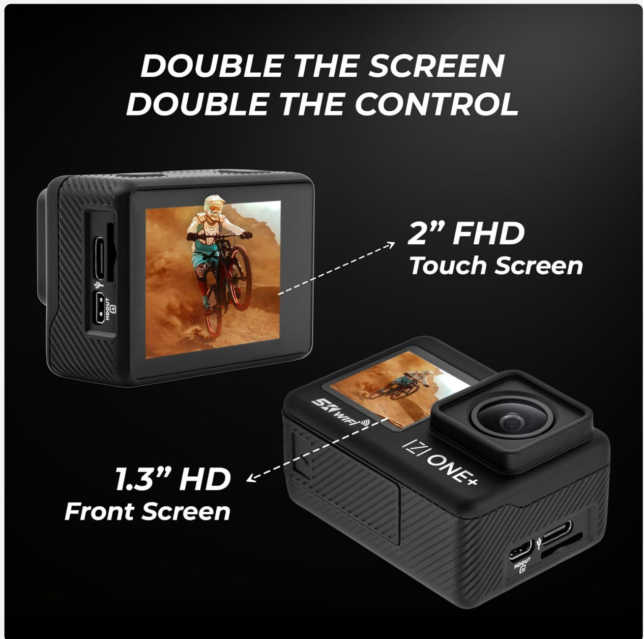
Figure 5: Dual Screen Functionality

framing and control, especially for vlogging and selfies.