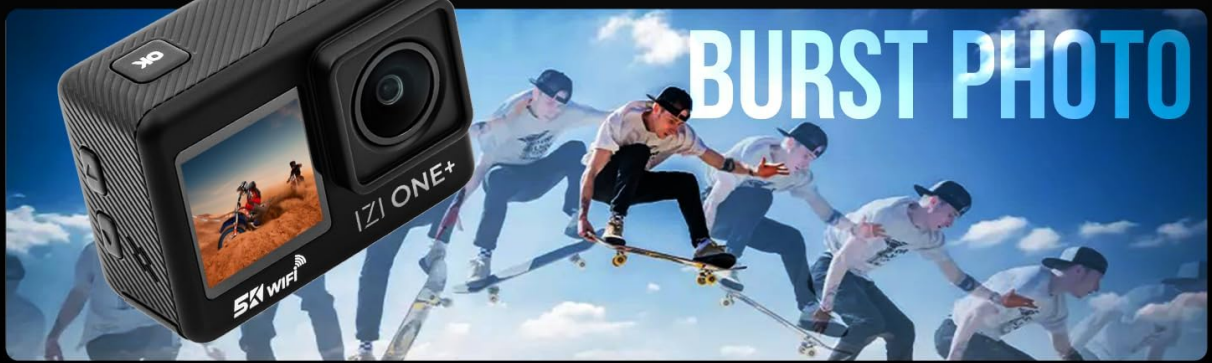
Figure 8: Versatile Shooting Modes