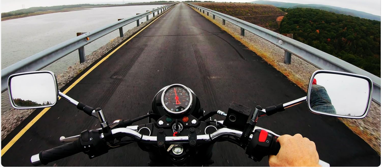
Figure 9: 170° Wide Angle FOV