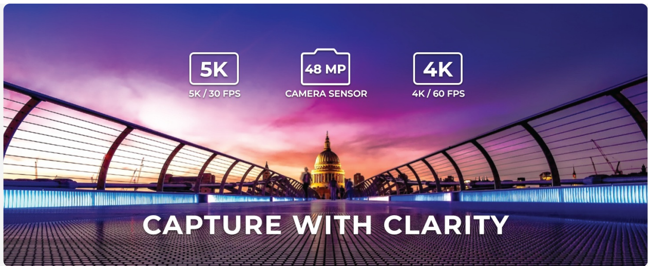
Figure 3: High-Resolution Capabilities