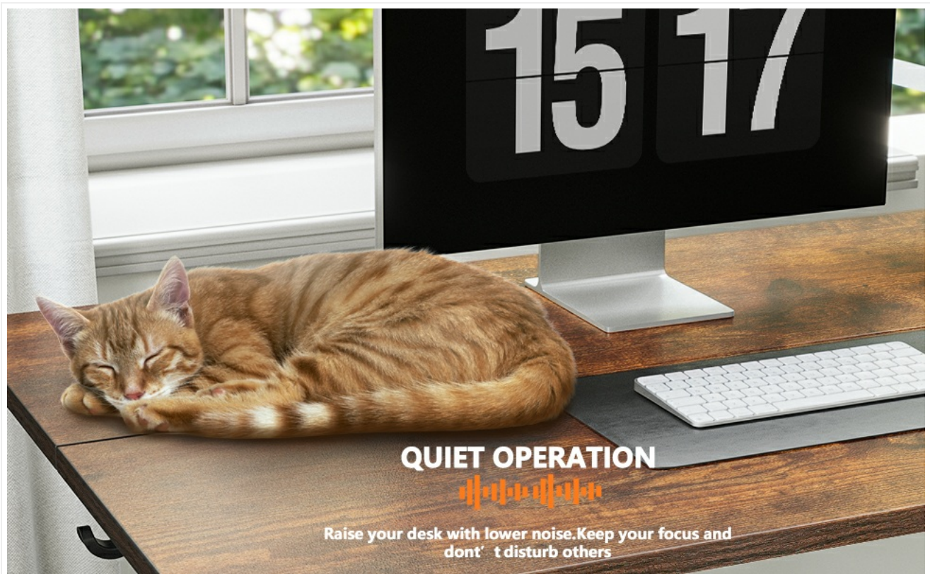
Image: A cat sleeping peacefully on the BANTI standing desk, illustrating its quiet operation.