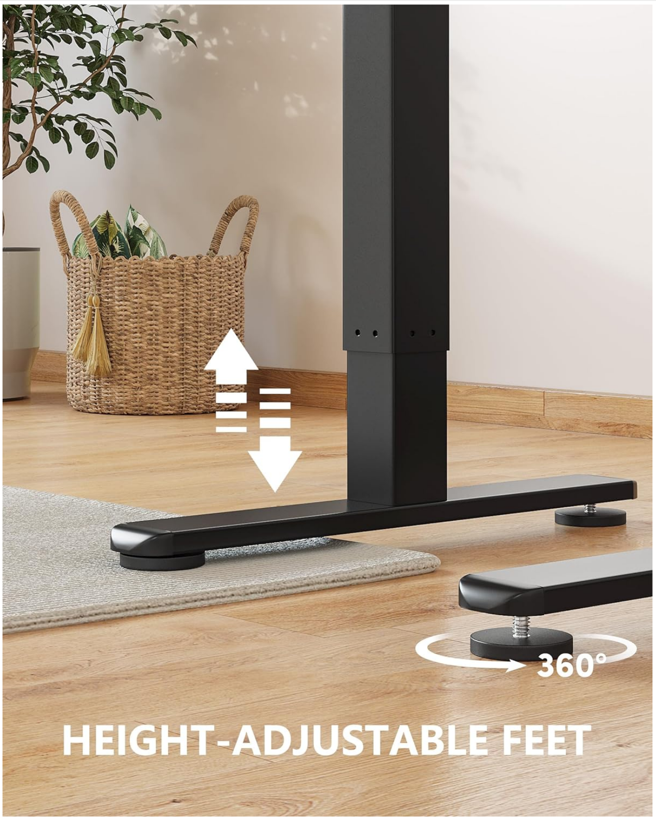
Image: Close-up of the height-adjustable feet on the BANTI standing desk, showing 360-degree rotation for leveling.