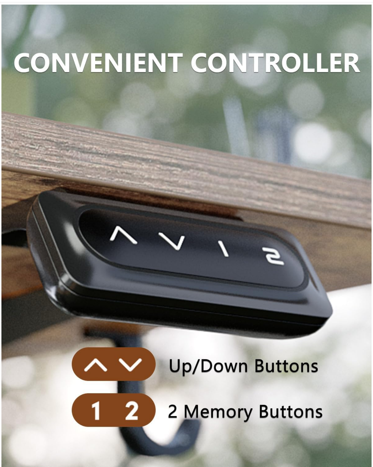
Image: Close-up of the BANTI standing desk control panel, showing up/down arrows and two memory buttons (1, 2).