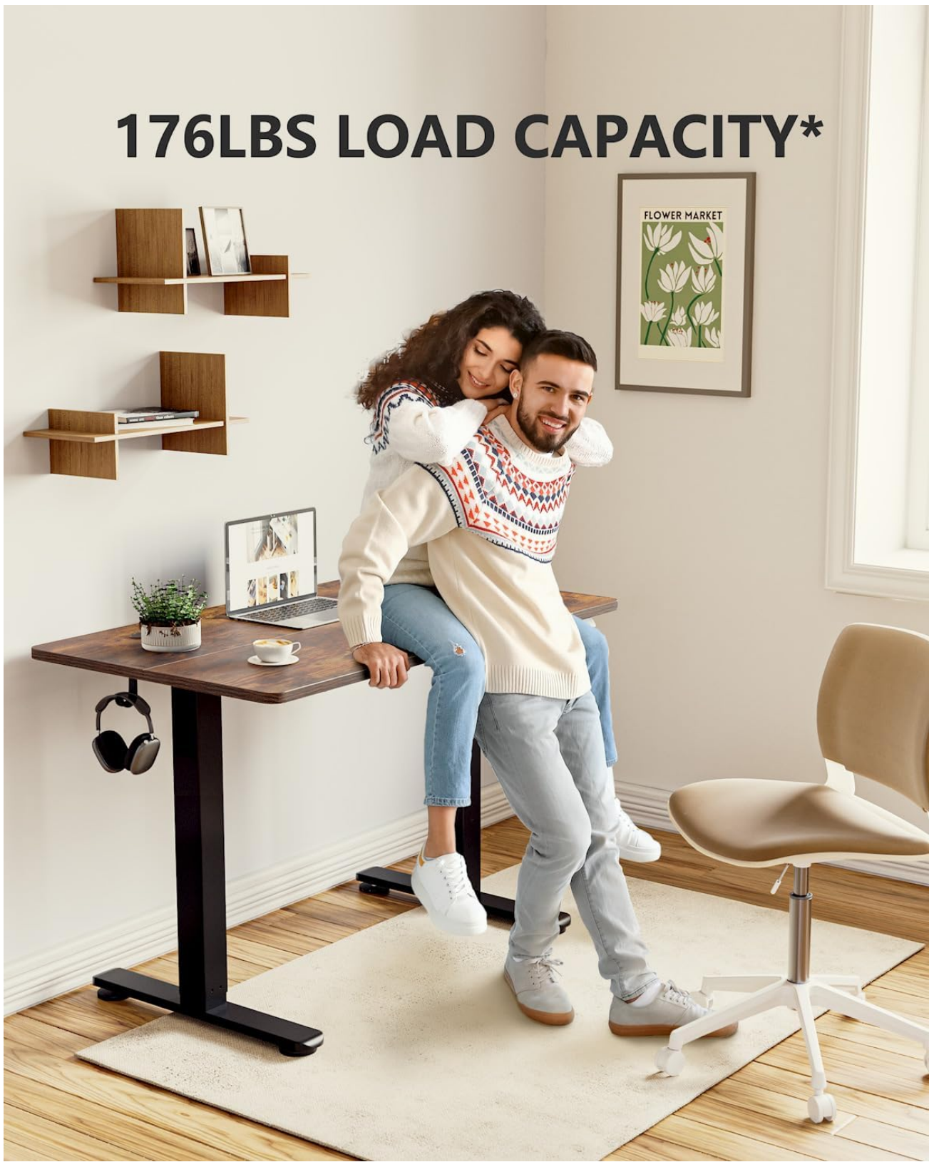
Image: Illustration of the BANTI standing desk supporting a load, highlighting its 176 lbs weight capacity.