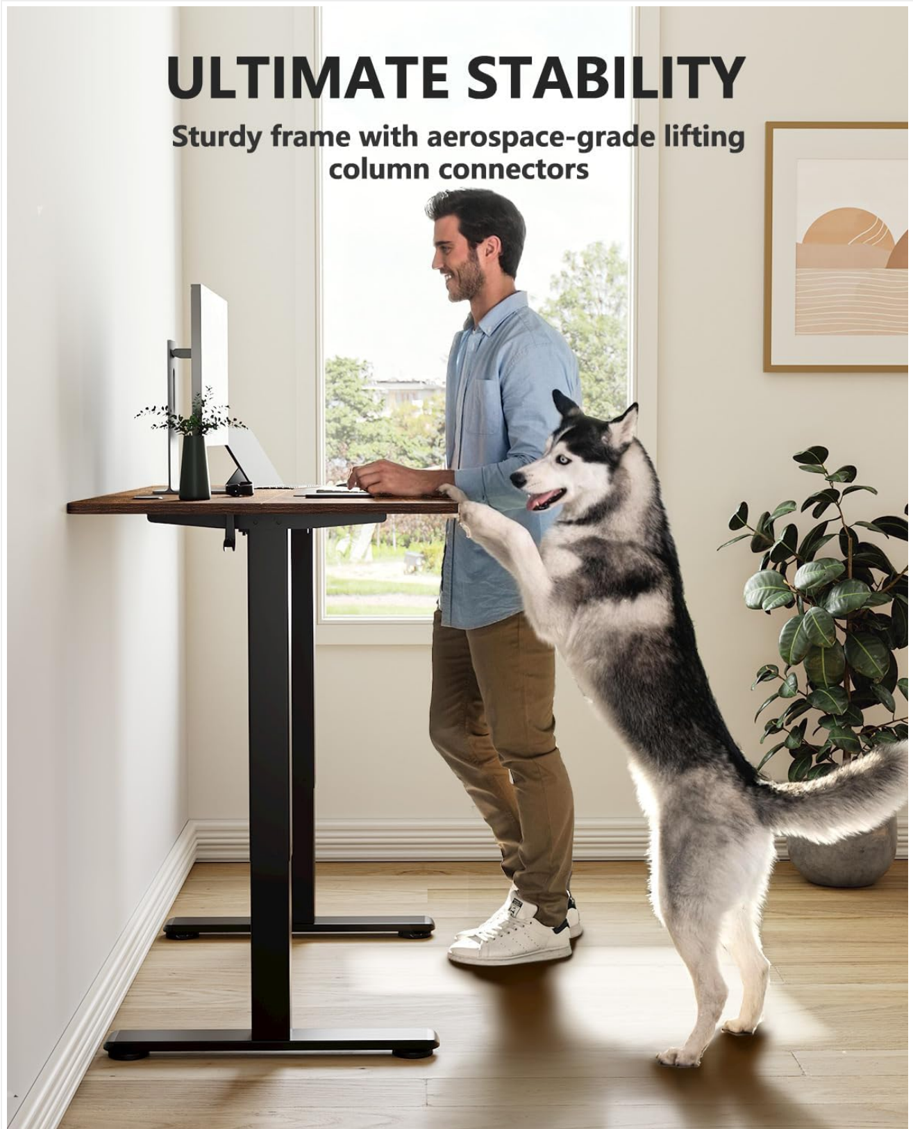
Image: A person standing at the BANTI desk with a dog, demonstrating the desk's ultimate stability with aerospace-grade lifting column connectors.