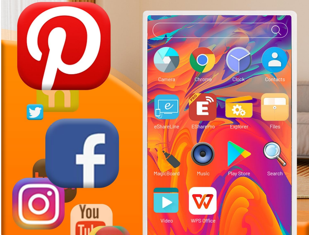
Figure 2: The monitor supports downloading all Google applications, providing access to a wide range of apps from the Google Play Store.