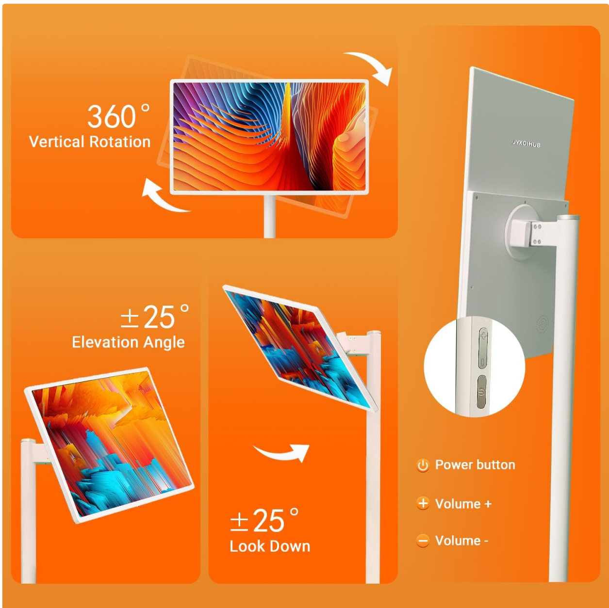
Figure 4: The monitor supports 360° vertical rotation and ±25° elevation angle adjustment. Power and volume controls are located on the side.