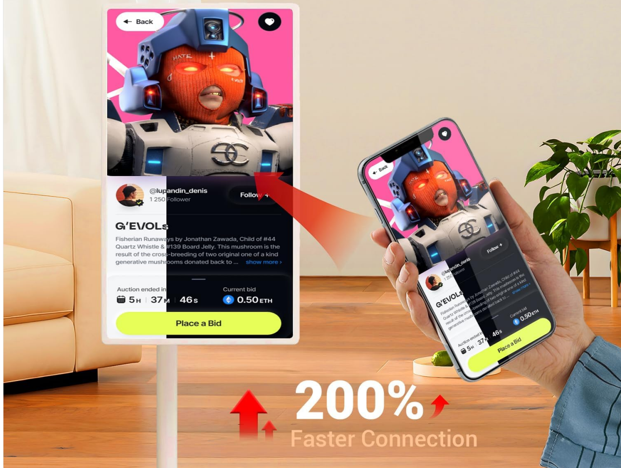
Figure 6: Wireless screen projection allows for quick and efficient display sharing from mobile devices.