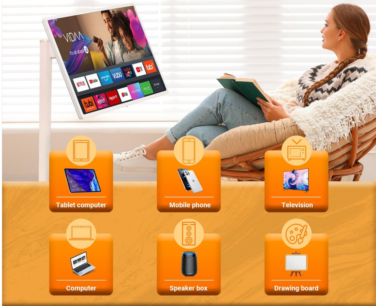
Figure 1: The JYXOIHUB portable monitor can integrate functionalities of six different devices, including tablet computers, mobile phones, televisions, computers, speaker boxes, and drawing boards.