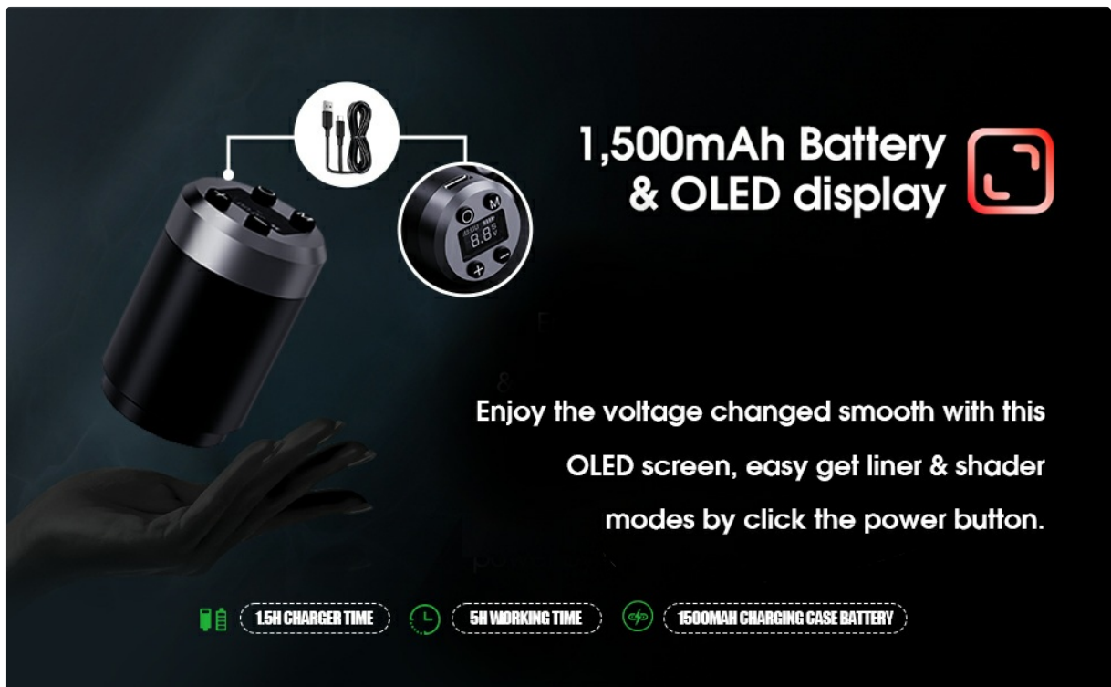
Figure 3.1: Overview of the tattoo machine's control panel and battery.