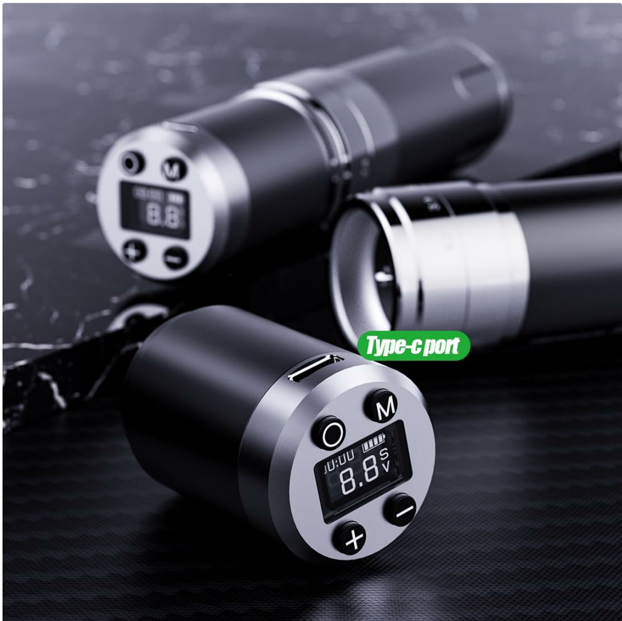
Figure 6.1: Type-C charging port on the battery pack.