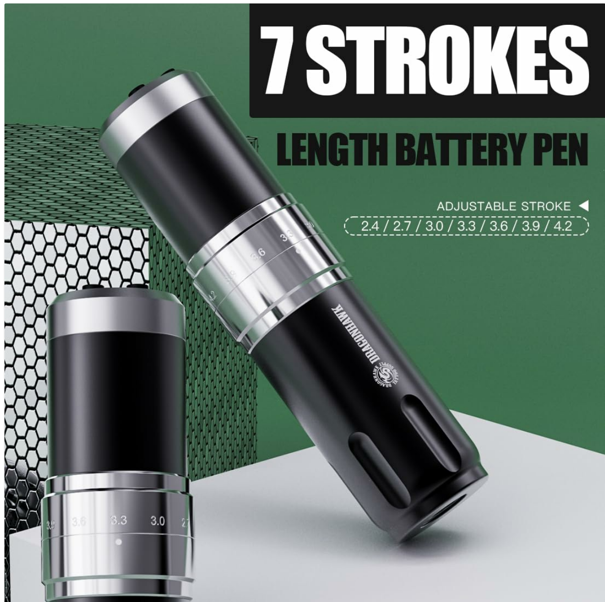
Figure 5.1: Control panel and stroke adjustment.

Familiarize yourself with the control panel for efficient operation.