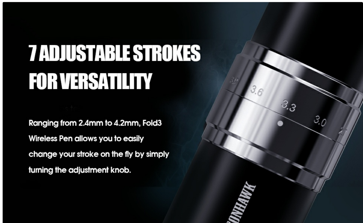
Figure 5.2: Adjusting the stroke length by rotating the knob.