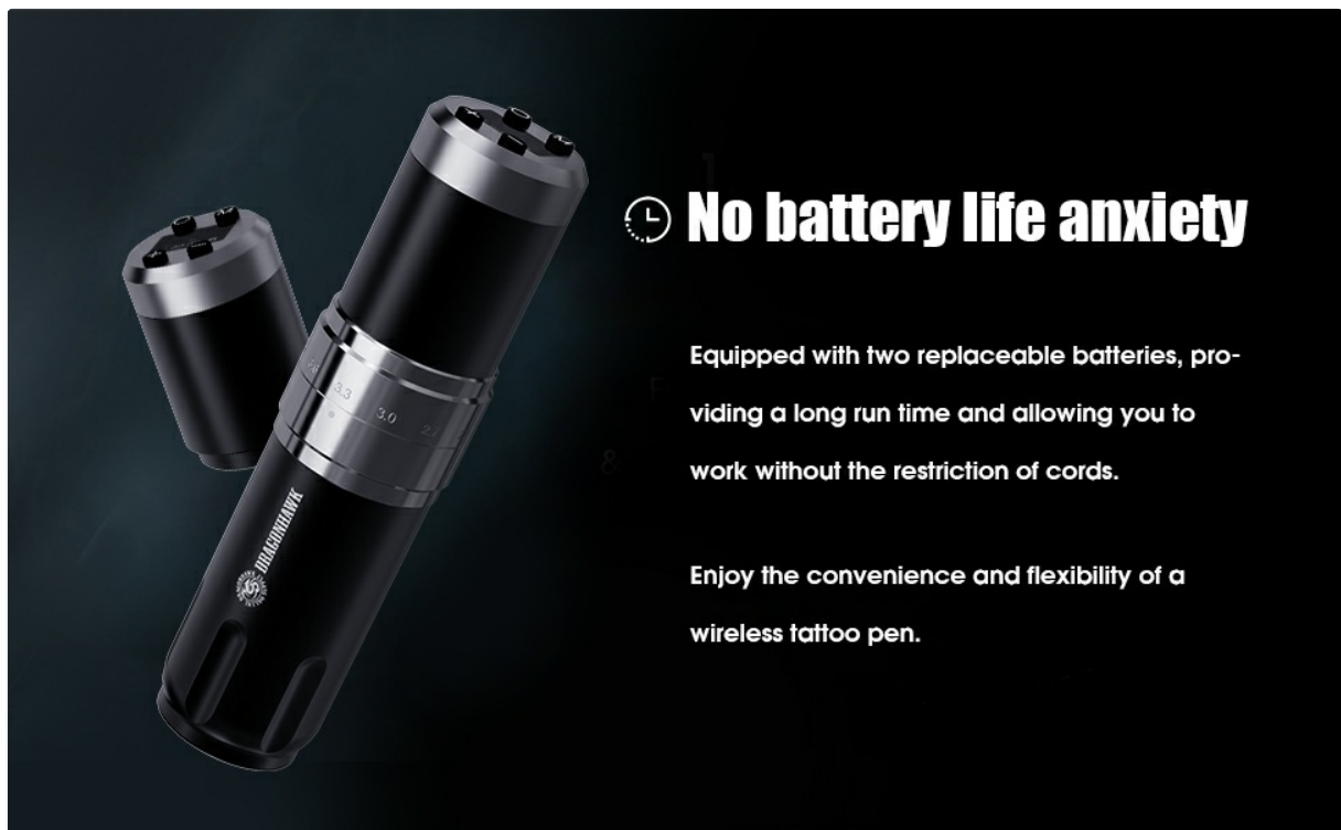
Figure 4.1: The machine is equipped with two replaceable batteries for extended use.