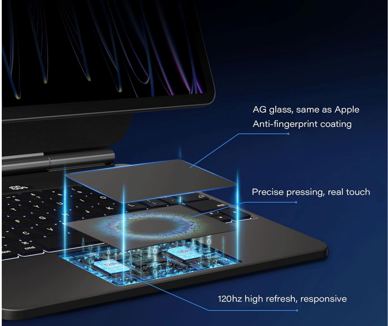
Image: The trackpad features AG glass with an anti-fingerprint coating, offering precise and responsive control.