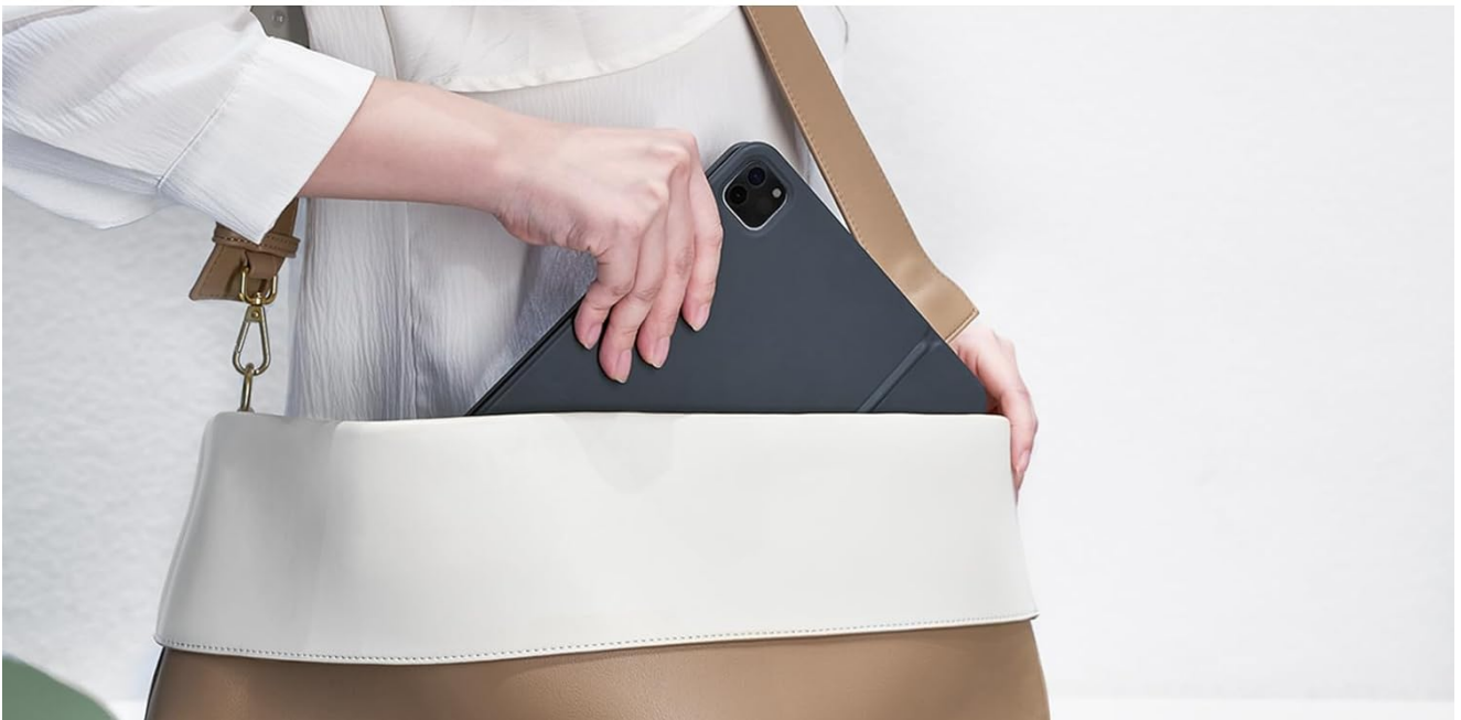
Image: The keyboard case is designed to be portable and lightweight, making it easy to carry.