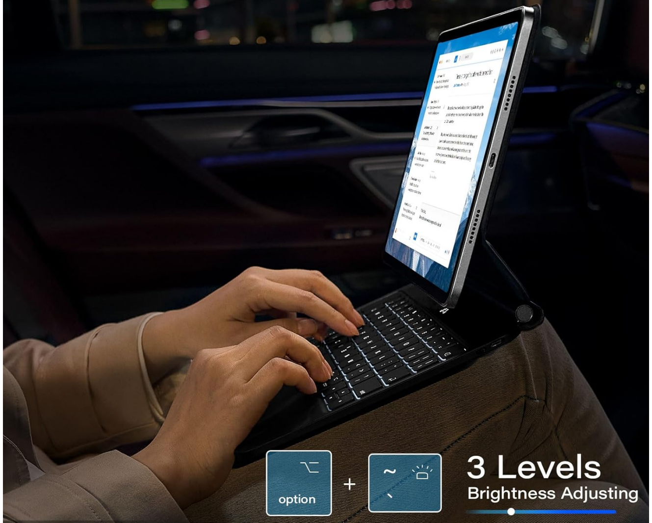
Image: The keyboard offers 3 levels of adjustable backlighting.