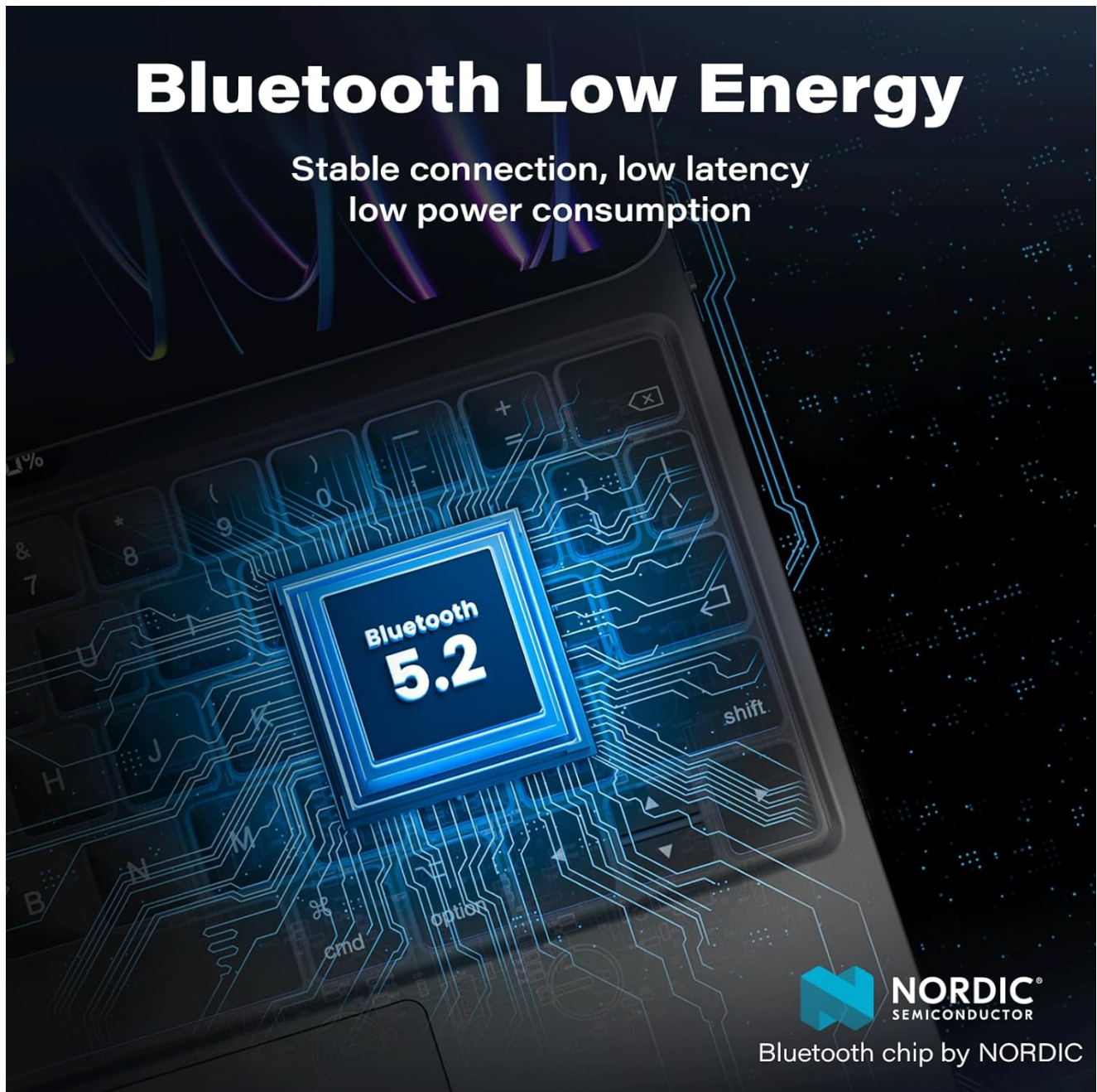
Image: The keyboard utilizes Bluetooth 5.2 Low Energy (BLE) for stable and efficient connection.

If pairing is unsuccessful, turn off the keyboard, disable Bluetooth on your iPad, and repeat the steps.