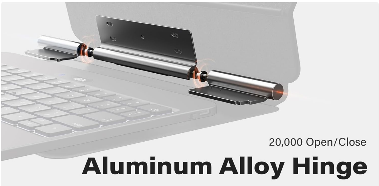
Image: The magnetic stand offers a 135° viewing angle and features a durable aluminum alloy hinge.