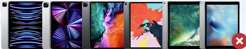
Image: Visual guide for compatible iPad models.

Your browser does not support the video tag.