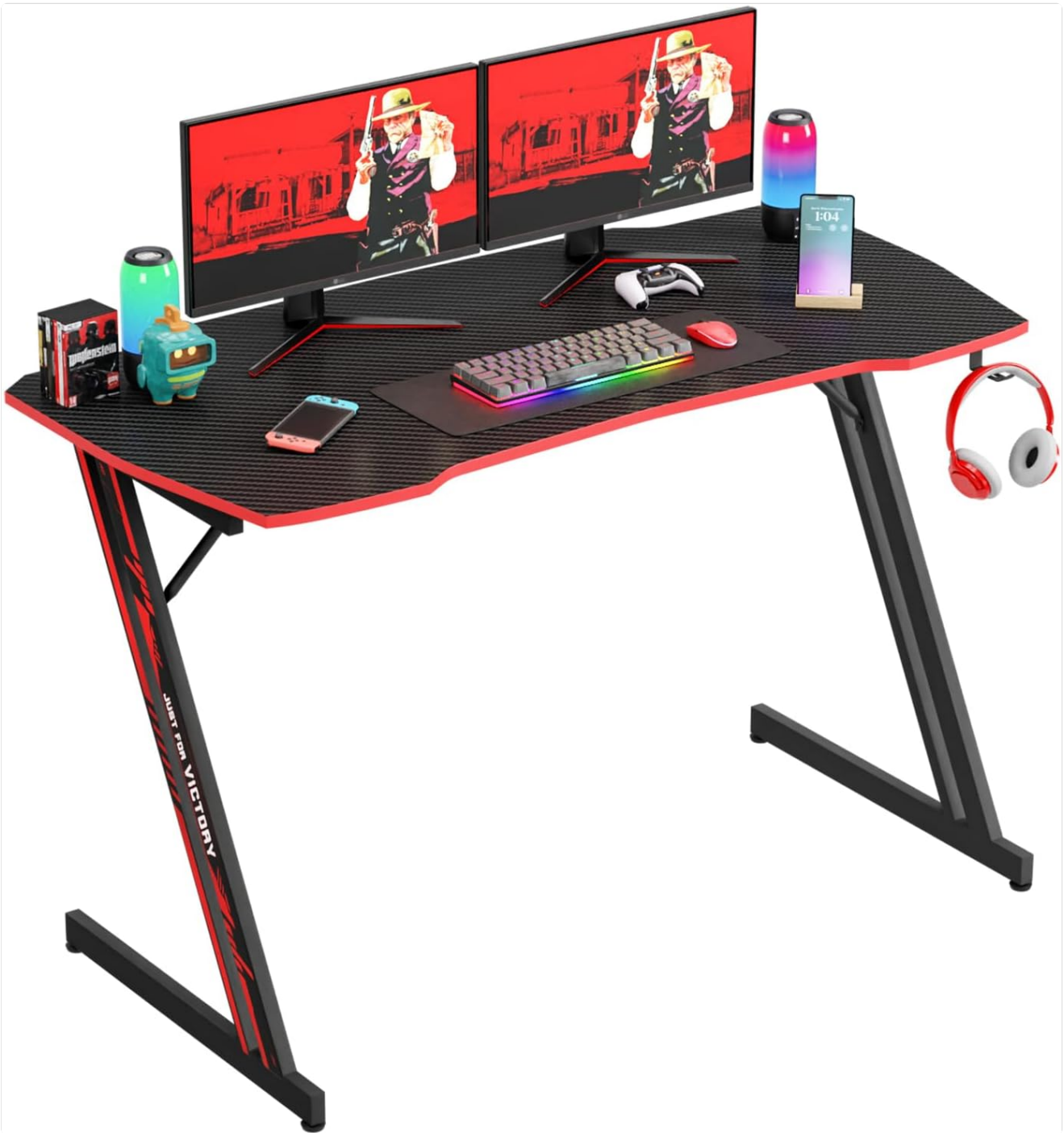
Figure 4: The 47-inch Z-shaped gaming desk in a typical gaming setup, showcasing its capacity for dual monitors and various accessories.