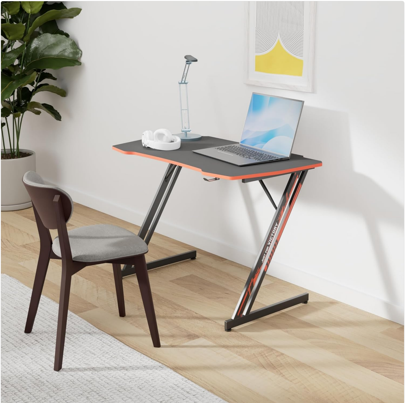
Figure 5: The desk integrated into a home office environment, demonstrating its suitability for work and study with a laptop and minimal accessories.