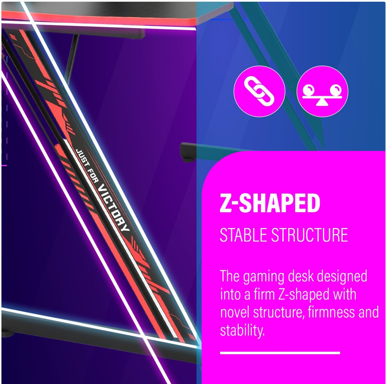
Figure 7: A detailed view of the adjustable leg pads, which allow for leveling the desk on uneven surfaces and enhancing stability.