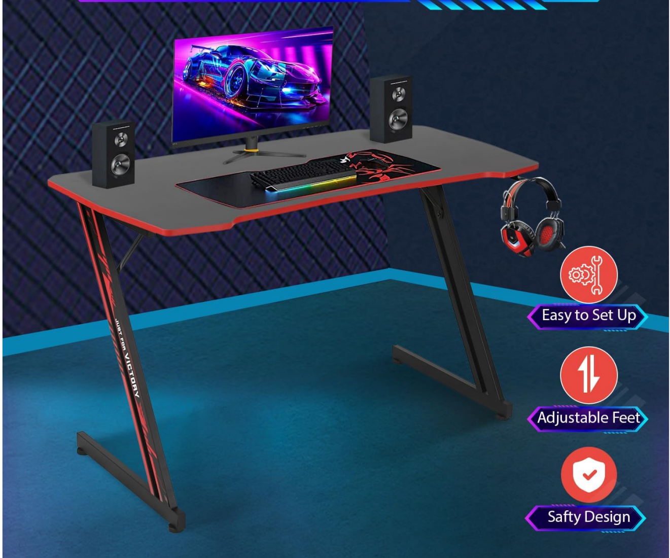
Figure 1: Overview of desk features and ease of setup. This image highlights the multi-functional design, adjustable feet, and safety features.