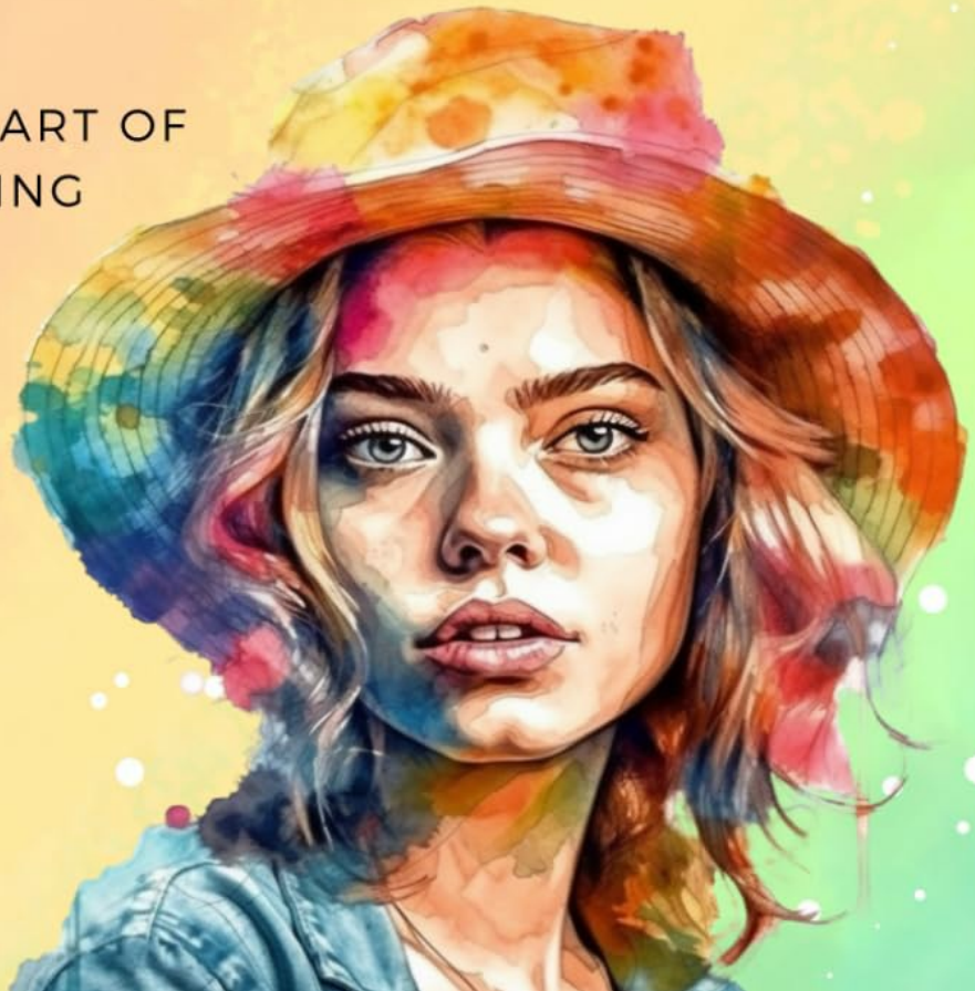
Figure 1: Front cover of the "Adobe Photoshop 2023 Complete Guide for Beginners" book. This image displays the title, author, and a vibrant illustration, representing the creative potential unlocked by the software.

From Basic Tools to Advanced Features in Adobe Photoshop 2023