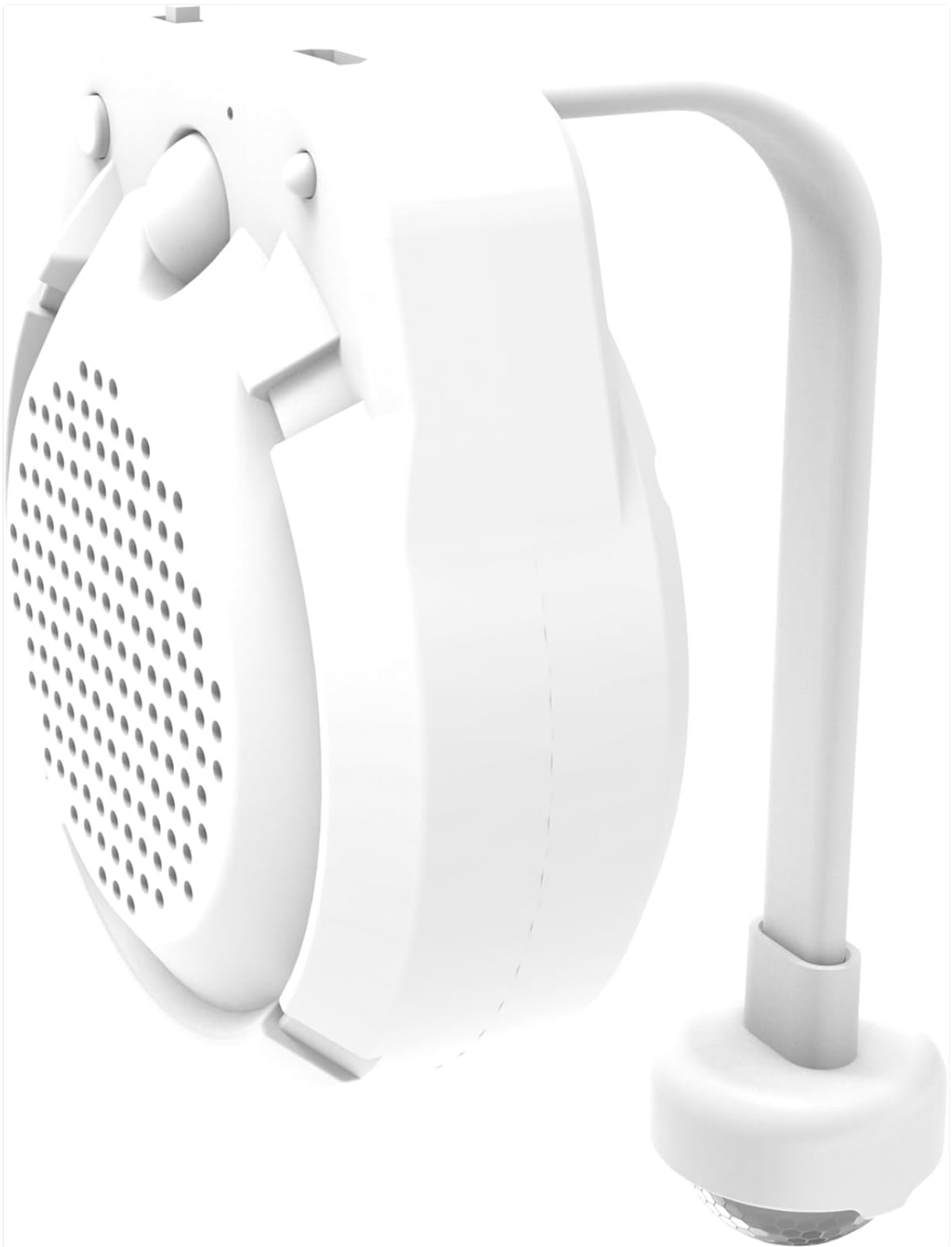
Image: Close-up of the InnoVibe Toilet Disco Speaker Light.