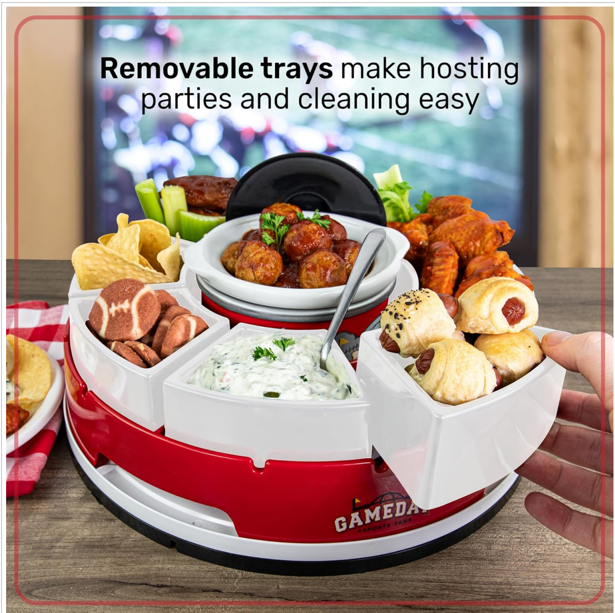
Figure 2: Removable serving trays for easy setup and cleaning.