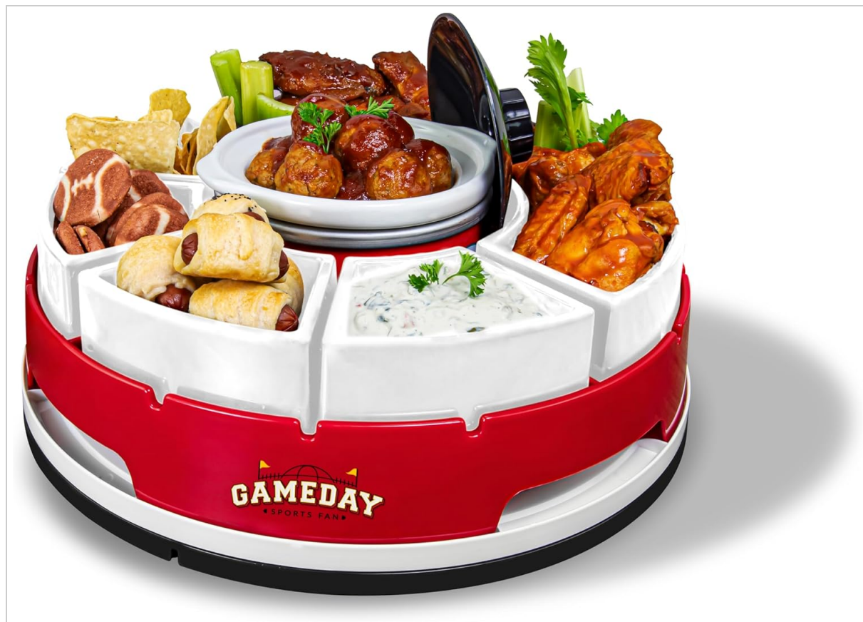
Figure 1: The Nostalgia Gameday Heated Slow Cooker and Lazy Susan Serving Set, fully assembled and filled with appetizers.

This manual provides essential instructions for the safe and efficient use of your Nostalgia Gameday Heated Slow Cooker and Lazy Susan Serving Set. Please read all instructions carefully before initial use and retain for future reference.