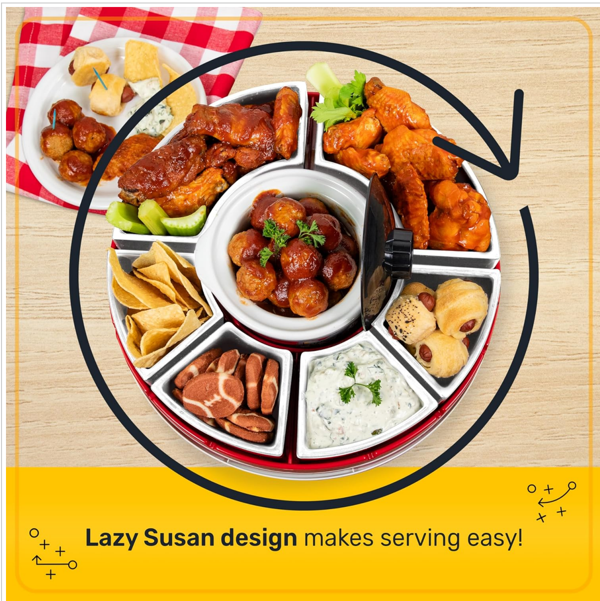
Figure 4: The Lazy Susan design facilitates easy serving for all guests.