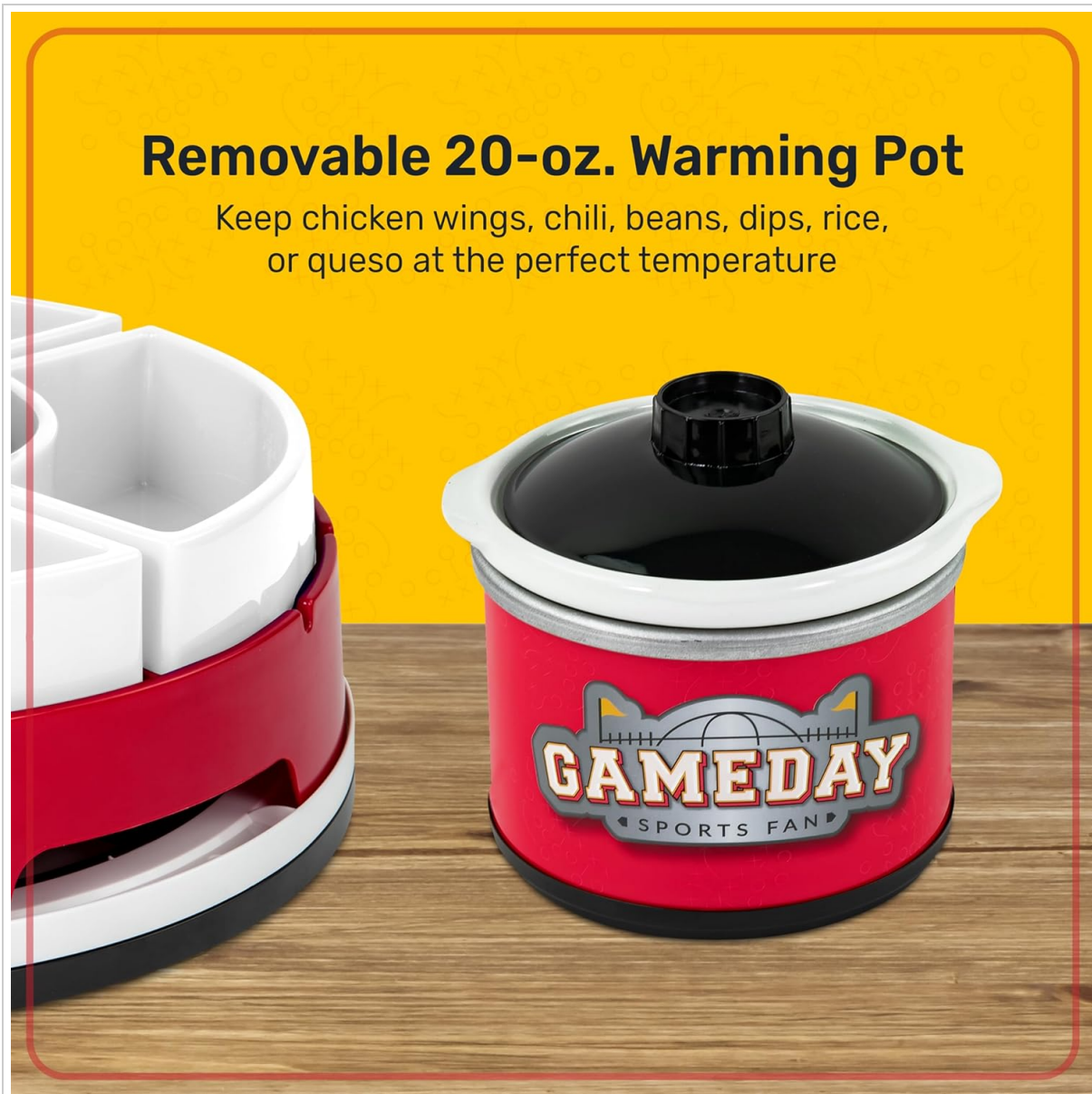
Figure 3: The removable 20-ounce warming pot keeps food at the perfect temperature.