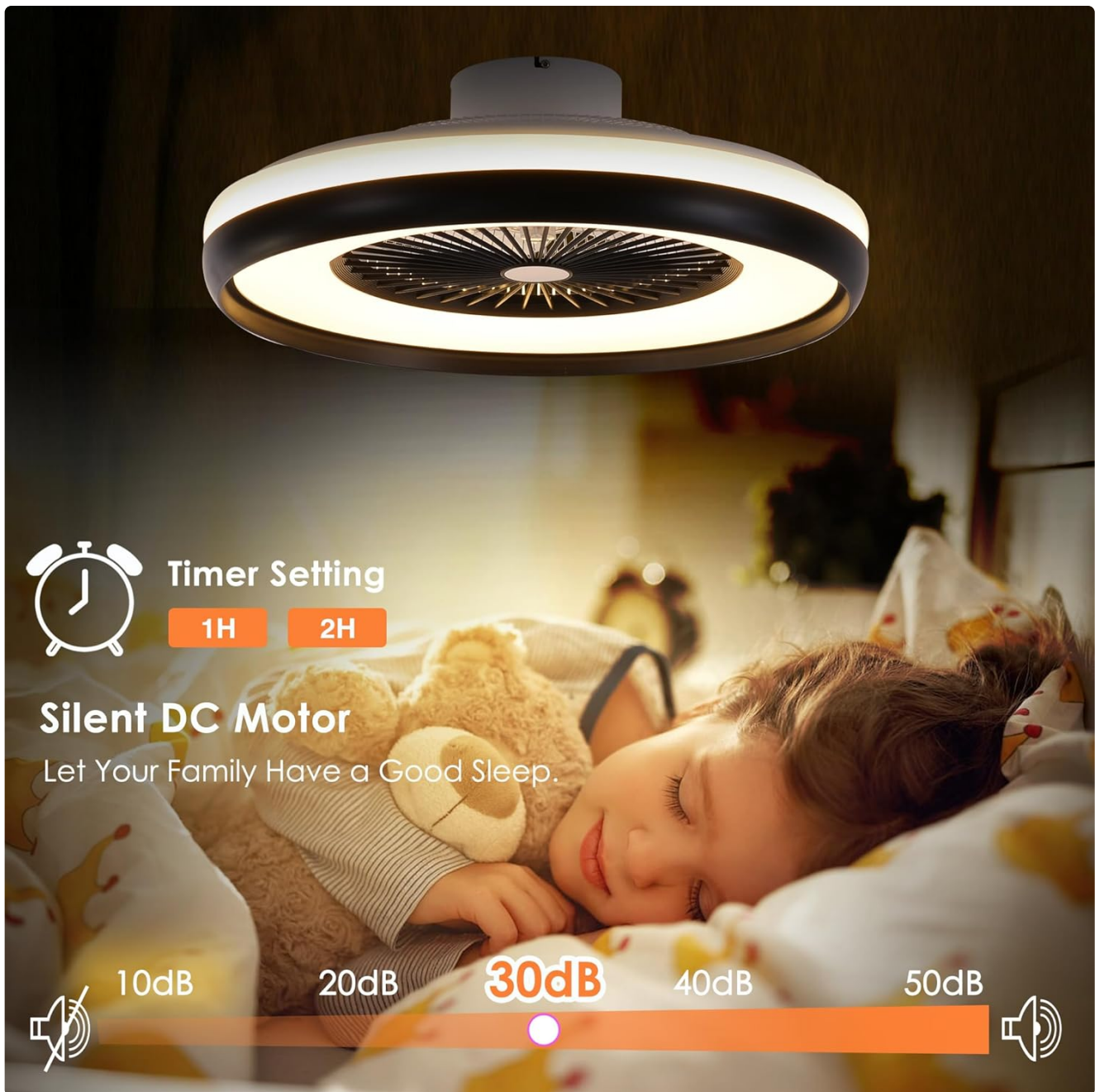
Image: Silent DC motor and timer settings for peaceful sleep.