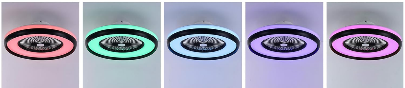
Image: RGB light customization showing various colors around the fan.

Lighting can play a big role in creating the right vibe.