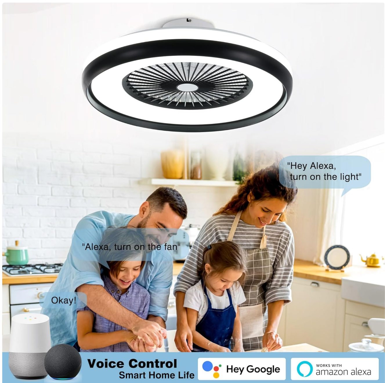
Image: Remote control and smart speakers for voice control.