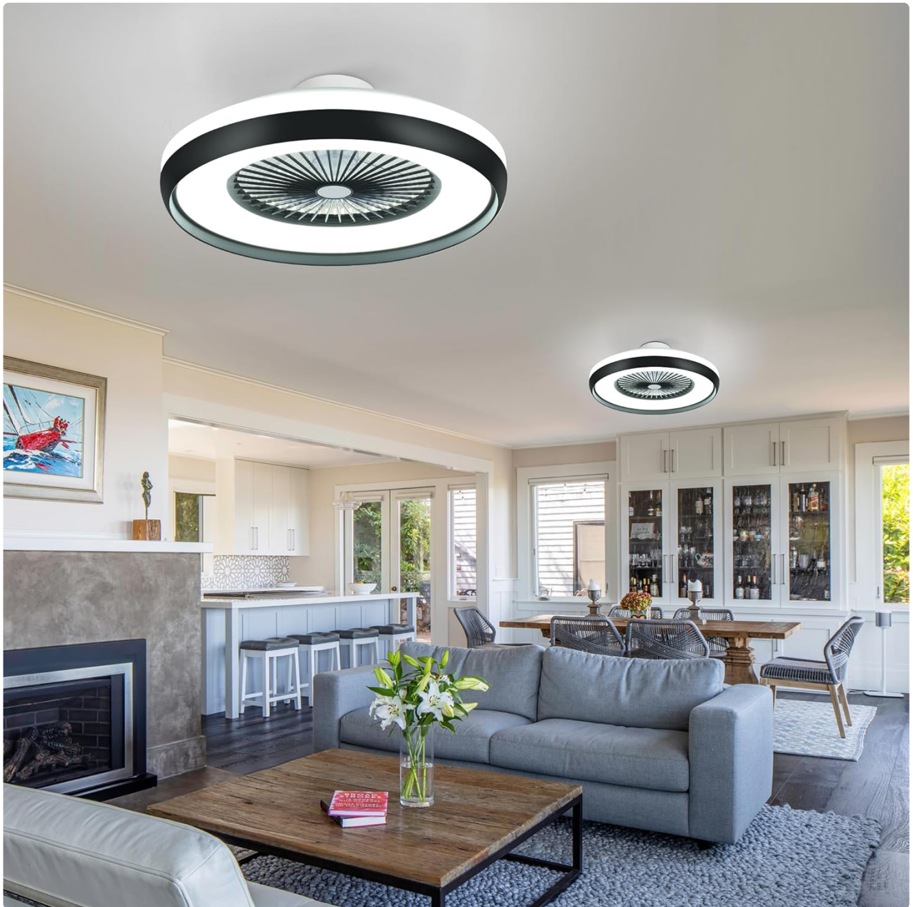
Image: HUMHOLD Bladeless Ceiling Fan installed in a modern living room setting.