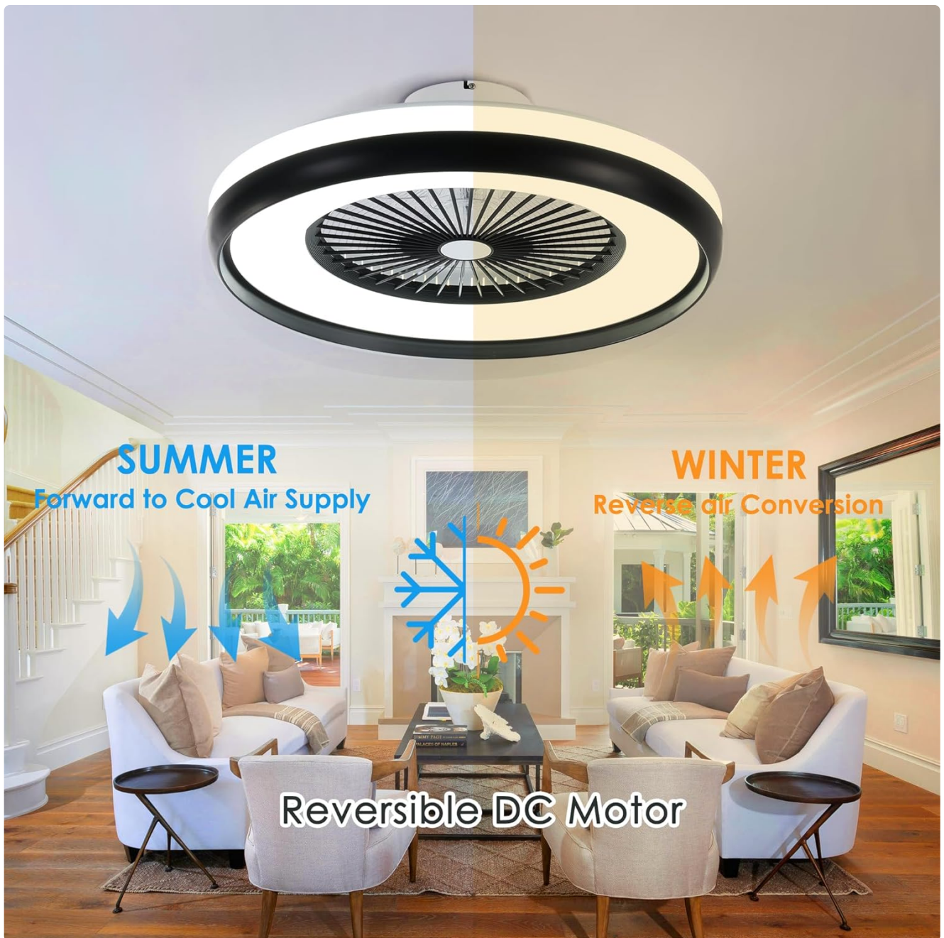
Image: Diagram showing reversible DC motor function for summer and winter.