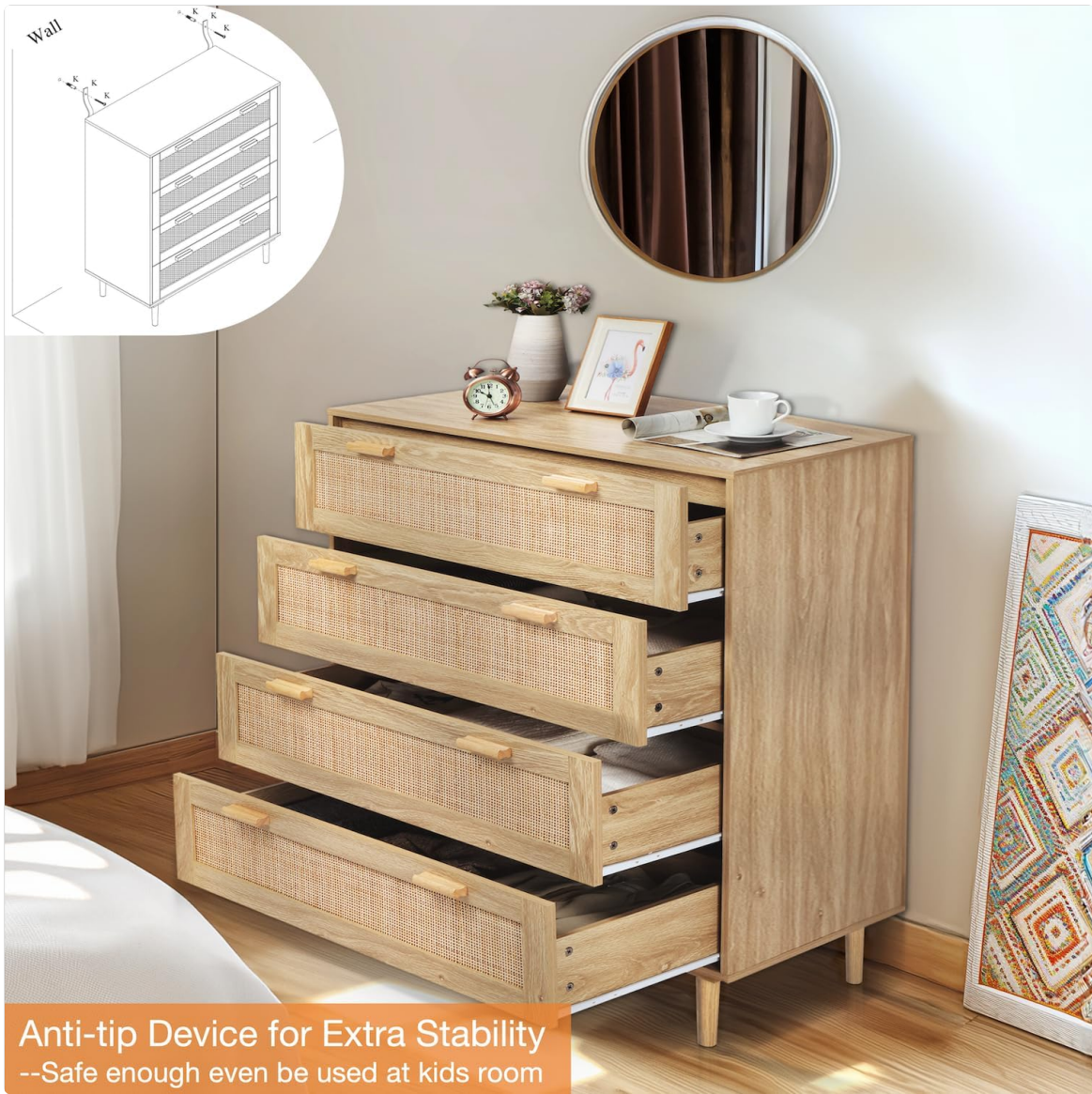
Image 3.2: Detailed view of drawer construction, highlighting natural rattan, thickened bottom board, and smooth metal guide rail.