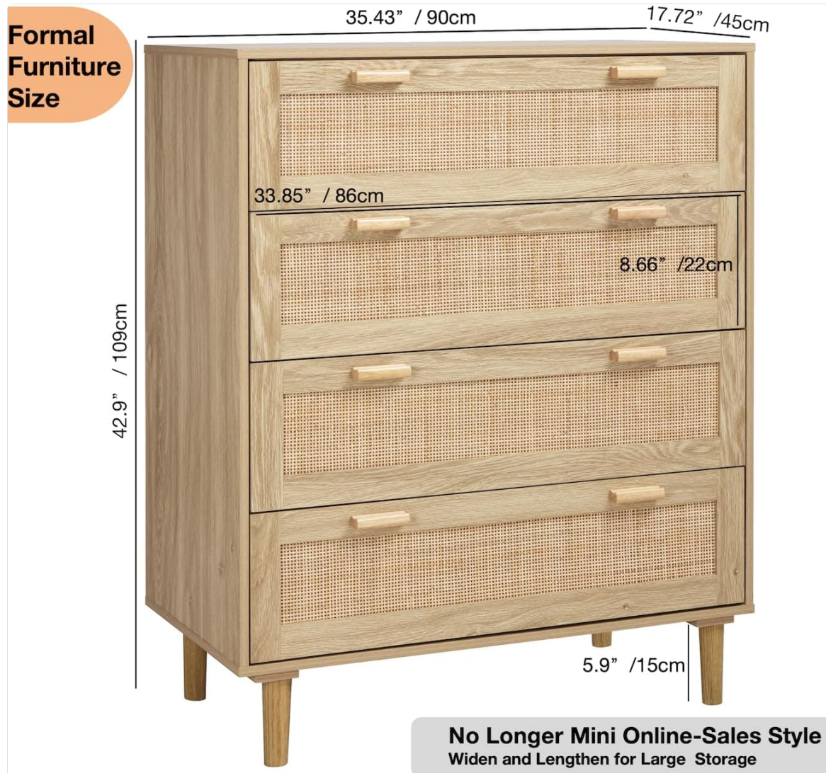
Image 3.1: Overview of dresser dimensions and key components for assembly.