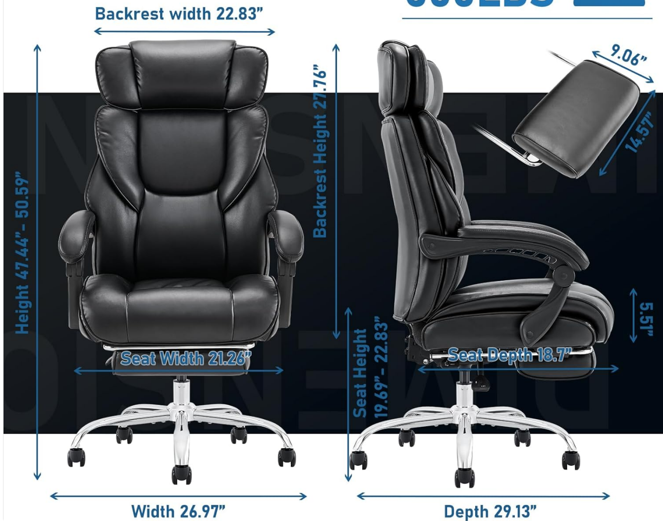
Figure 5: Retractable footrest in use.