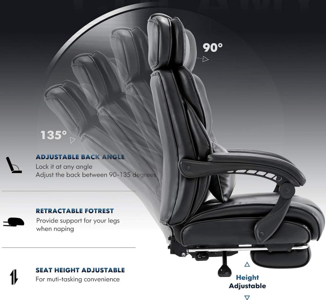
Figure 4: Recline function and other adjustments.