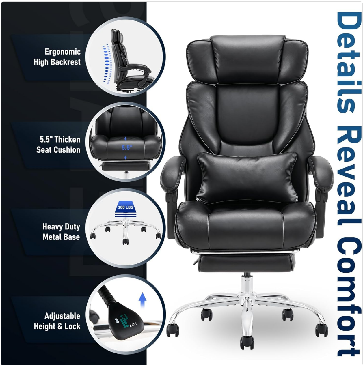
Figure 1: All components of the COLAMY Ergonomic Office Chair laid out for assembly.