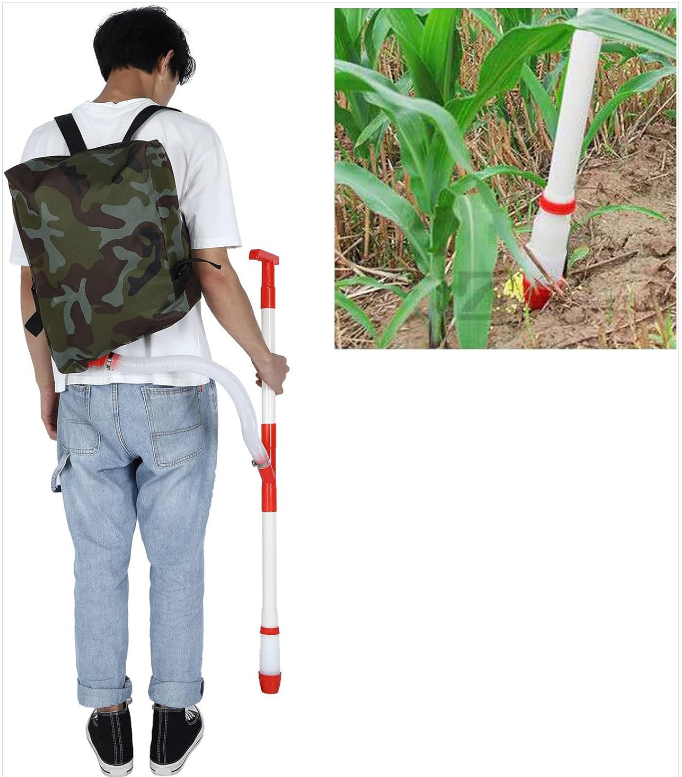
Figure 6.1: Demonstrating the use of the Yosoo Manual Fertilizer Spreader for targeted application in a field.