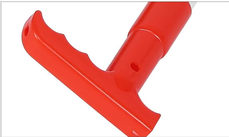
Comfortable handle , not tiring to operate