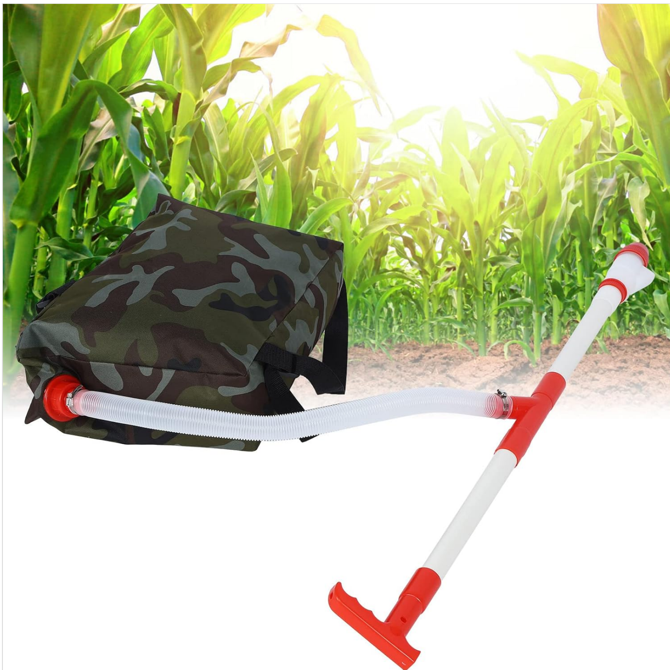
Figure 6.3: The complete Yosoo Manual Fertilizer Spreader system ready for use in a cornfield, highlighting its practical design.