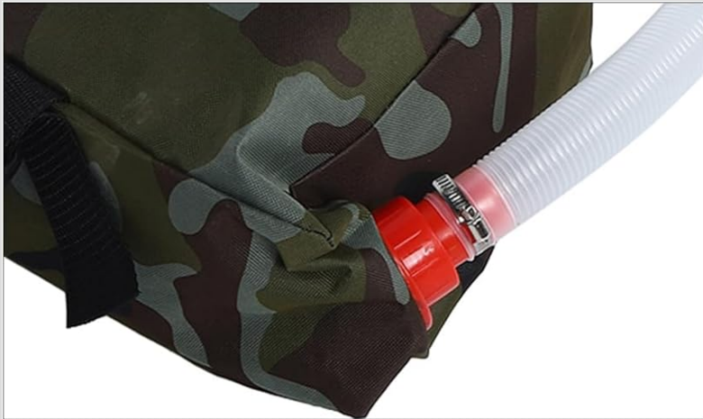
Backpack fertilizer outlet

Familiarize yourself with the main parts of your Yosoo Manual Fertilizer Spreader.