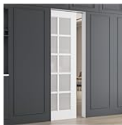
Image: Visual explanation of tempered and frosted glass properties, emphasizing durability and light diffusion.

The 5-Lite frosted glass panels provide privacy while allowing natural light to filter through, enhancing the brightness of your room. The glass is tempered for increased strength and safety, being 8 times stronger than regular glass. It is also SGCC certified with a strengthened anti-scratch surface for daily use.