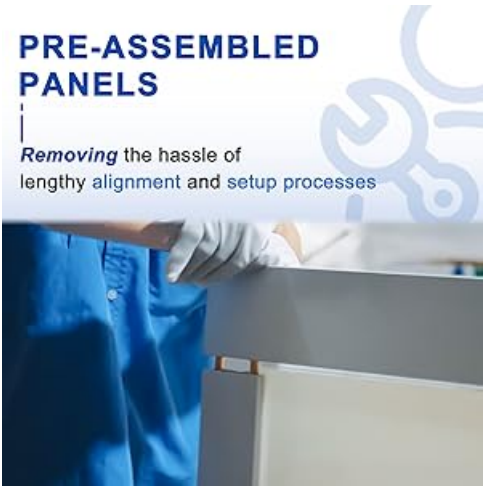
Image: A close-up of a pre-assembled door panel, demonstrating the factory-prepared state for easier installation.

alignment and setup procedures. This ensures a snug fit and reduces installation time.