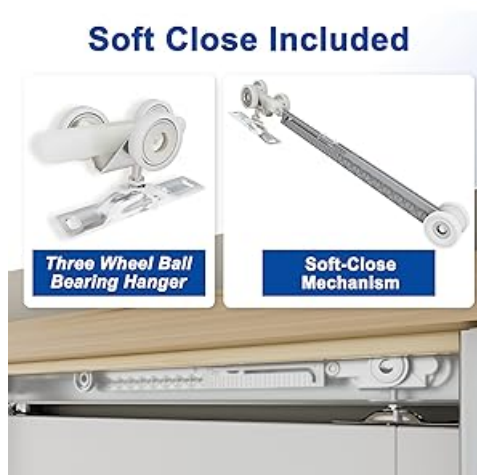
Image: Detailed view of the pocket door components, including the soft-close mechanism, header hanging brackets, bumper, floor brackets, and door guide.