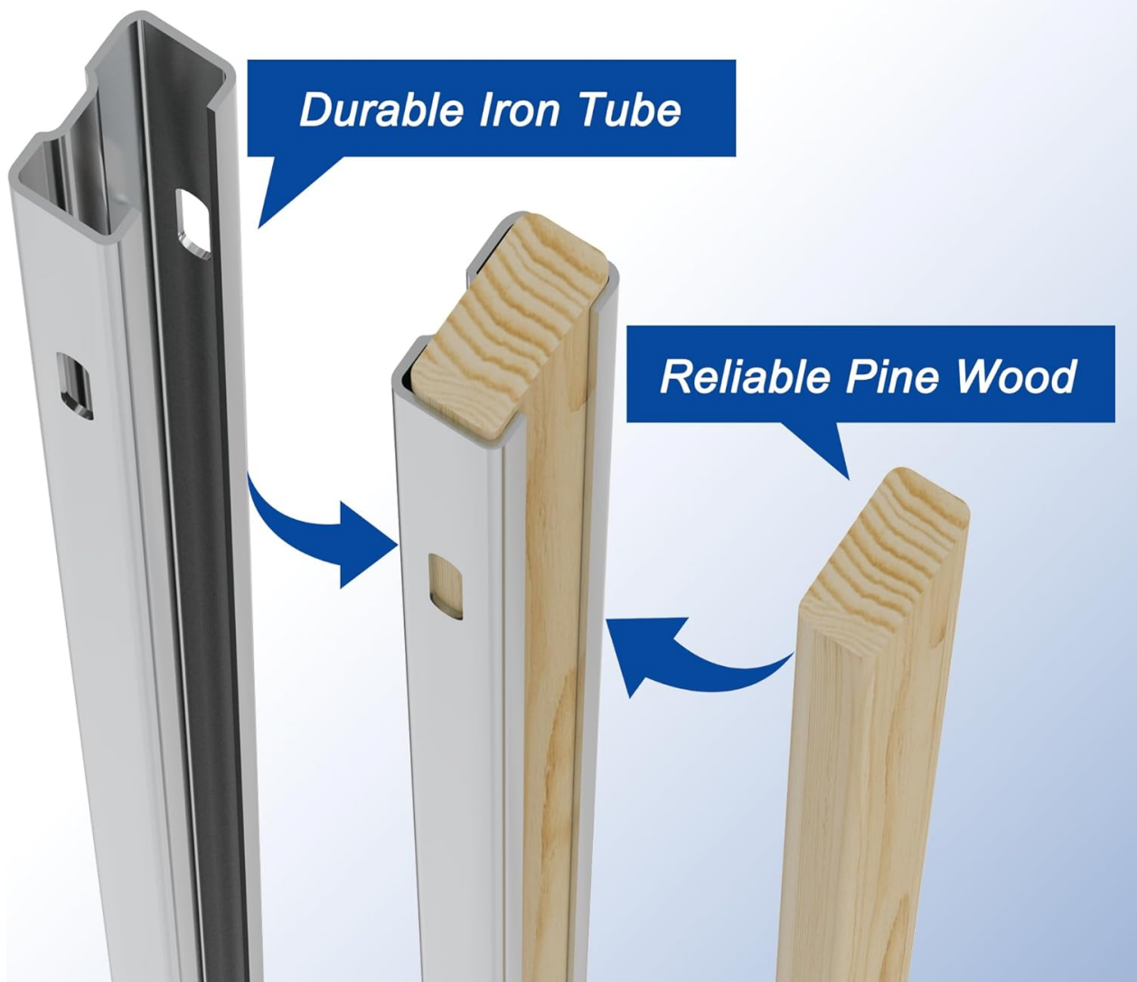
Image: An illustration demonstrating the installation of a pocket door frame within a wall structure.