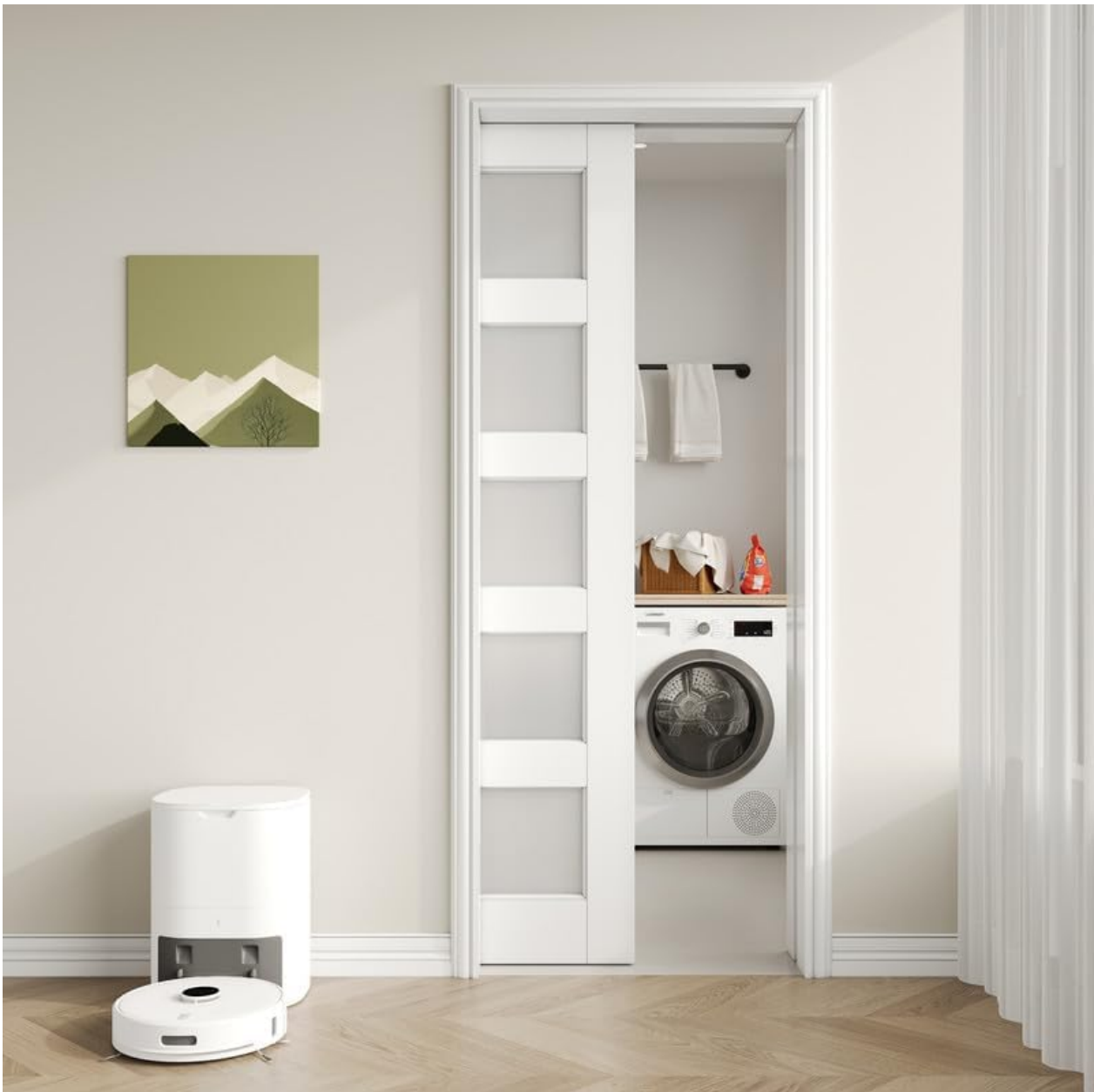
Image: A fully installed WIN STELLAR pocket door, showcasing its space-saving design in a home setting.