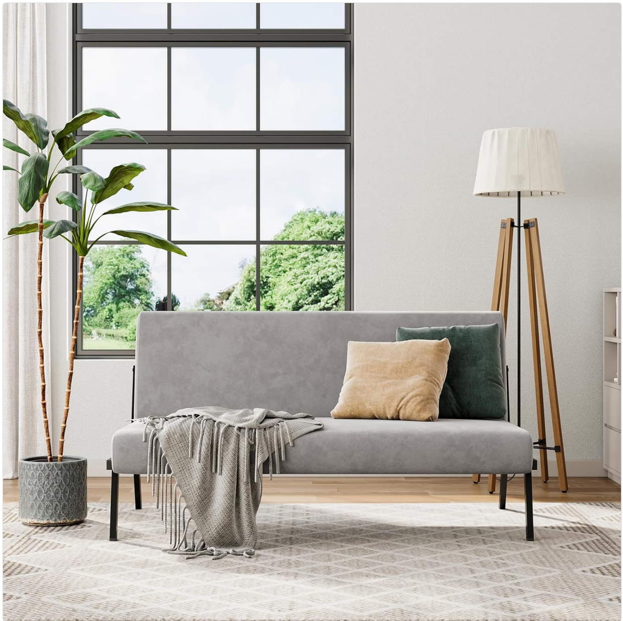
The Dripex 2-Seater Fabric Sofa, designed for modern living spaces.