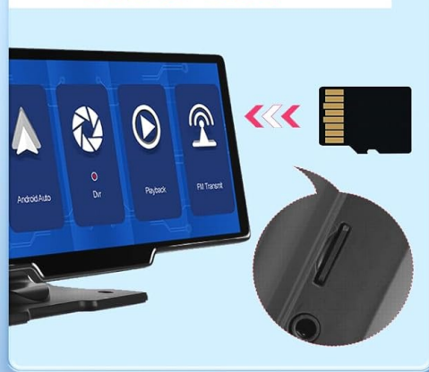
Image: Four panels illustrating key features: built-in speaker, AUX connection, FM transmitter, and 64GB TF card slot.