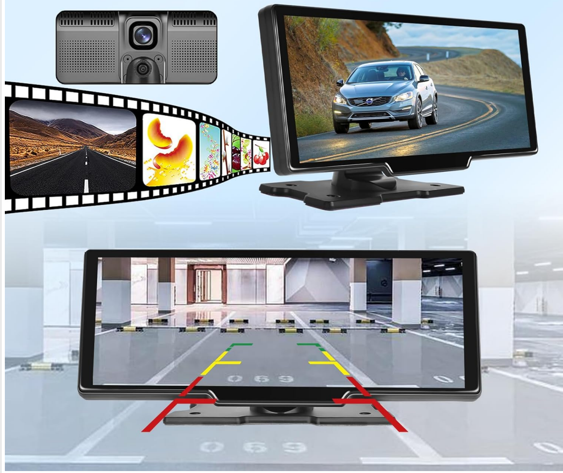
Image: The multimedia player screen showing a front camera view of a road and a rear camera view with parking lines in a parking lot, illustrating 2.5K + 1080P recording capabilities.