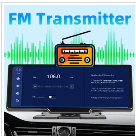
Image: The multimedia player screen displaying the FM transmitter interface with a frequency selection and an FM radio icon.