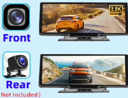
Image: Two screens showing front and rear camera views, indicating the device supports both for comprehensive monitoring.