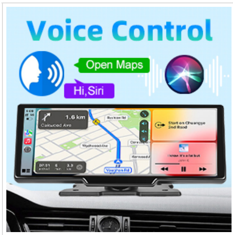
Image: The multimedia player screen showing a navigation map with voice command prompts like "Hi, Siri" and "Open Maps."