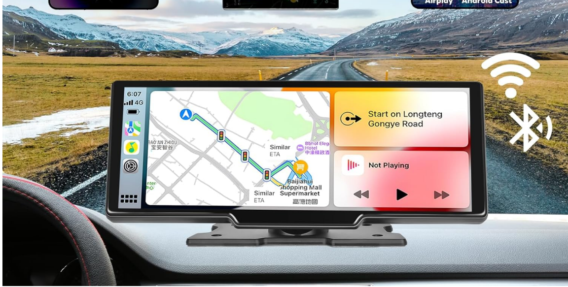
Image: The Podofu portable multimedia player displaying wireless CarPlay and Android Auto interfaces, highlighting music, voice control, navigation, and messaging features.