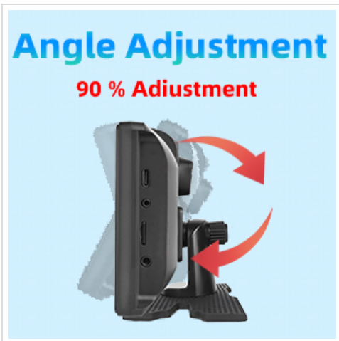
Image: Illustration showing the adjustable angle of the multimedia player's screen on its mount.