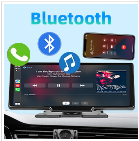
Image: The multimedia player screen showing a music playback interface, with icons for Bluetooth and phone calls, and a smartphone displaying a call screen.