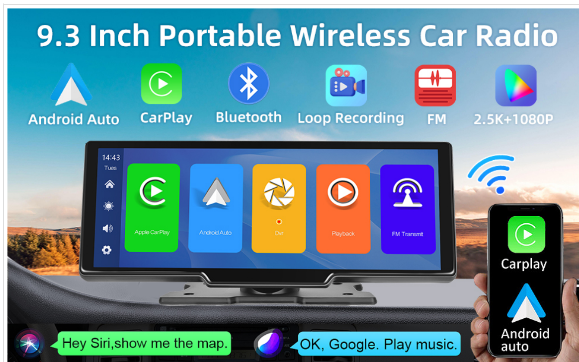
Image: The multimedia player screen displaying the Apple CarPlay interface with various app icons, and a smartphone showing the CarPlay connection.