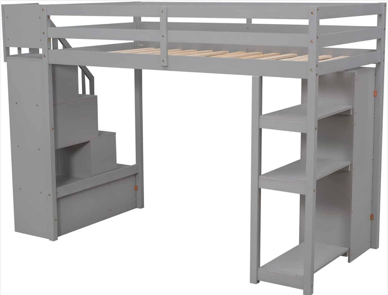
Image 2: Underside view of the loft bed frame, illustrating the wooden slats that support the mattress and ensure proper ventilation.