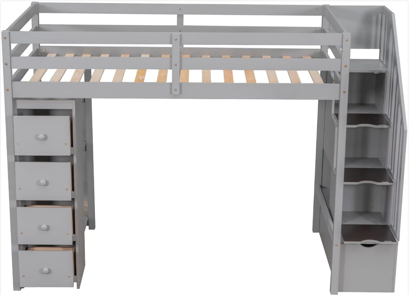
Image 3: Detailed view of the four storage drawers and the open shelving unit integrated into the loft bed structure.