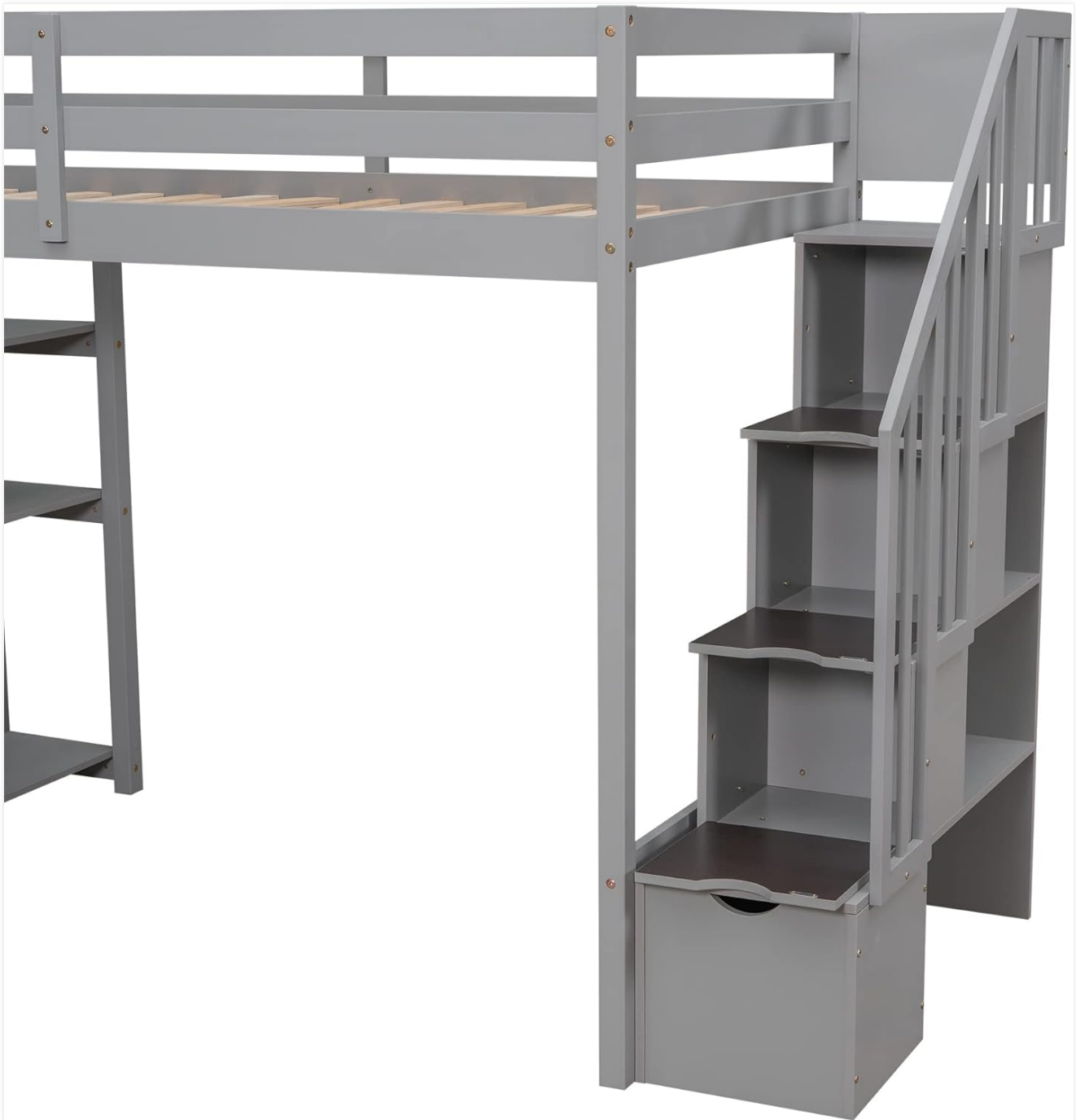
Image 4: Close-up of the staircase, highlighting the three-tier open shelving and the bottom pull-out drawer for additional storage.