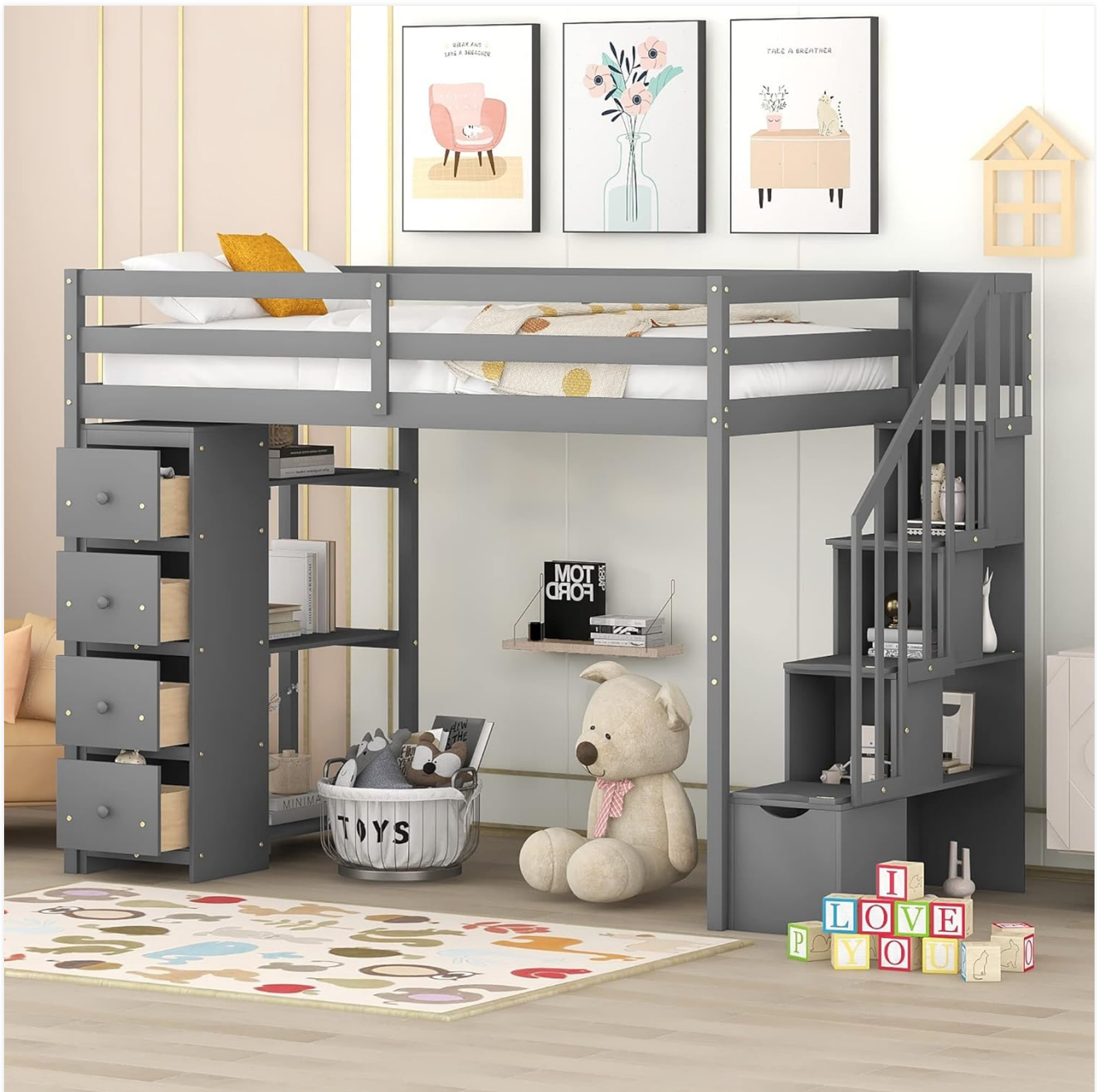
Image 1: Front view of the Brabrey Twin Size Loft Bed, showcasing the elevated bed, four storage drawers, and a staircase with integrated shelving, all in a gray finish.