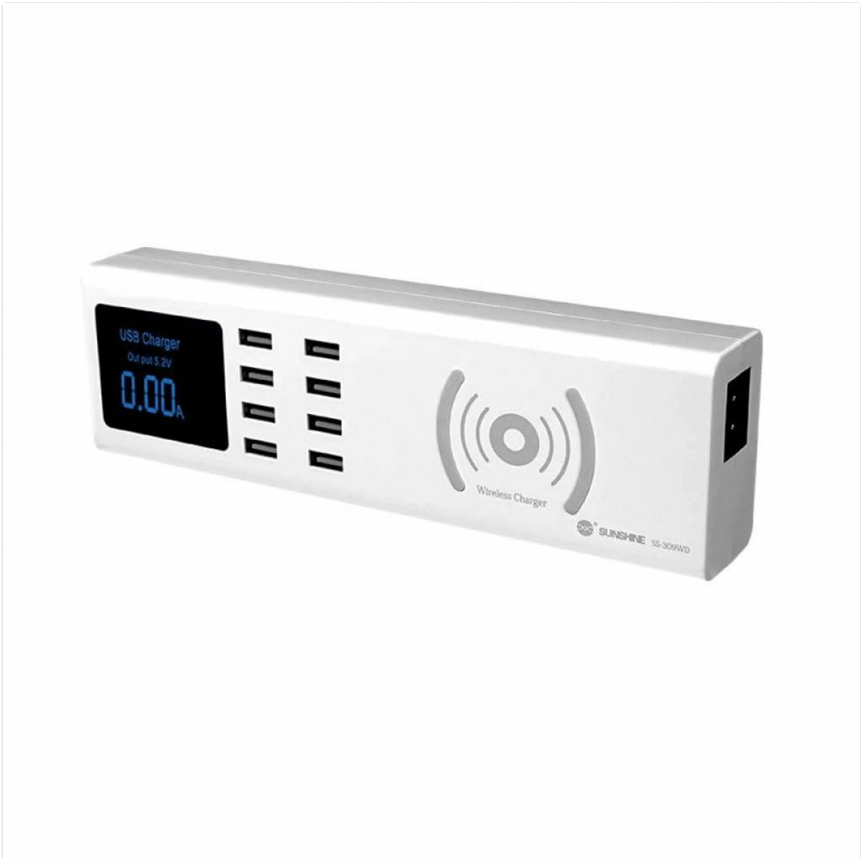
Image: The SUNSHINE SS-309WD charger demonstrating 10W wireless charging capability with a smartphone.