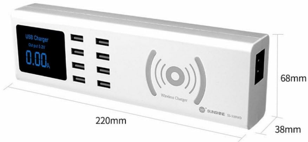
Image: Product dimensions for the SUNSHINE SS-309WD charger.

Note: Manual measurement will have \pm tolerance, which is for reference only, please refer to the actual product