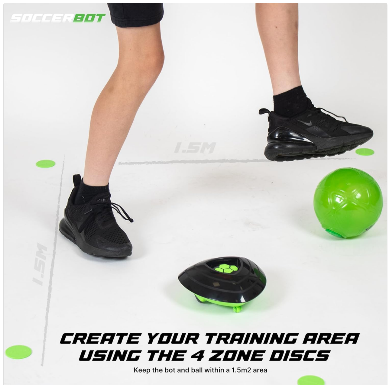
Image: A training setup showing the Soccer Bot, ball, and four green discs on the floor, indicating a recommended 1.5m square play area.