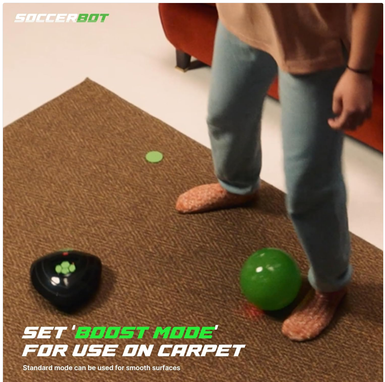
Image: The Soccer Bot and ball on a carpet, demonstrating the 'Boost Mode' for enhanced movement on softer surfaces.