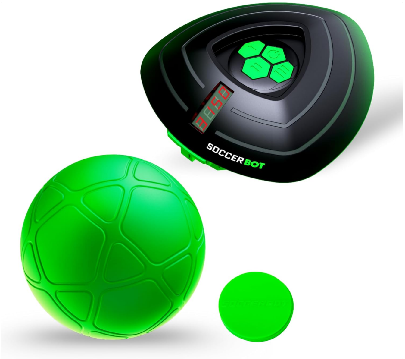
Image: The Soccer Bot, a green soccer ball, and one of the green smart discs, illustrating the main components included in the box.