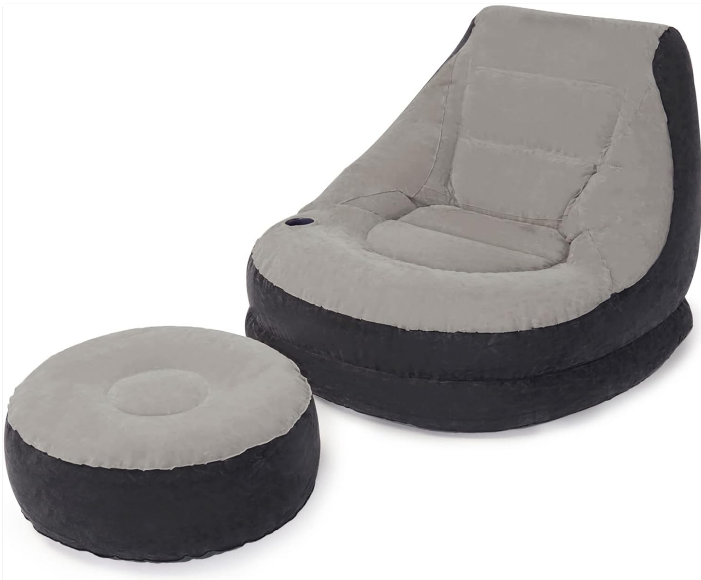
Figure 1: Intex Inflatable Ultra Lounge with Ottoman, showcasing the chair and separate ottoman.