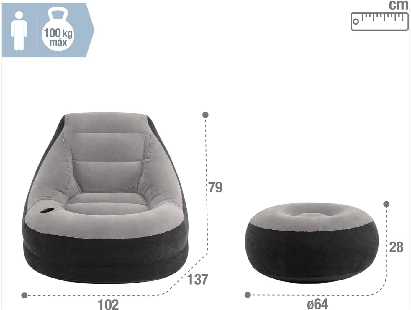
Figure 2: Diagram showing the approximate dimensions of the Intex Ultra Lounge chair (102cm x 137cm x 79cm) and ottoman (64cm diameter x 28cm height).