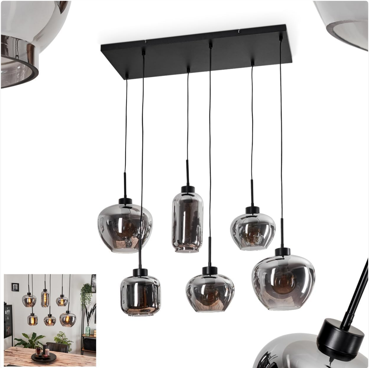
Image 1.1: The Hofstein Talok H3669037 suspension lamp, showcasing its six smoked glass shades and black metal ceiling fixture.