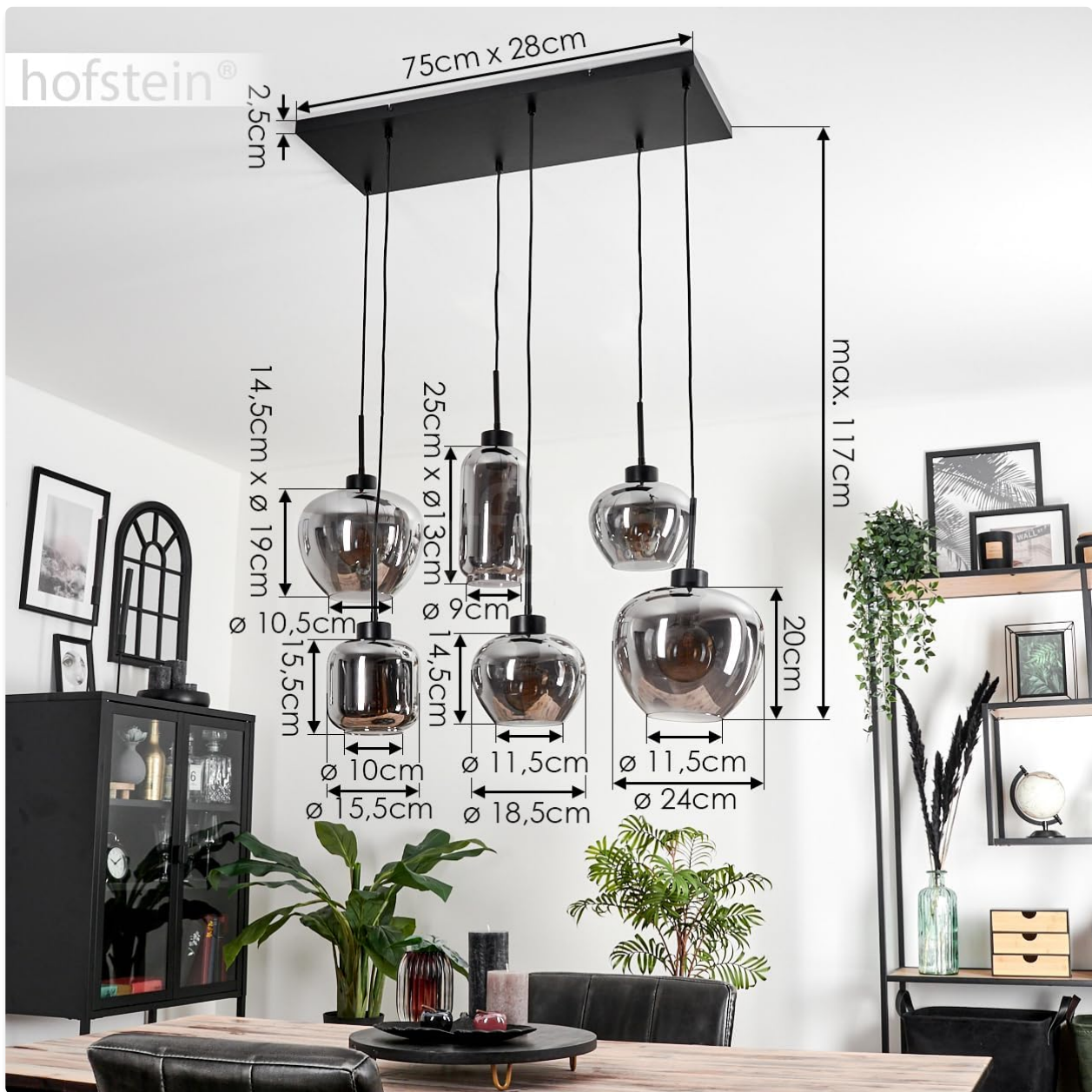
Image 4.1: Detailed dimensions of the Talok suspension lamp, including the ceiling plate and individual shades.