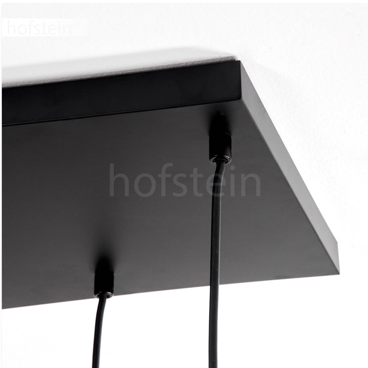
Image 5.1: Detail of the ceiling plate, illustrating how the suspension cables connect and can be adjusted.