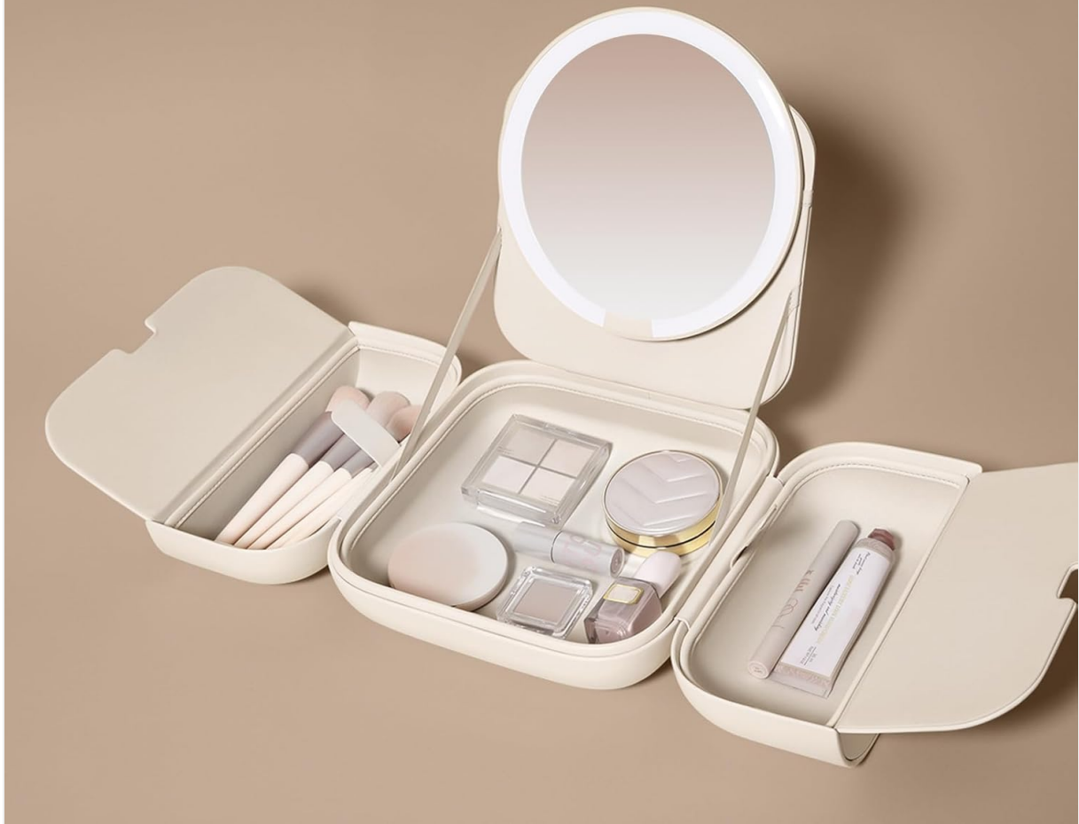
Image: The interior of the makeup bag showing the mirror and storage compartments filled with cosmetics.