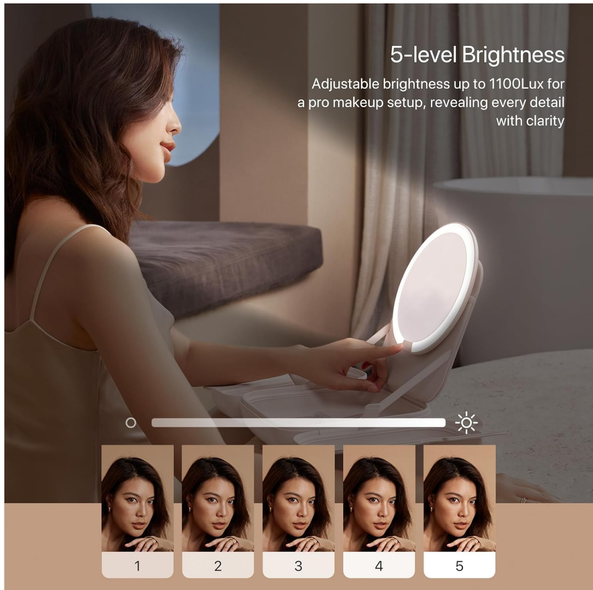
Image: Visual representation of the 5 brightness levels of the LED mirror.