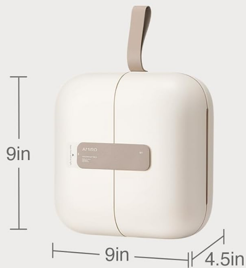
Image: Diagram showing the dimensions of the LED mirror and indicating the Type-C charging port.