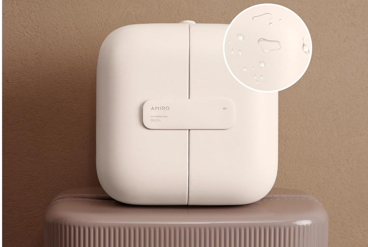
Image: Close-up showing water droplets on the surface of the makeup bag, highlighting its waterproof feature.

Eco-friendly, durable, and hygienic: Your long-lasting beauty companion