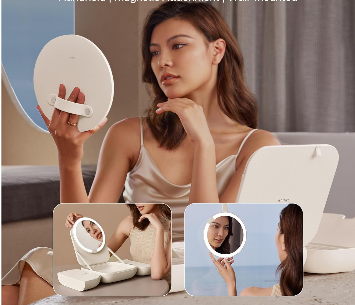
Image: The AMIRO M2 Travel Makeup Bag in its closed, portable state.

Handheld | Magnetic Attachment | Wall-mounted