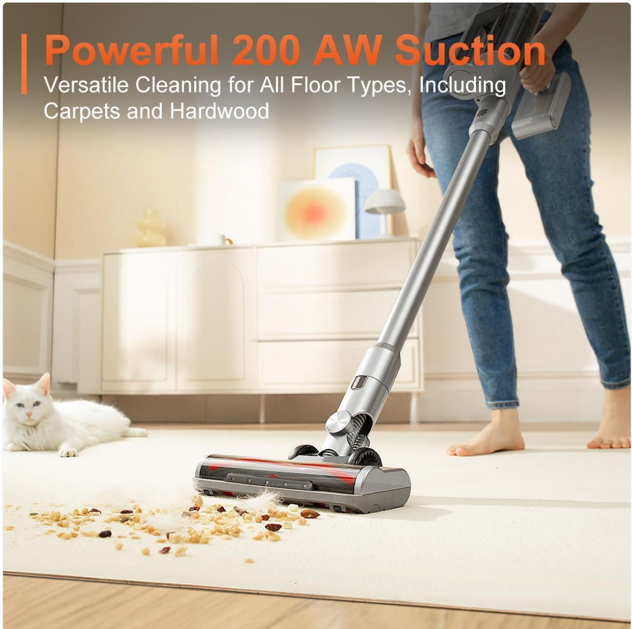
Image: A person using the uwant V100 cordless vacuum cleaner on a carpet, demonstrating its powerful 200 AW suction on various floor types.

Versatile Cleaning for All Floor Types, Including Carpets and Hardwood