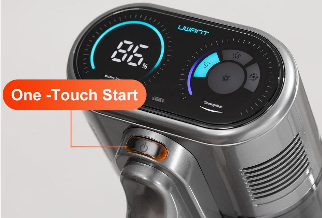
Image: Close-up of the uwant V100's LED display and the one-touch start button, showing battery percentage and current cleaning mode.