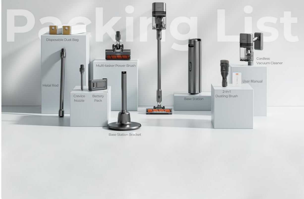
Image: All components included in the uwant V100 cleaning kit, including the vacuum, various attachments, battery, and base station.