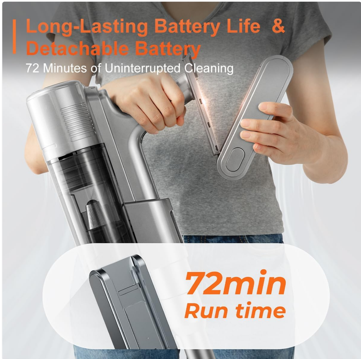
Image: A user detaching or attaching the battery pack to the uwant V100 vacuum cleaner, highlighting its long-lasting battery life.