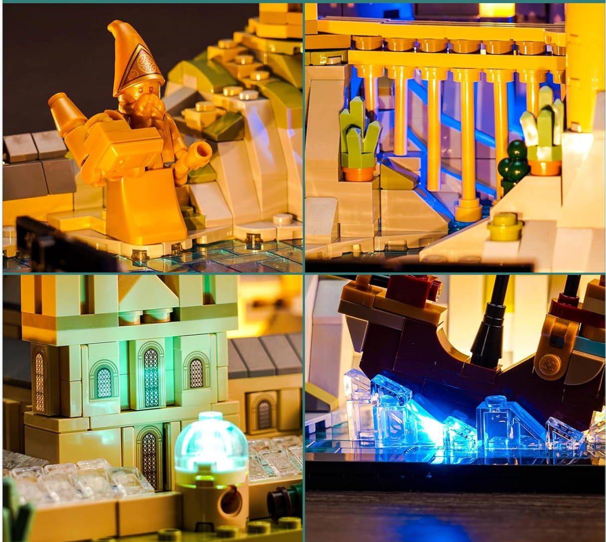
Four detailed close-up panels illustrating how the VONADO light kit enhances different sections of the LEGO Hogwarts Castle and Grounds 76419, showing various lighting effects on architectural elements and the 'Black Lake'.