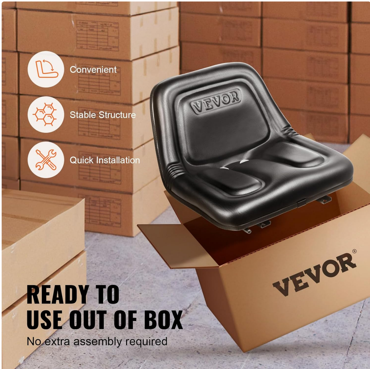
Image 4.1: The seat is ready for installation directly out of the box.

Your browser does not support the video tag.