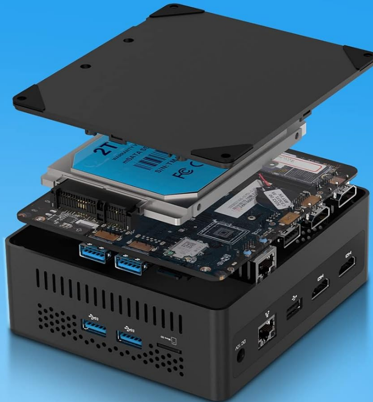
Image: Exploded view of the AWOW AL34 Mini PC showing the location for M.2 SATA SSD and 2.5-inch SATA HDD/SSD expansion.