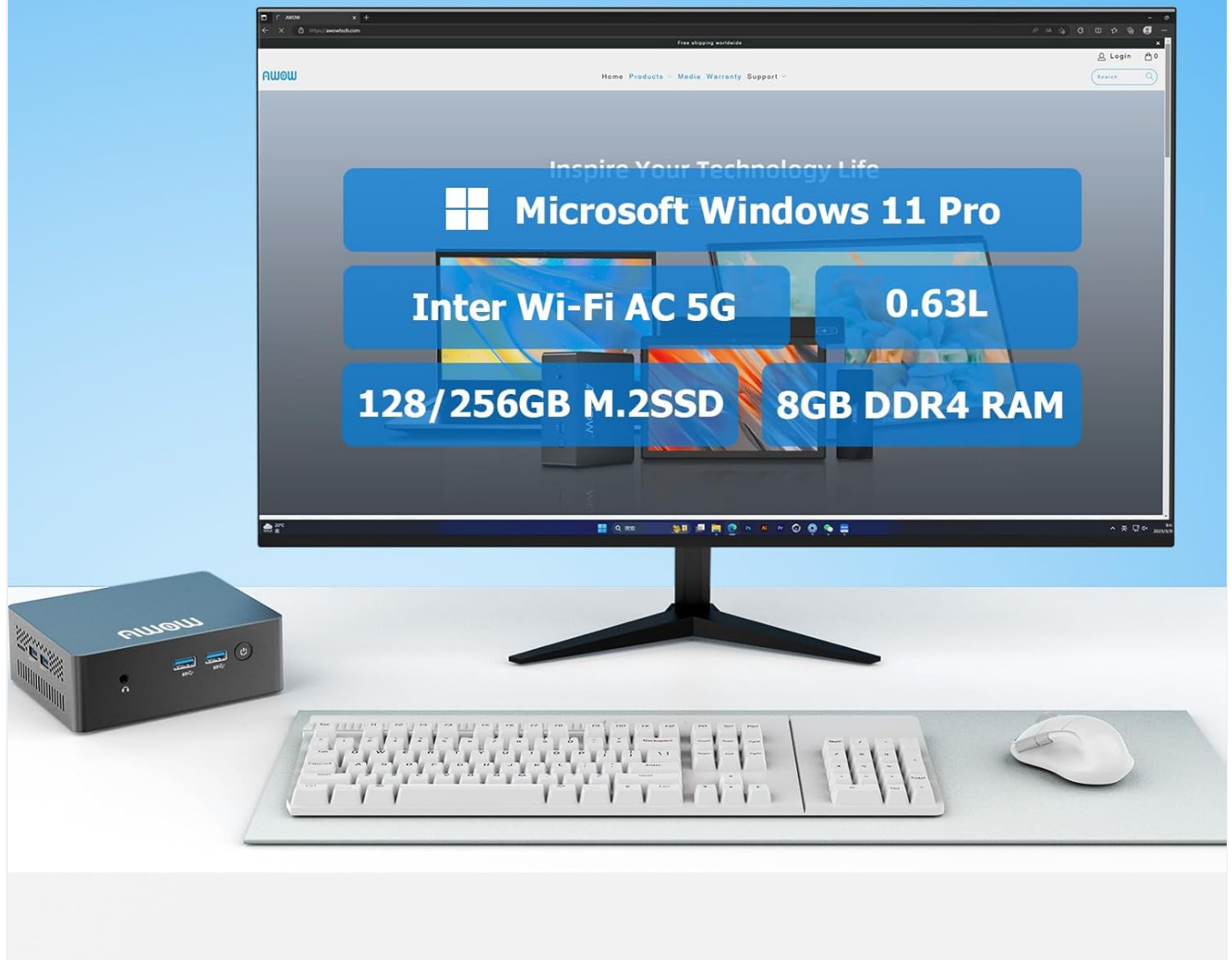
Image: Side view of the AWOW AL34 Mini PC, showing USB 3.2 ports and Micro SD card slot.