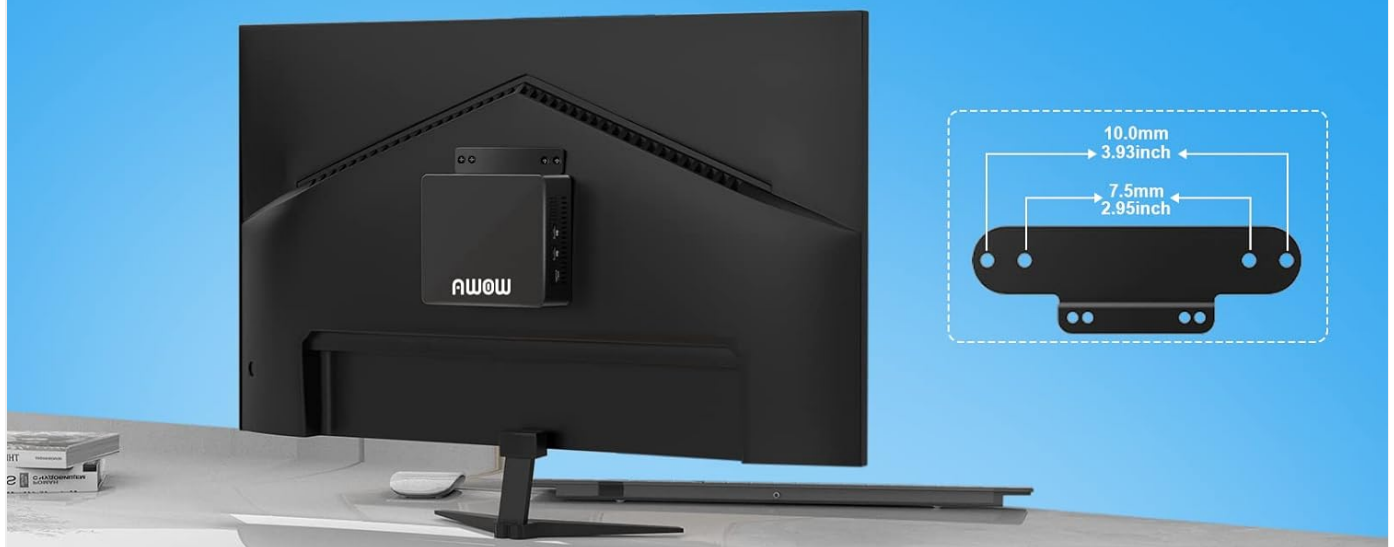
Image: The AWOW AL34 Mini PC with its dimensions indicated and a diagram showing VESA mount compatibility.