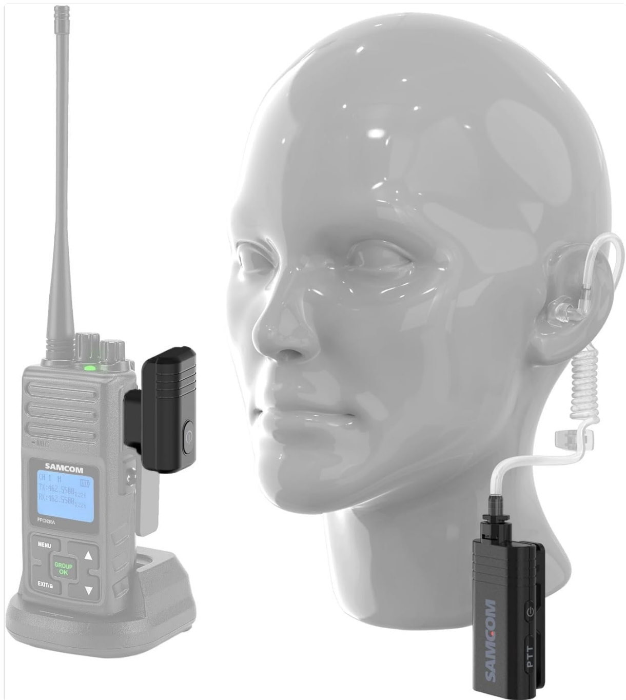
Figure 4.1: Overview of the SAMCOM BTEAR01 headset system in use with a radio.

This image illustrates the main components of the SAMCOM BTEAR01 system, showing how the earpiece and dongle connect to a two-way radio for wireless communication.