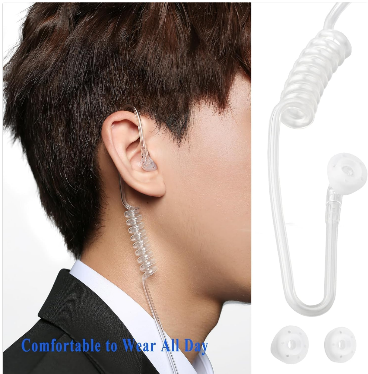
Figure 6.1: Proper wearing of the acoustic tube earpiece.

This image demonstrates how the transparent acoustic tube earpiece is worn, emphasizing its discreet and comfortable fit for all-day use.