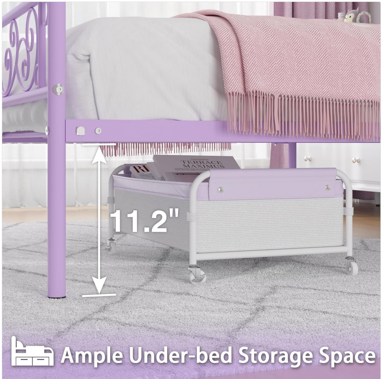
Image: Demonstrates the practical under-bed clearance, illustrating how storage containers can be utilized.