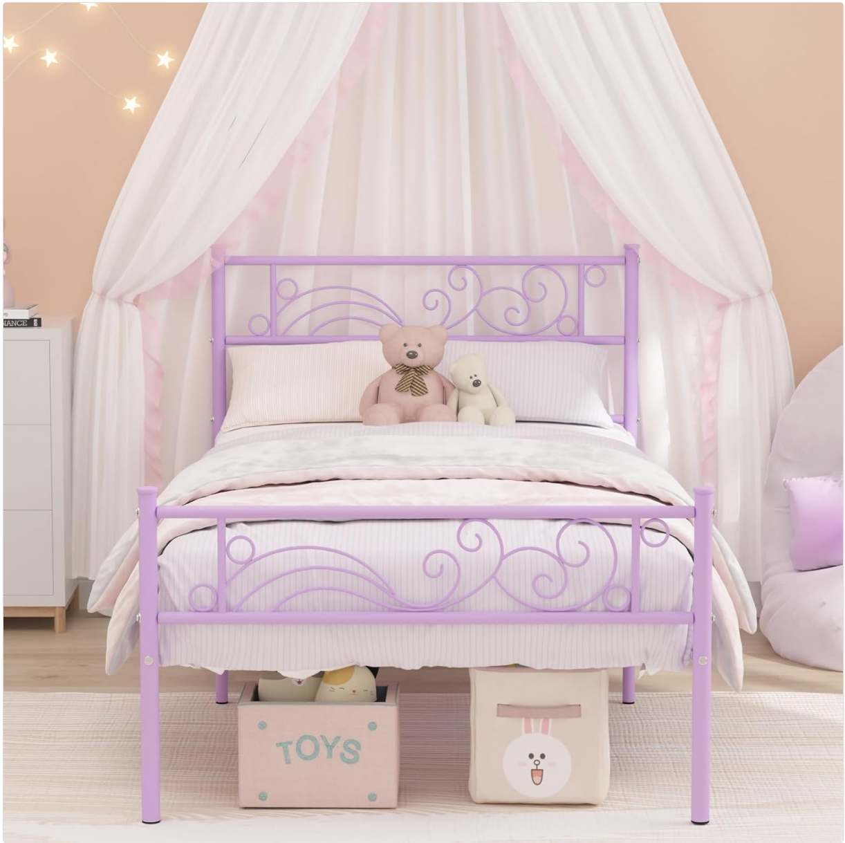
Image: The fully assembled Weehom Twin Bed Frame in purple, showcasing its design and under-bed clearance.