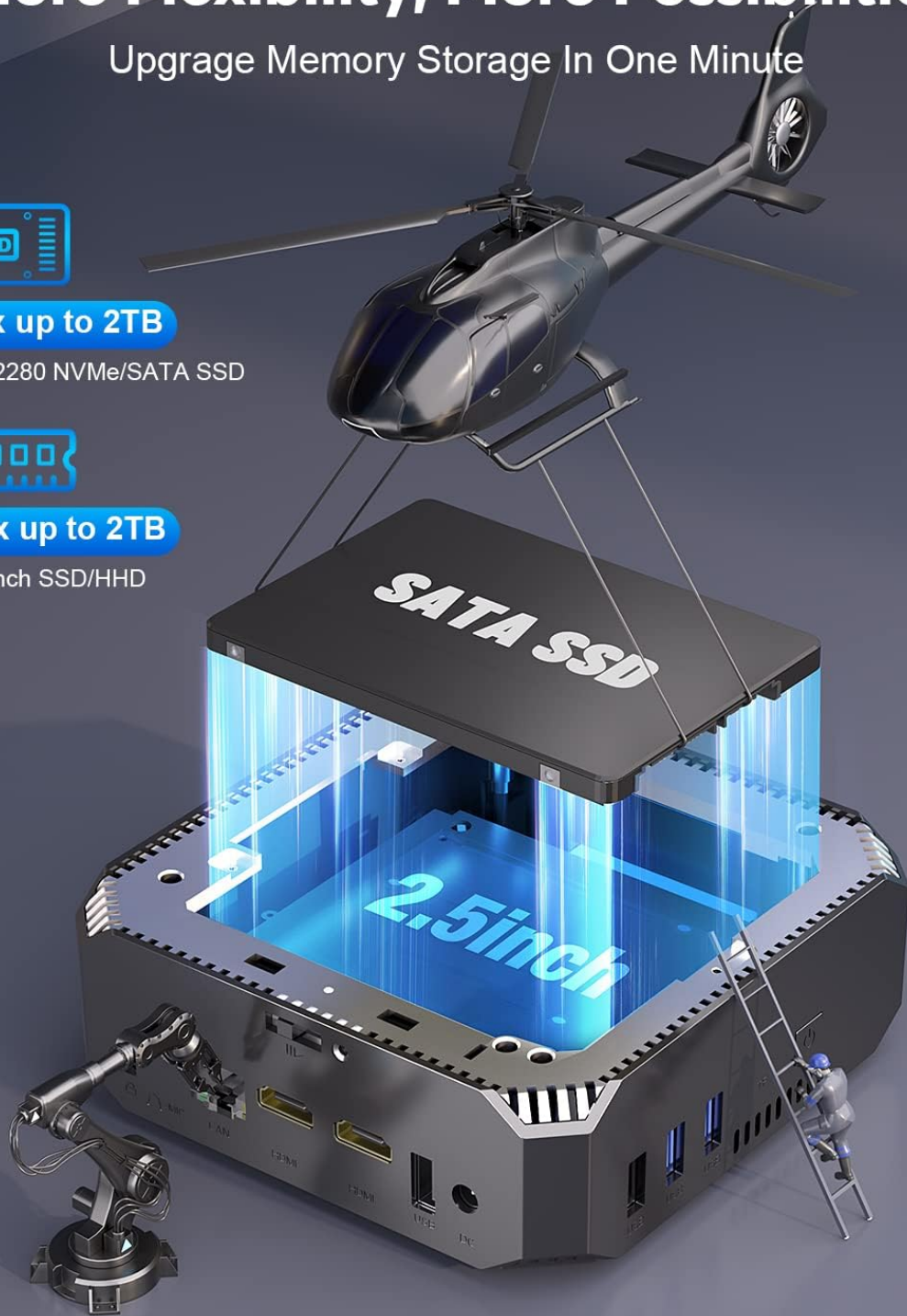
Image: Storage upgrade options for the NiPoGi AK2 Plus Mini PC.