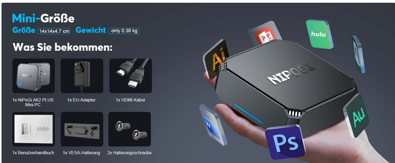
Image: The NiPoGi AK2 Plus Mini PC is suitable for a variety of daily needs and professional applications.