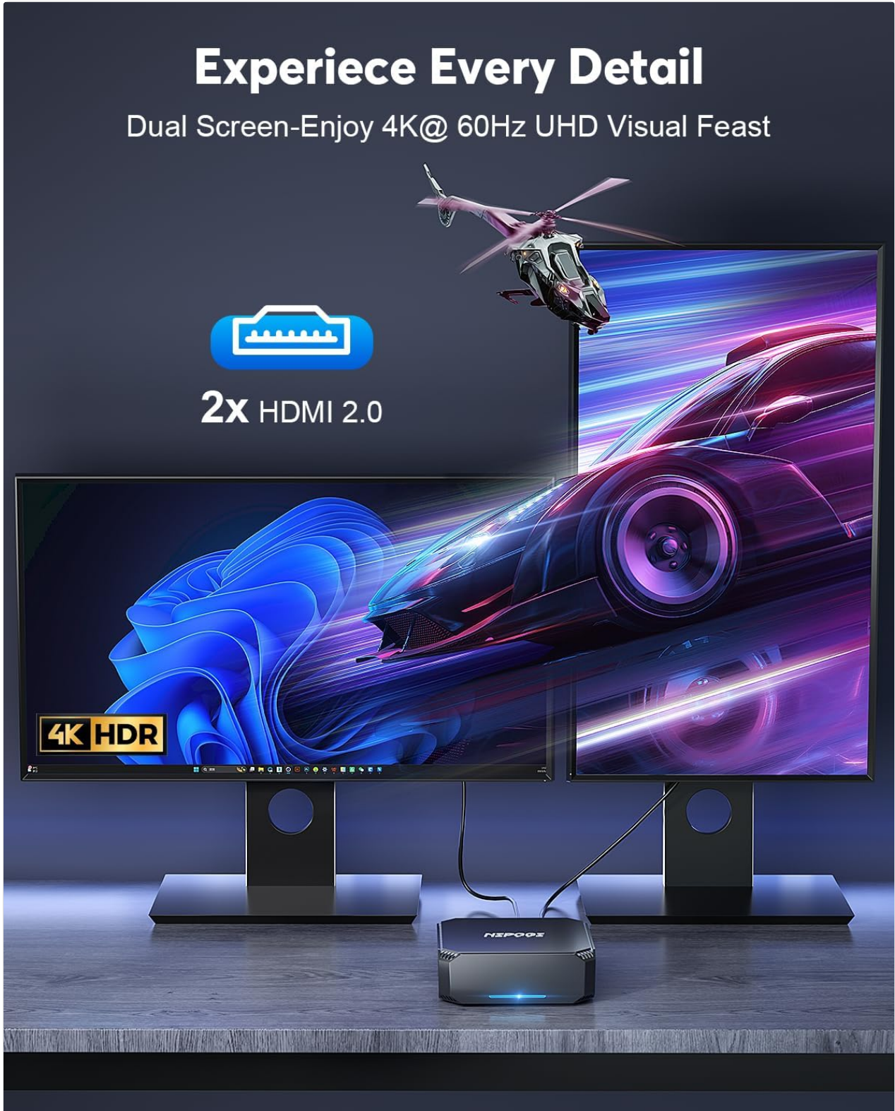
Image: NiPoGi AK2 Plus Mini PC supporting dual 4K UHD displays.

Configuration for dual displays is typically done through your operating system's display settings.