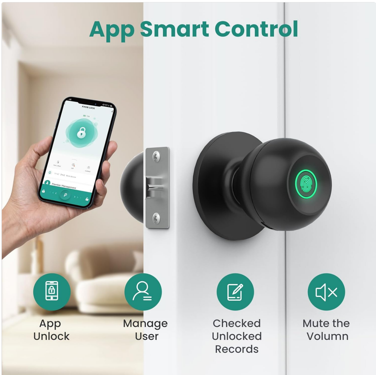
Figure 2.2: App Smart Control features including App Unlock, User Management, Unlock Records, and Volume Mute.