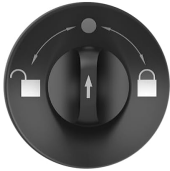
Normal mode (Auto-lock)