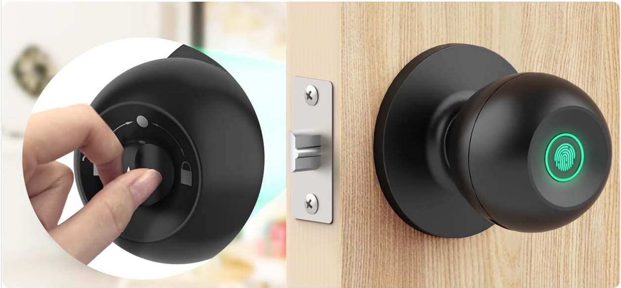
Figure 5.1: The lock features low battery alarm and Type-C emergency charging.

Video 5.1: Learn how to monitor and manage the battery life of your smart door knob using the app.