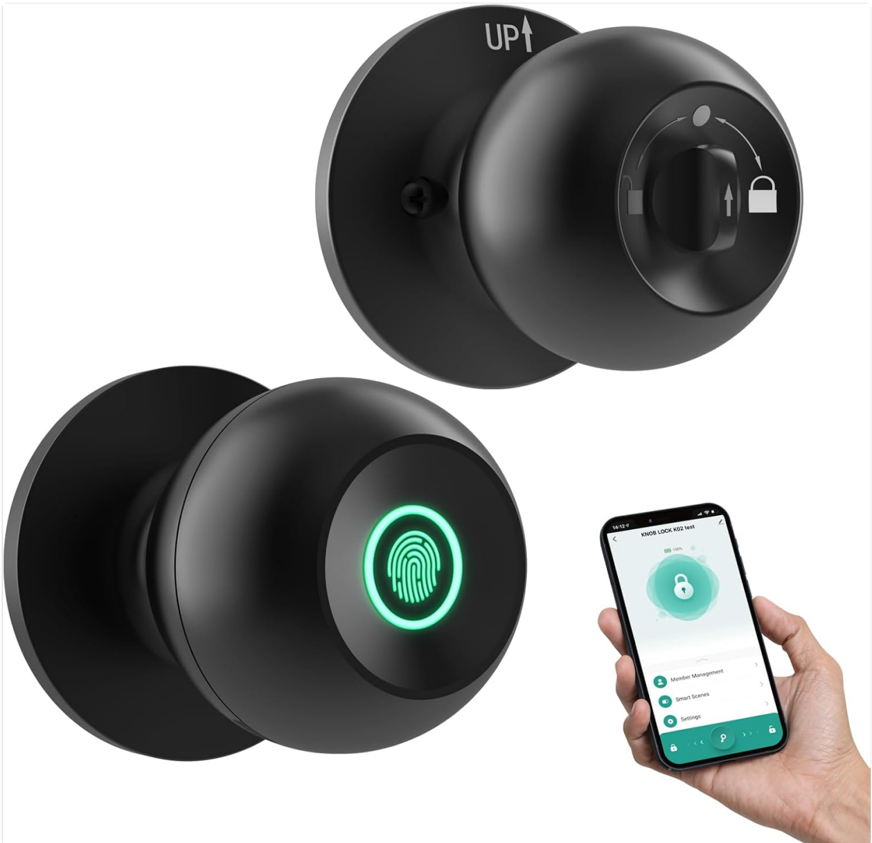
Figure 2.1 : Overview of GHome Smart Door Knob components.