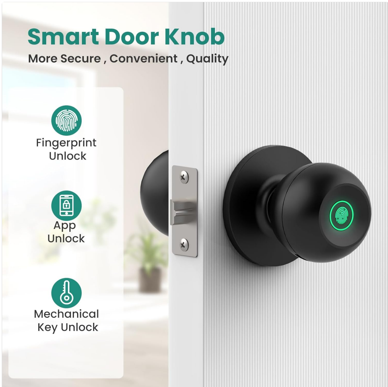
Figure 4.1: The lock supports fingerprint, app, and mechanical key unlocking.