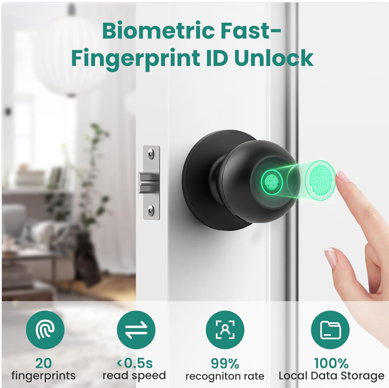
Figure 4.2: Fast and reliable fingerprint recognition with local data storage.