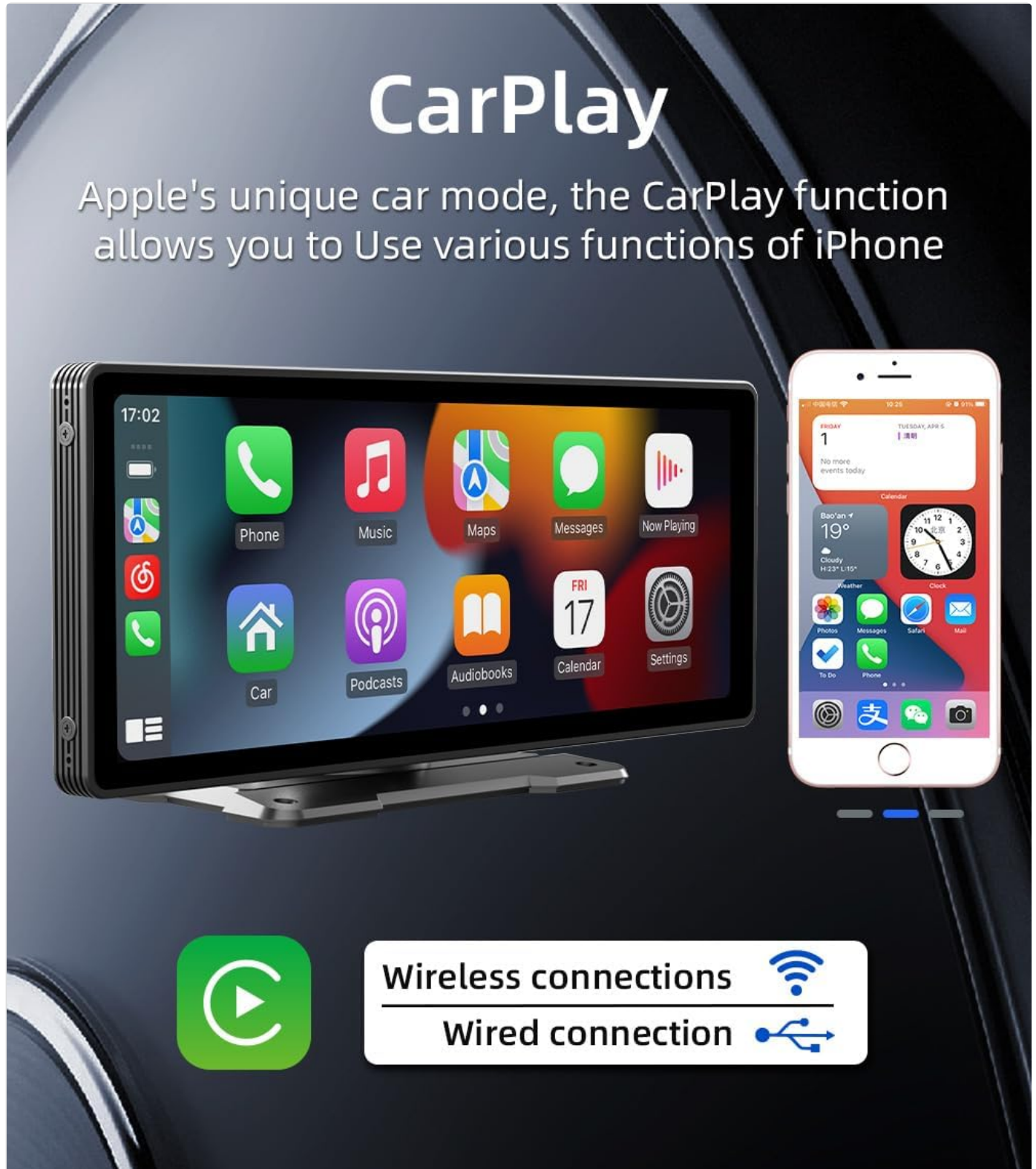
Figure 6: The Apple CarPlay interface on the B5303, demonstrating its ability to mirror iPhone functions for a safer driving experience. Supports both wireless and wired connections.

The B5303 supports both Android AUTO and Apple CarPlay, offering seamless integration with your smartphone for navigation, music, messages, and more. Connectivity can be established via wireless or wired connections.