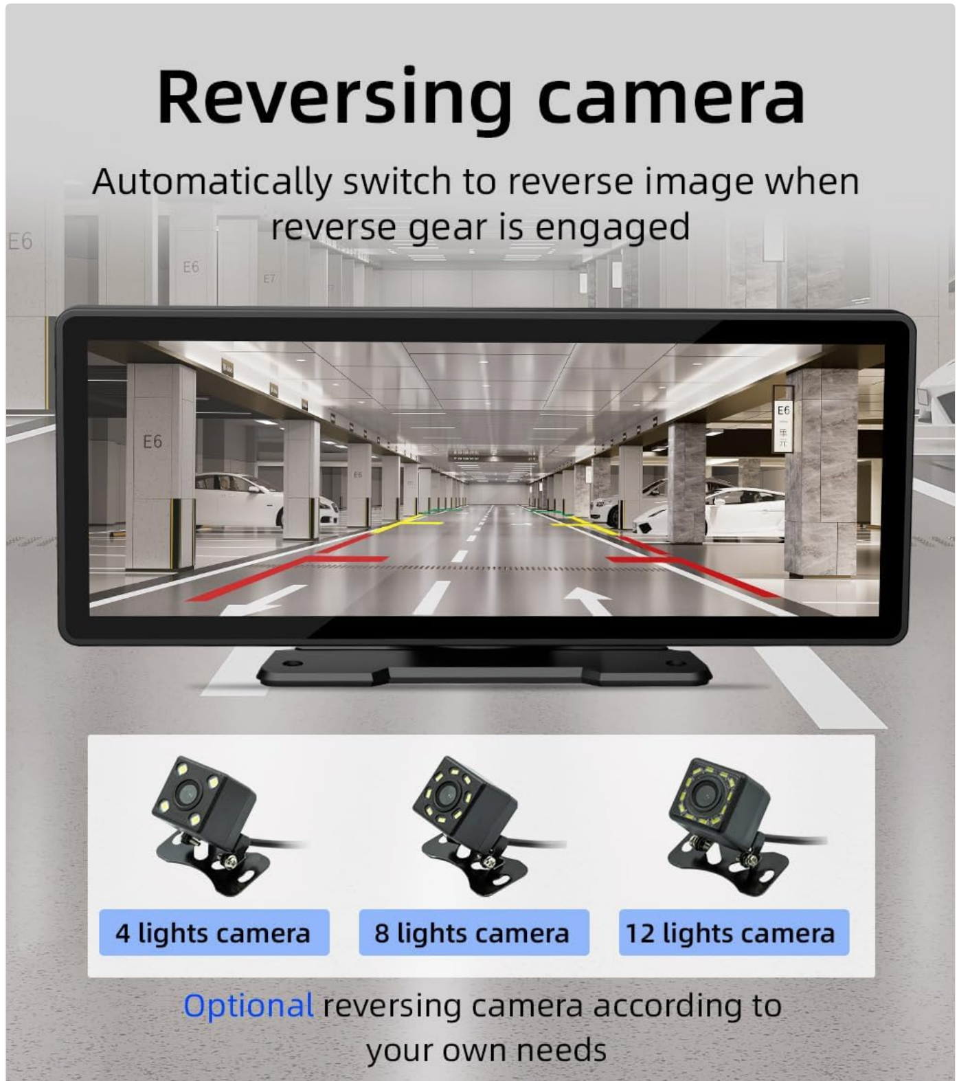
Figure 8: Display of the reversing camera view on the B5303 screen, showing parking guidelines and the surrounding environment. Optional camera types (4, 8, 12 lights) are also shown.

When a compatible rear-view camera is connected, the B5303 will automatically switch to the camera's view when the vehicle's reverse gear is engaged, providing a clear image to assist with parking and maneuvering.