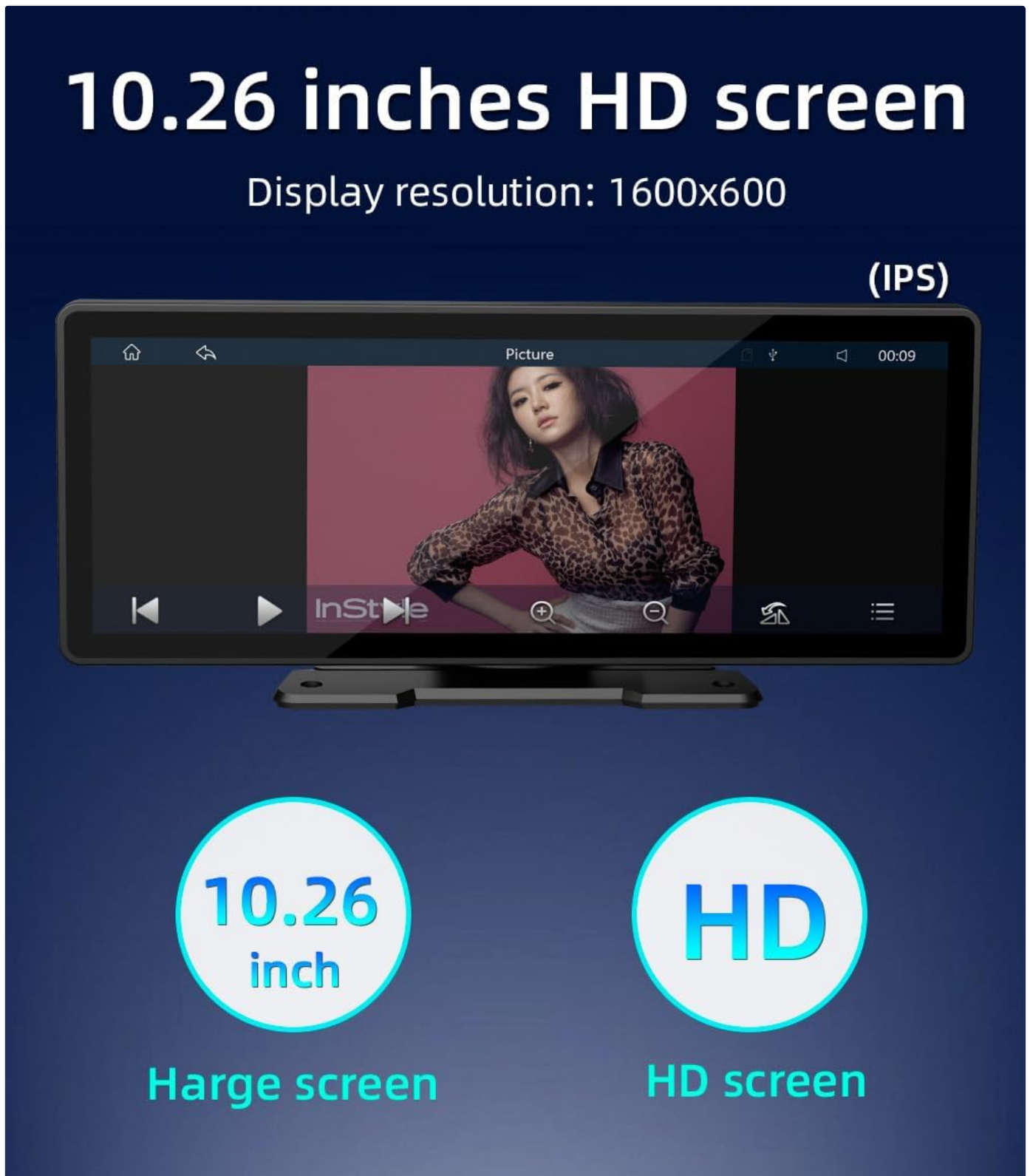
Figure 5: The 10.26-inch HD IPS screen, highlighting its high resolution (1600x600) and clarity for media playback.