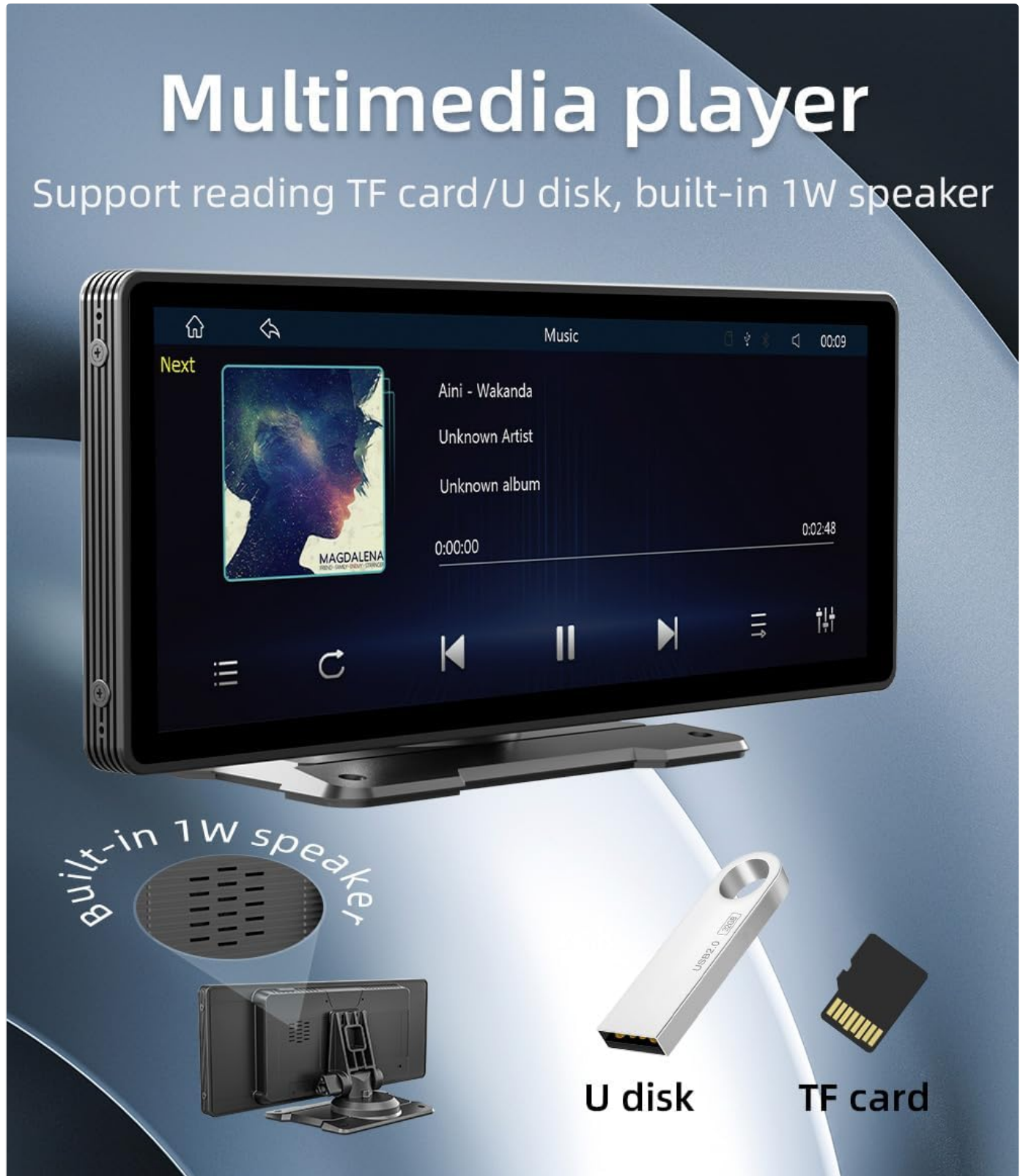
Figure 7: The multimedia player interface, demonstrating music playback and indicating support for TF cards and U disks, along with the

The B5303 supports a wide array of media formats and can play content from TF cards (microSD) or U disks (USB flash drives). It features a built-in 1W speaker for audio output.