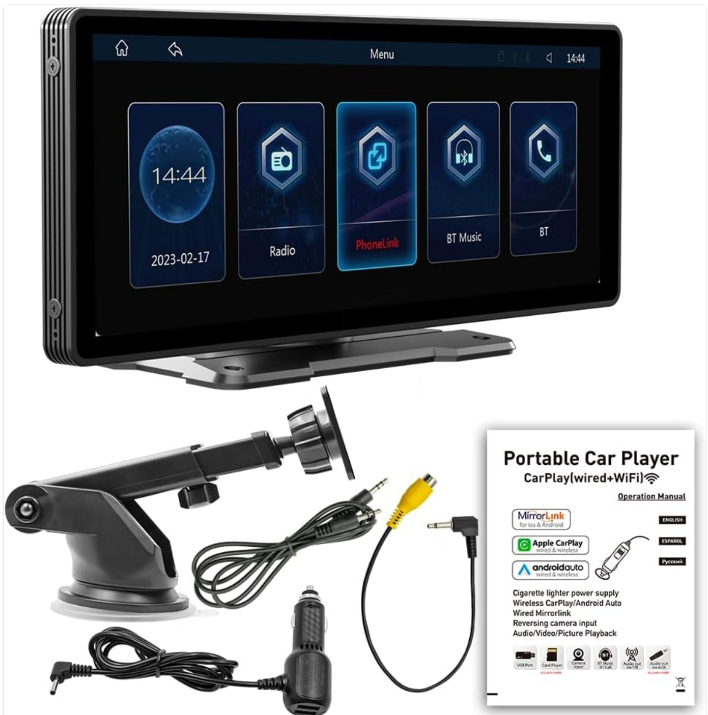
Figure 1: Contents of the B5303 package, including the main unit, power cable, brackets, and manual.