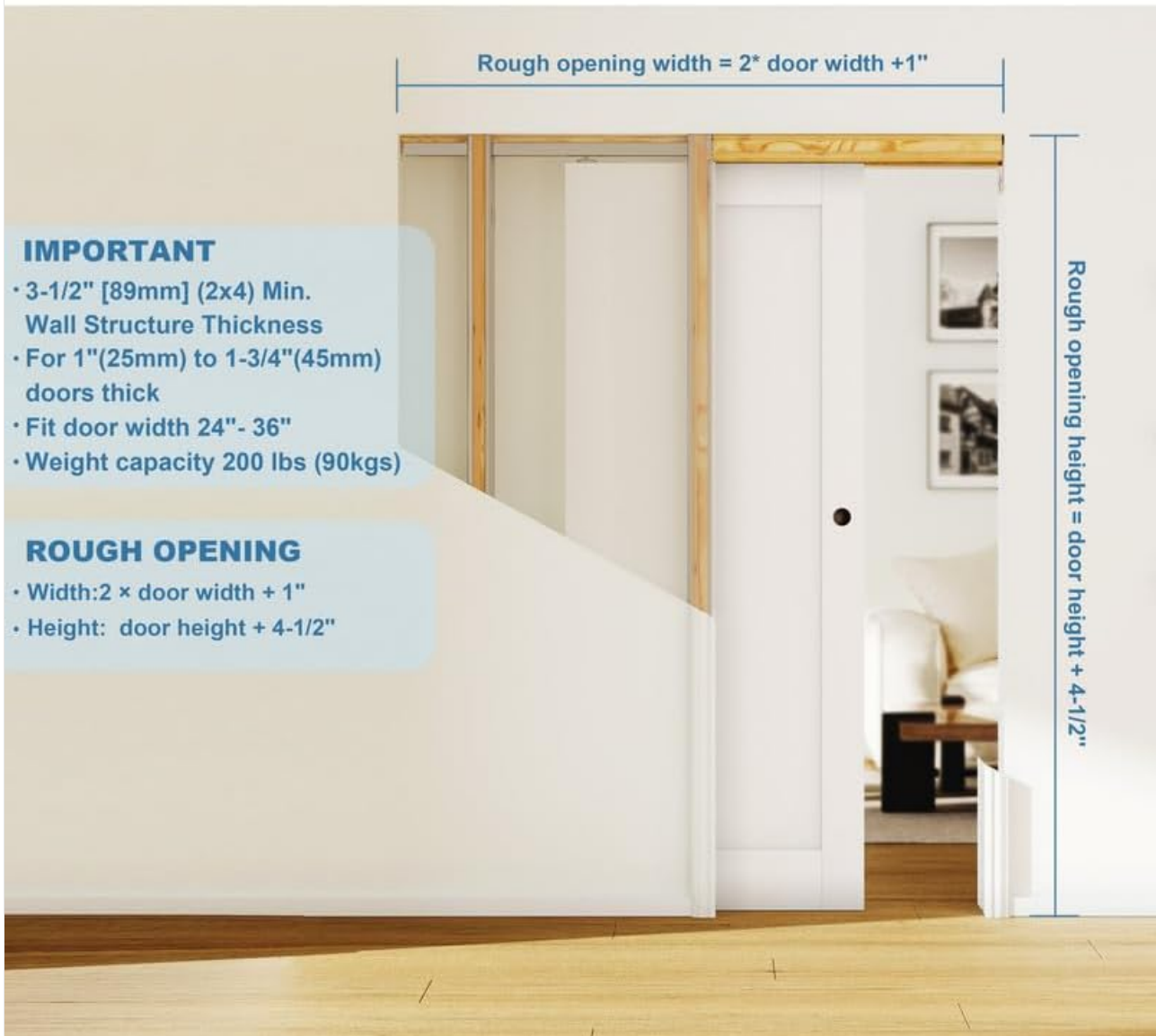
Figure 5.1: Essential rough opening dimensions for proper pocket door installation.

Accurate rough opening dimensions are critical for proper operation. Refer to Figure 5.1 and the specifications table for precise measurements. The wall structure thickness must be a minimum of 3-1/2 inches (2x4 framing).