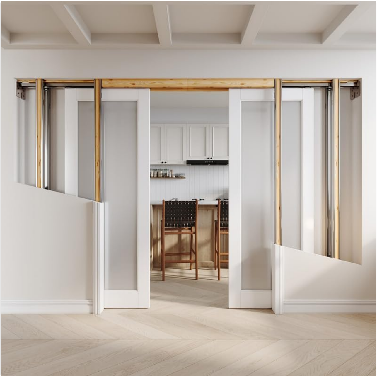
Figure 5.2: Internal view of the pocket door frame during installation, demonstrating how the doors slide into the wall cavity.