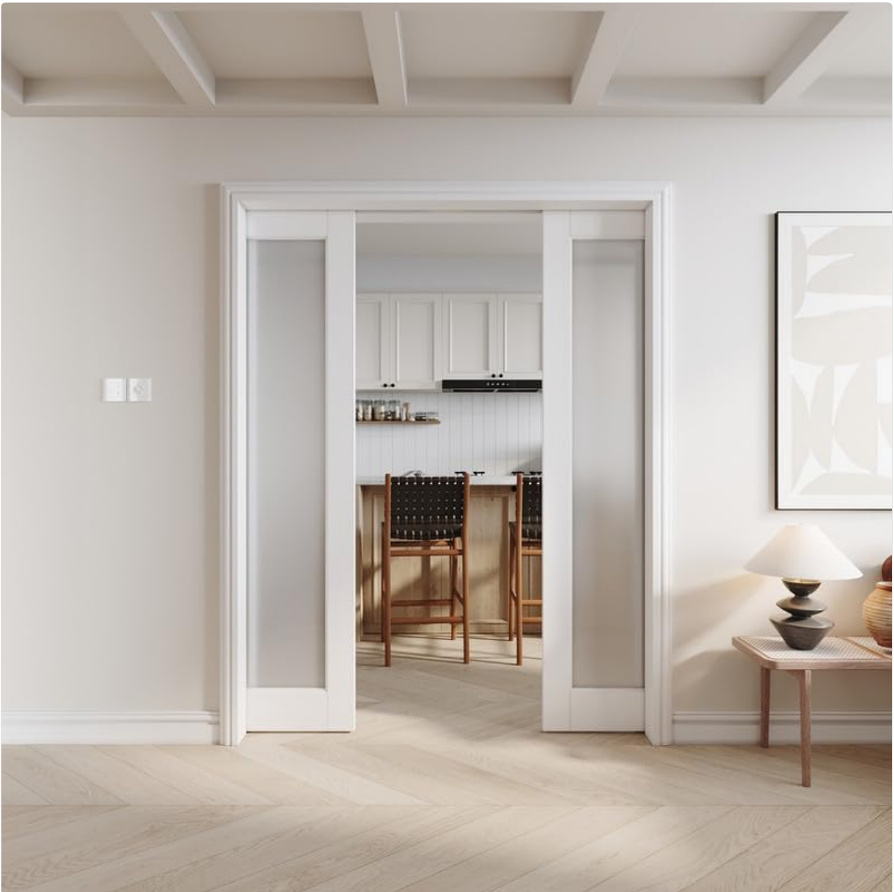
Figure 2.1: WIN STELLAR double pocket doors in an open configuration, showcasing their integration into a living space.