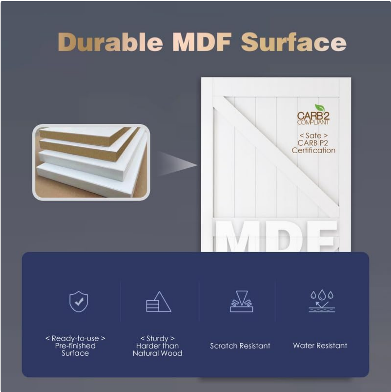
Figure 7.1: Details on the durable MDF surface with PVC film, emphasizing its easy-to-clean and resistant properties.