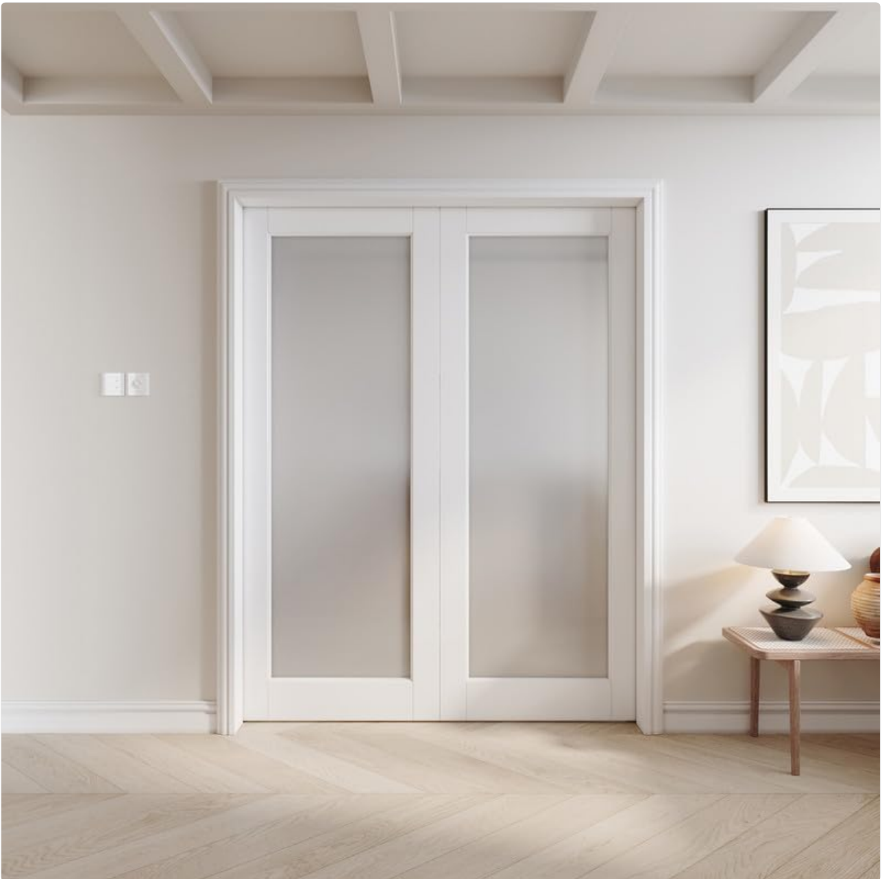
Figure 6.1: The double pocket doors in their closed position, highlighting the frosted glass for privacy.