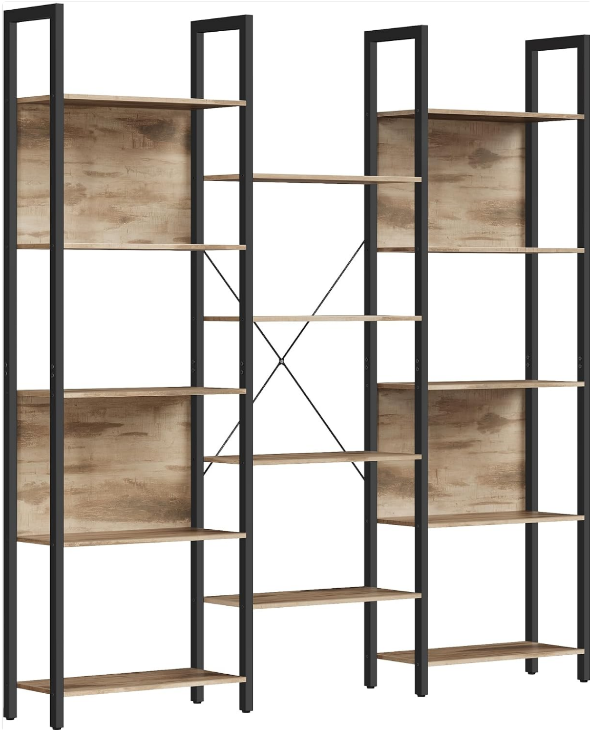
Image 1.1: The VASAGLE LLS107K01 Industrial Bookshelf, showcasing its 14 shelves and sturdy design.