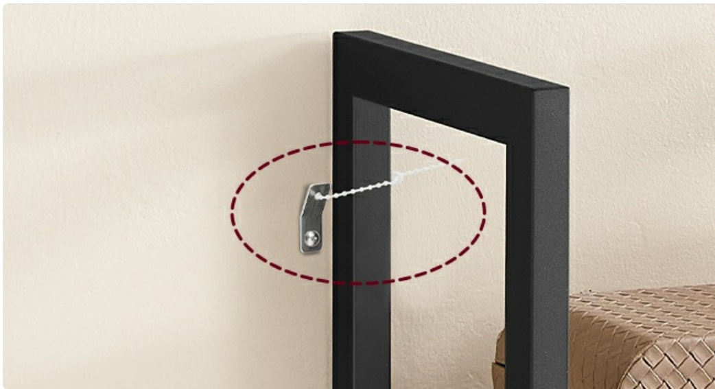
Image 2.1: Illustration of the anti-tip kit, essential for securing the bookshelf to the wall.