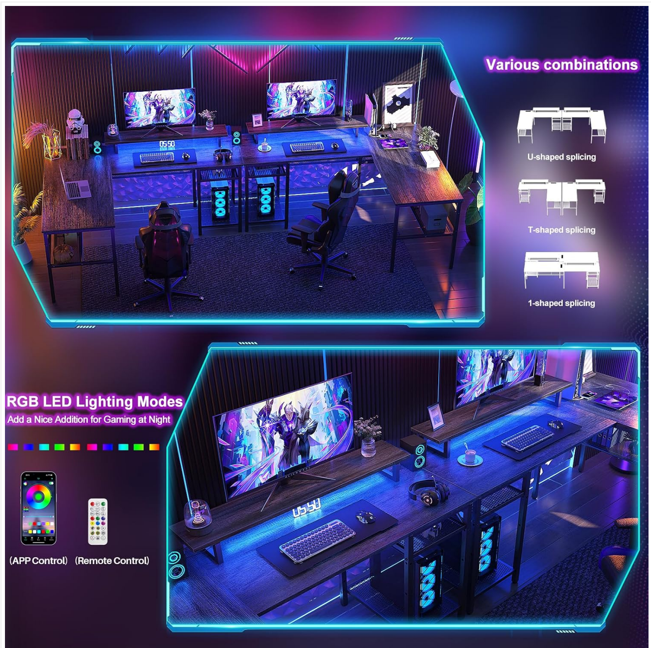
Figure 5.2: RGB LED lighting modes and control options.

The integrated smart RGB LED strip light can be controlled via a dedicated app or the included IR remote control. You can personalize the light color from a palette of 60,000 colors, choose from 29 dynamic modes, adjust brightness, and set timers for turning the lights on/off. The music sync feature allows the lights to respond to the rhythm of your audio.