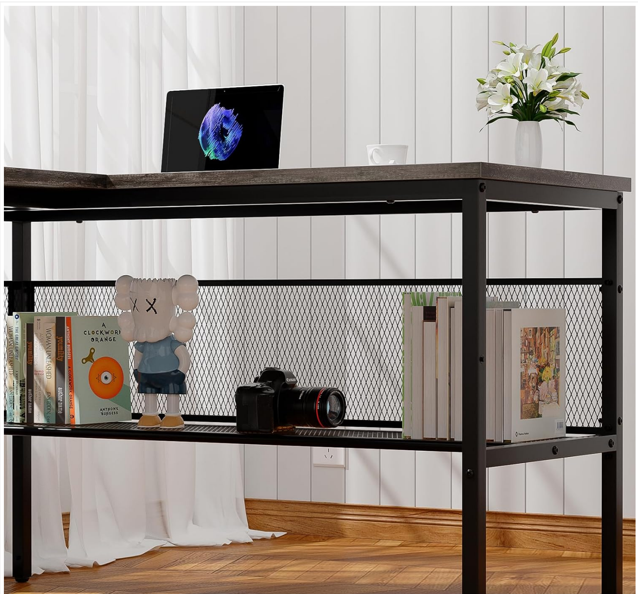
Under Desk Bookshelf The under desk bookshelf offers ample storage space for books, files and other supplies.