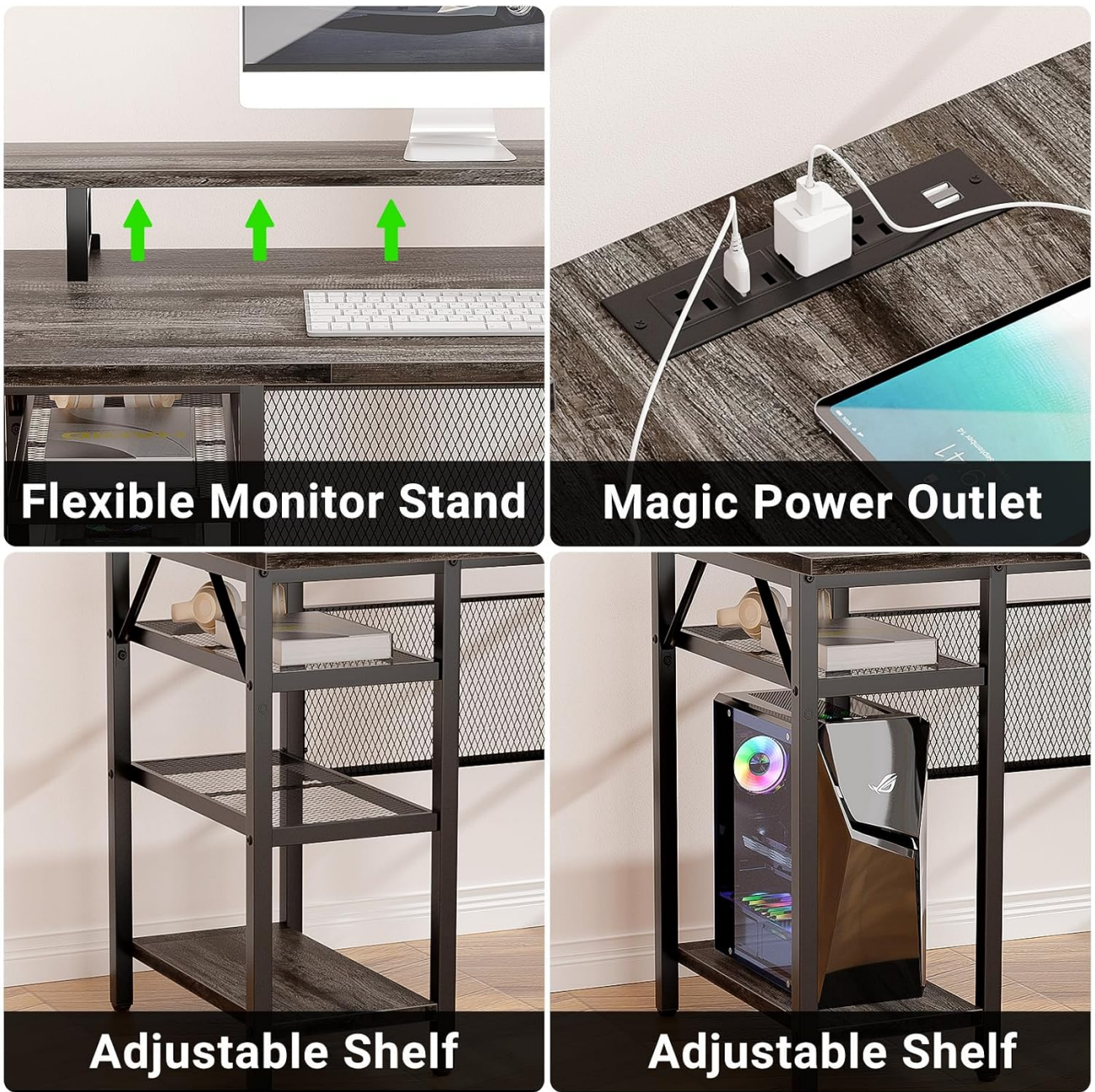
Figure 4.4: Features including the flexible monitor stand, integrated power outlet, and adjustable shelves.