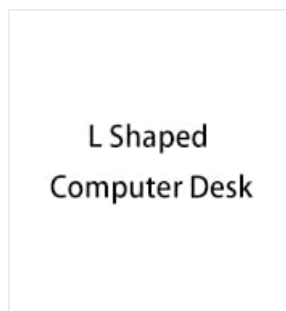
L Shaped Computer Desk

The desk features a functional inset USB/outlet charging station. This power strip includes 4 AC outlets (125V/12A) and 2 USB ports (5V-2A) with a 5-foot power cord. Use these to conveniently charge your electronic devices.