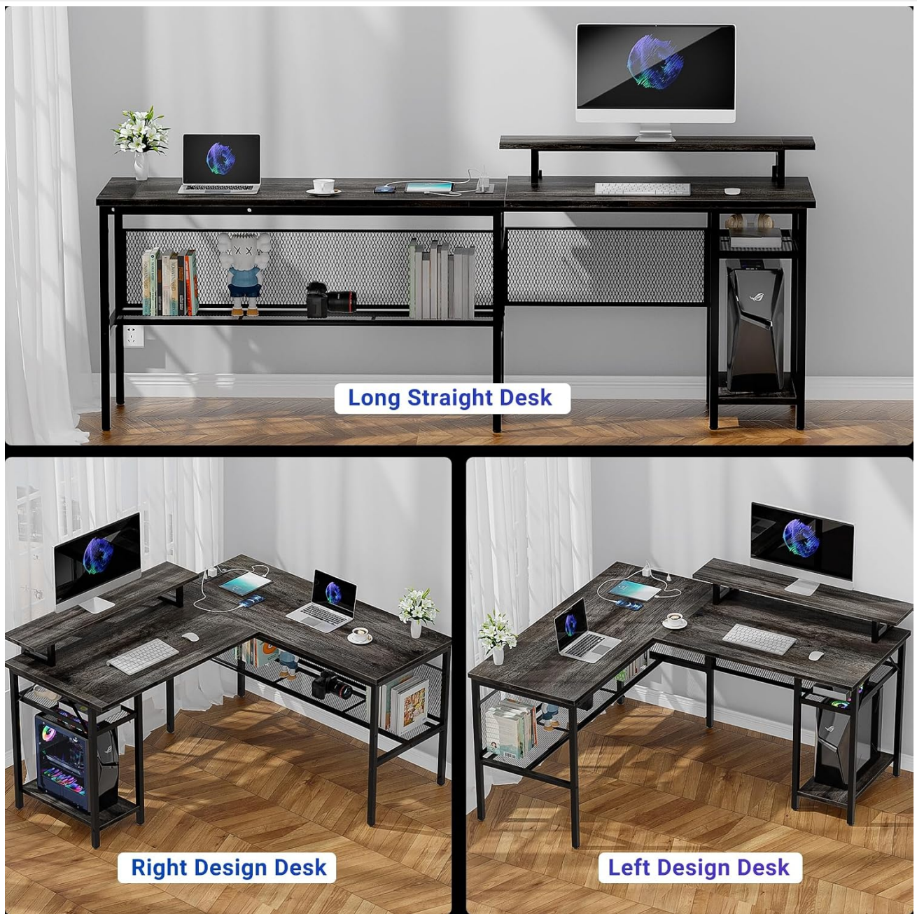
Figure 4.2: Visual representation of the Long Straight Desk, Right Design Desk, and Left Design Desk configurations.