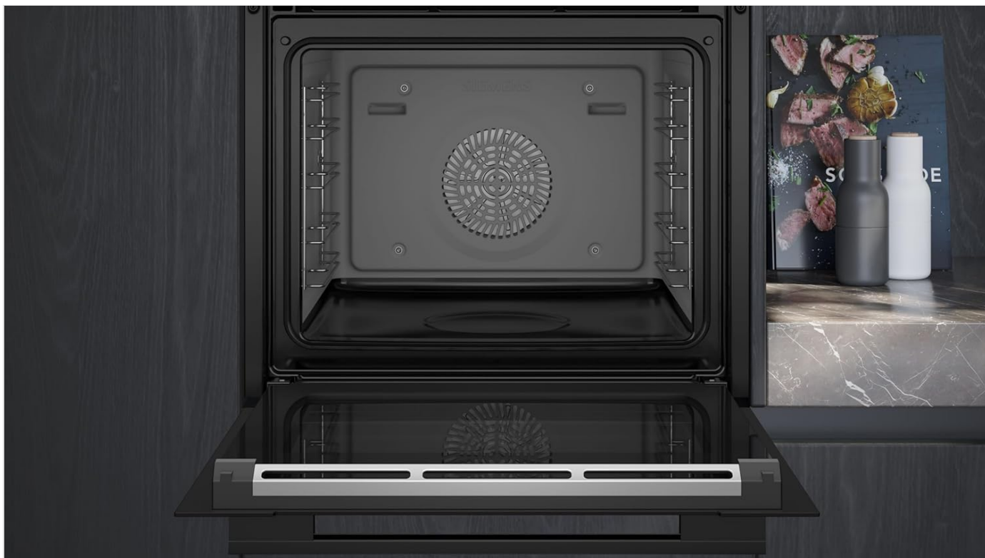
Figure 5: Oven interior showcasing different accessories for various cooking methods.