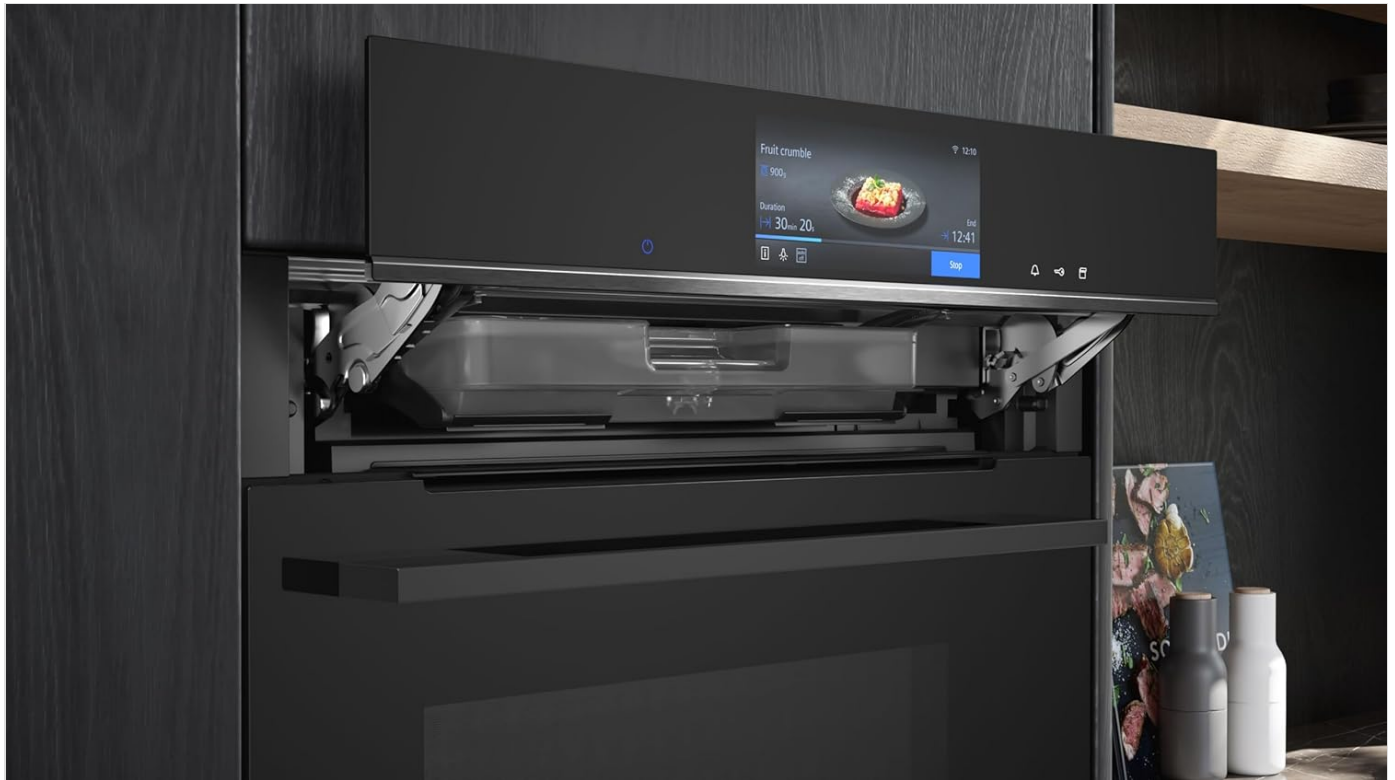
Figure 8: The water tank for the steam function, used for humidClean Plus and steam cooking.

The oven features an ecoClean Plus wall coating that breaks down dirt and odors. The humidClean Plus function supports this process through hydrolysis. After the cycle, simply wipe away any residue with a damp cloth, leaving the oven sparkling clean.