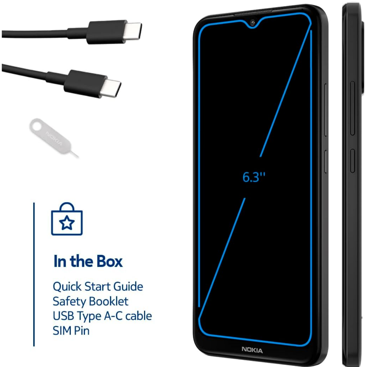
Illustration of the items included in the Nokia C210 retail packaging.