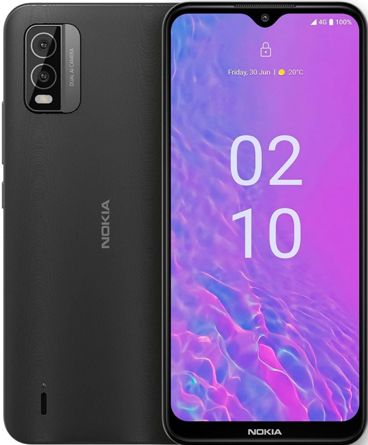
The Nokia C210 smartphone, showcasing its sleek design and dual camera setup.