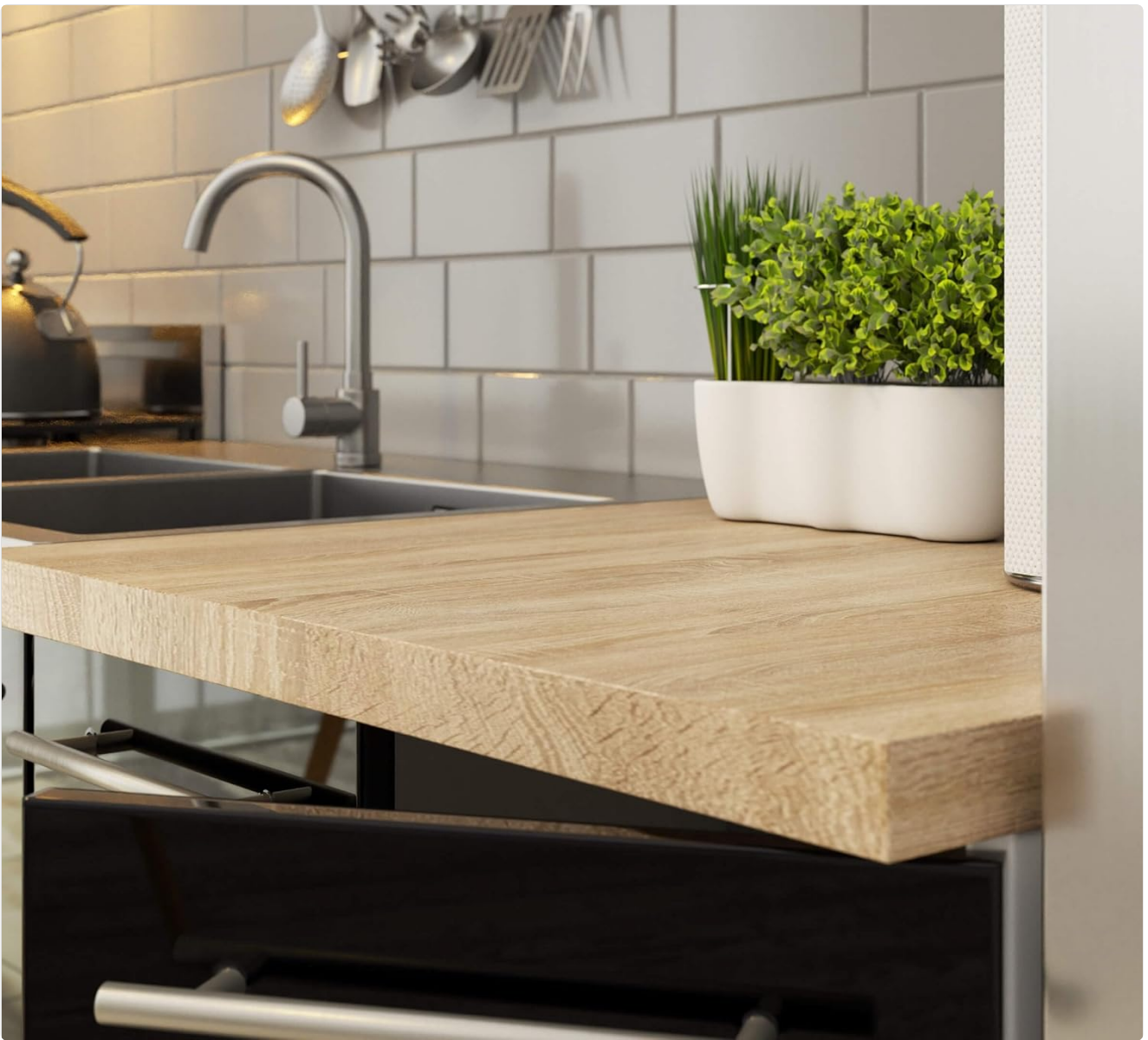
Figure 2: Detail of the durable worktop surface.