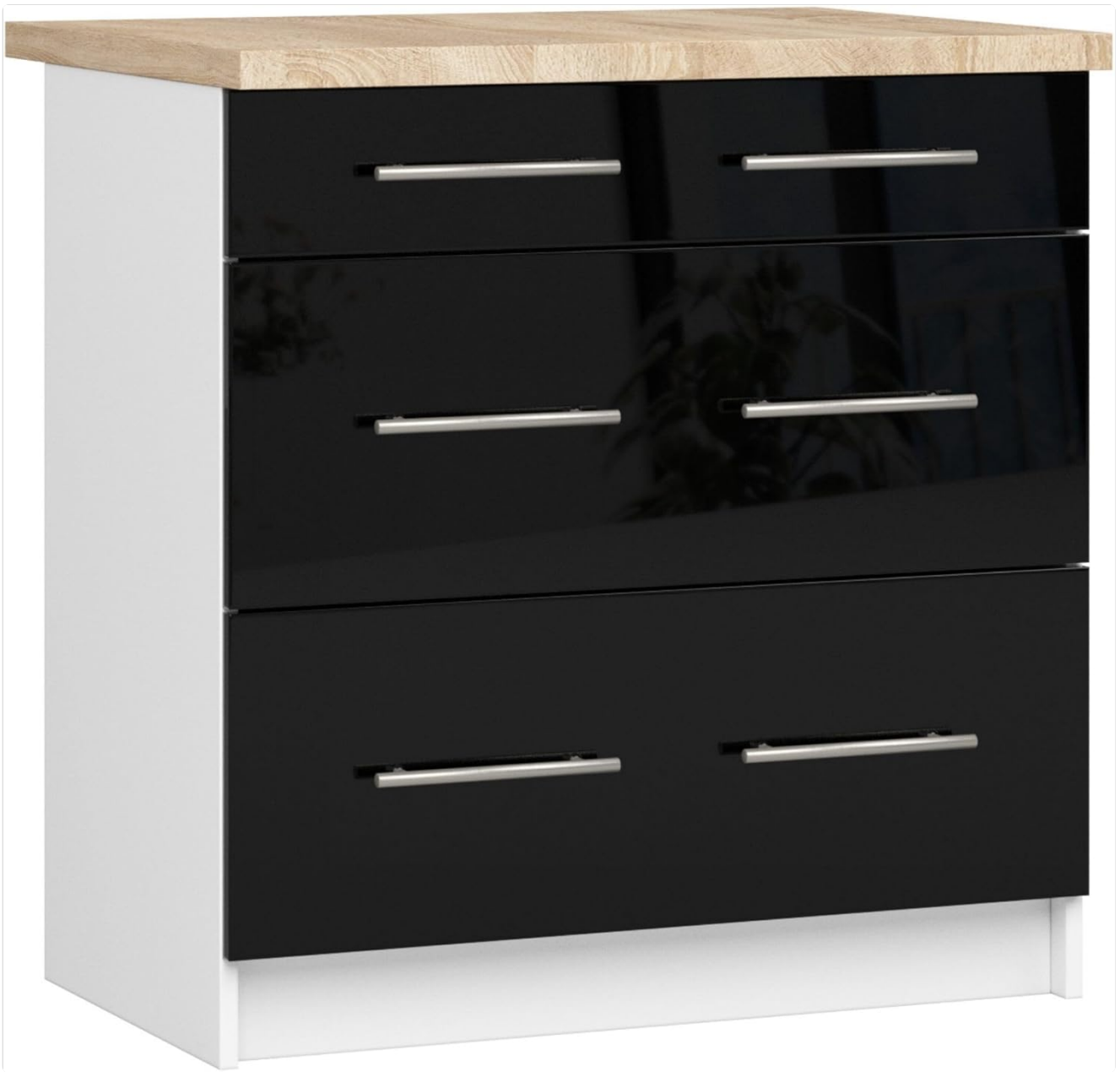
Figure 1: AKORD Oliwia S80 Kitchen Base Cabinet, front view.