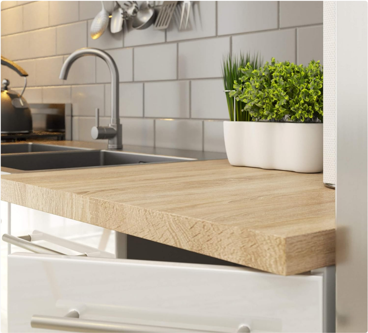
Image 1.1: The AKORD Oliwia S80 Kitchen Cabinet integrated into a kitchen environment. This image shows the cabinet's design and how it complements kitchen decor.