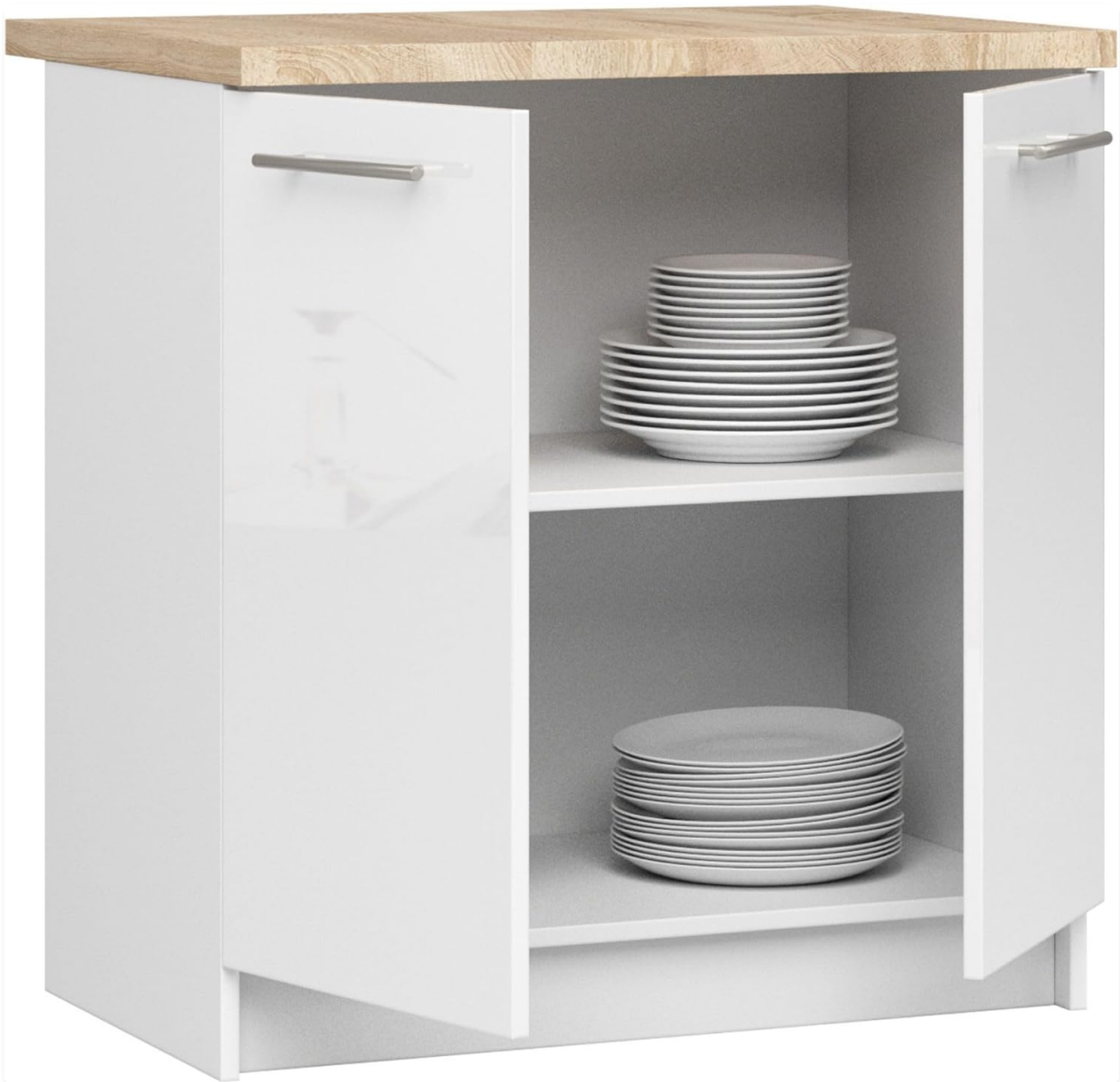
Image 5.1: Interior view of the AKORD Oliwia S80 Kitchen Cabinet, demonstrating the two spacious shelves suitable for storing kitchenware.