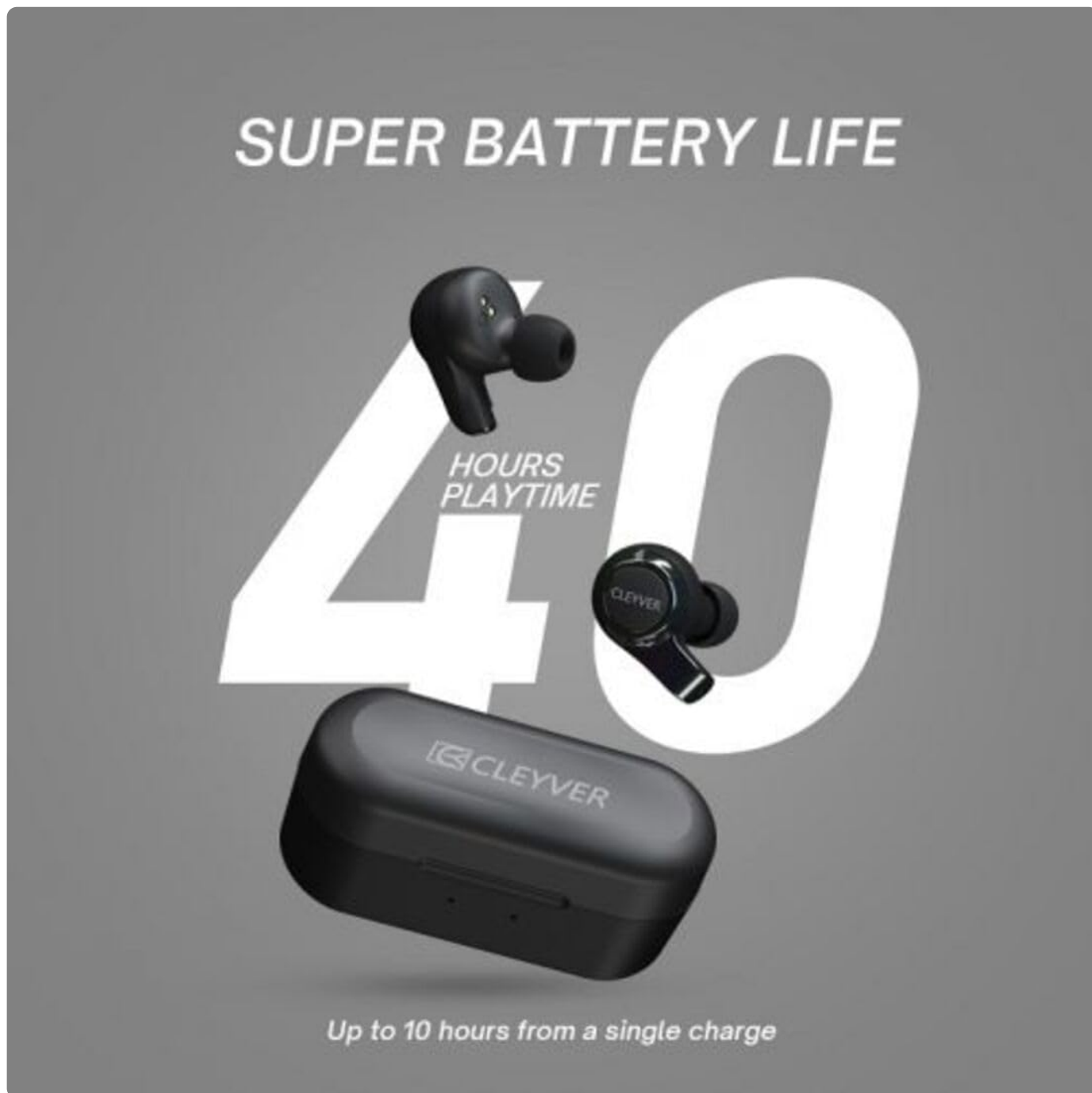
Image: Visual representation highlighting the 40 hours of playtime for the CLEYVER Earbuds Pro.

The charging case has a 500 mAh battery, providing up to 40 hours of listening time or 7 hours of talk time. A quick 10-minute charge can provide up to 2 hours of autonomy.