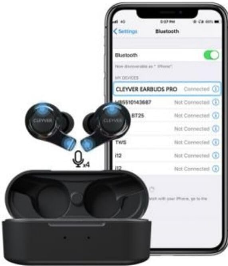
Image: A smartphone screen displaying the CLEYVER Earbuds Pro as a connected Bluetooth device, illustrating the simple setup process.

Instant pairing and connection as soon as you open the case lid