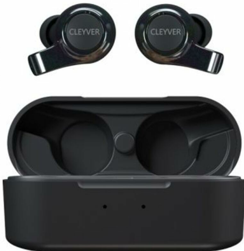
Image: The CLEYVER Earbuds Pro displayed with the CLEYVER brand logo.