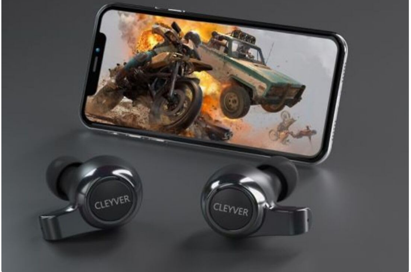
Image: The CLEYVER Earbuds Pro positioned beside a smartphone screen showing a dynamic racing game, illustrating the 'Gaming Mode' feature.

Feel the action the moment you see it on screen