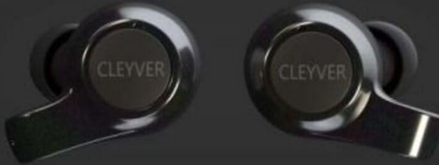
Image: The CLEYVER Earbuds Pro and their accompanying charging case.