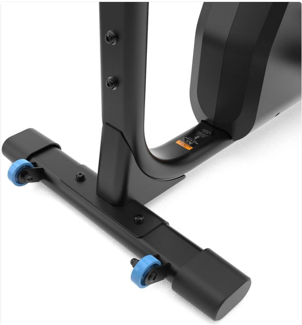
Image: A close-up view of the blue transport wheels located at the front base of the Domyos EB520, designed for easy movement.