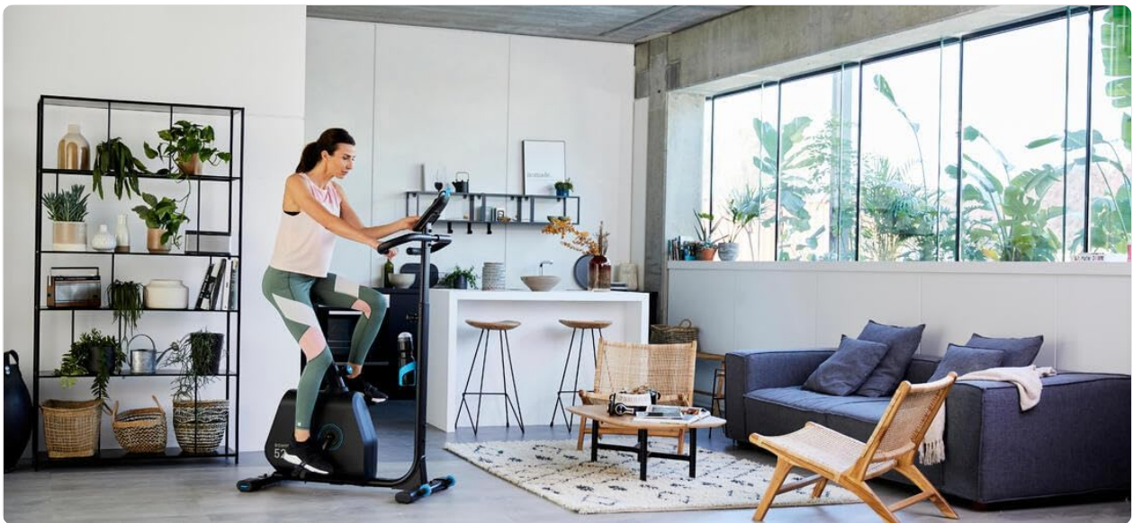
Image: A woman actively exercising on the Domyos EB520 in a modern living room setting, demonstrating typical usage.