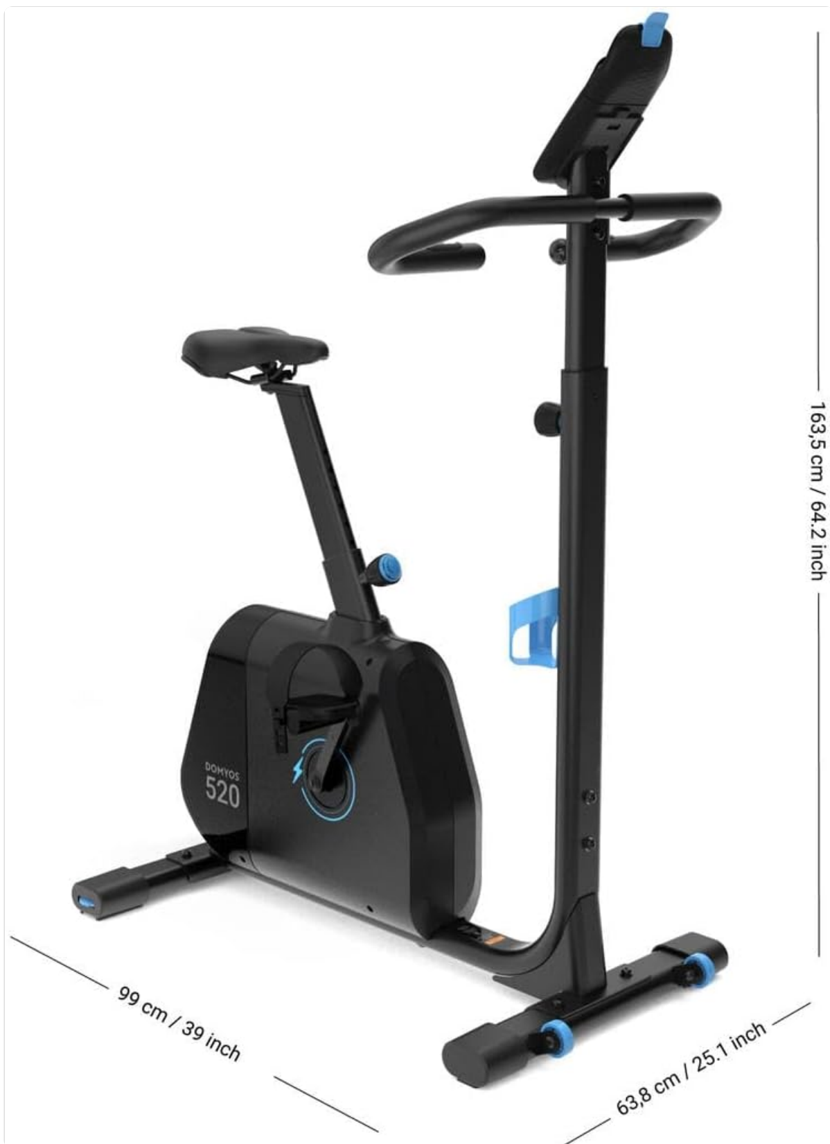
Image: The Domyos EB520 Exercise Bike with its key dimensions (length, width, height) indicated, useful for planning placement.