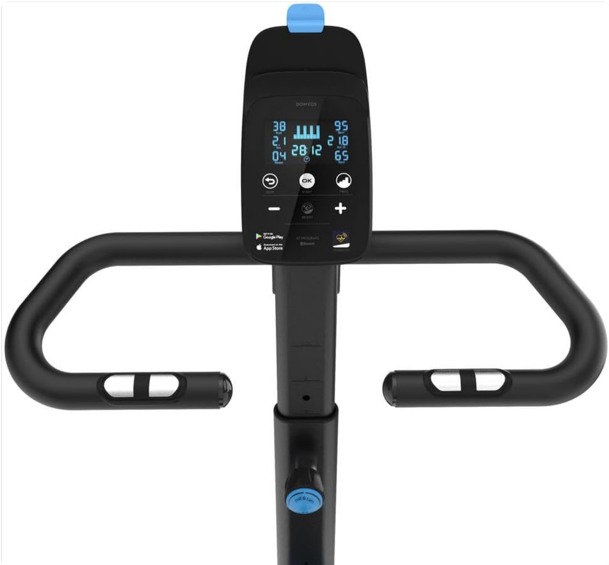
Image: A close-up view of the Domyos EB520's LCD console and handlebars, highlighting the control buttons and heart rate sensors.