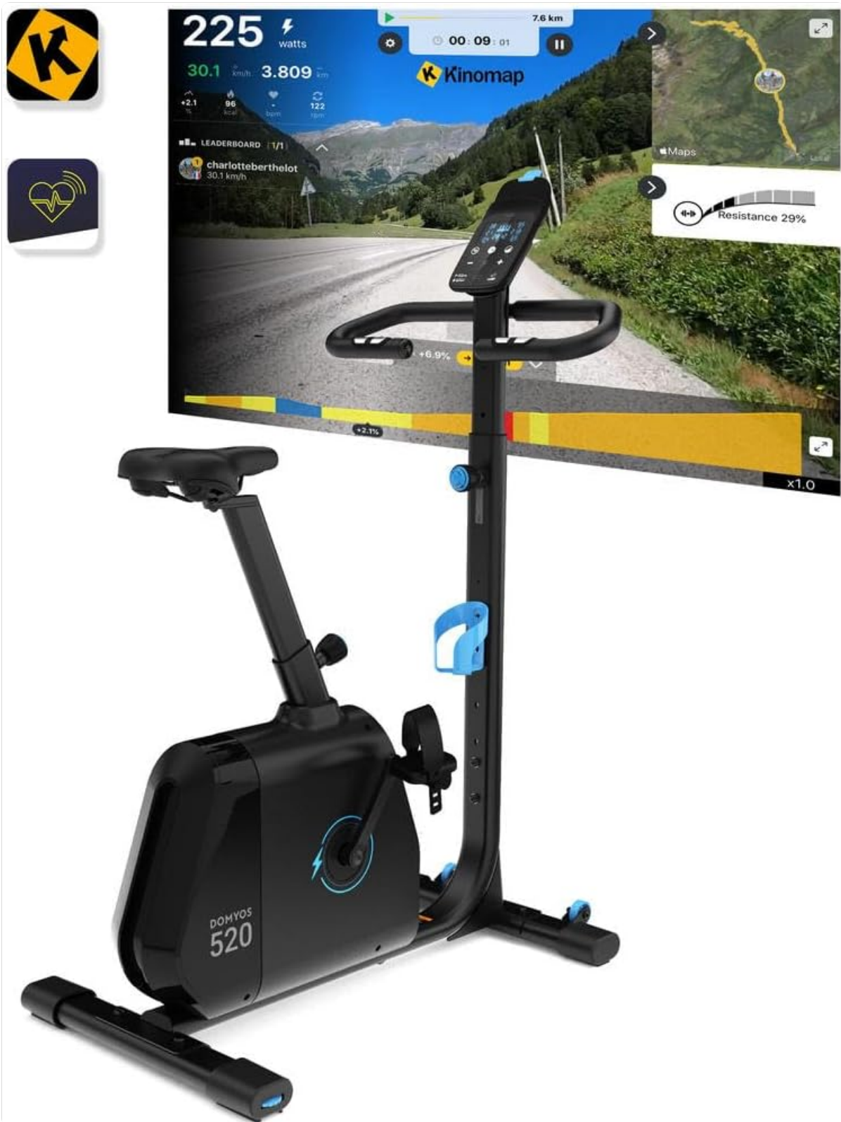
Image: The Domyos EB520 Exercise Bike with a tablet mounted on its console, displaying the Kinomap application, indicating connectivity features.