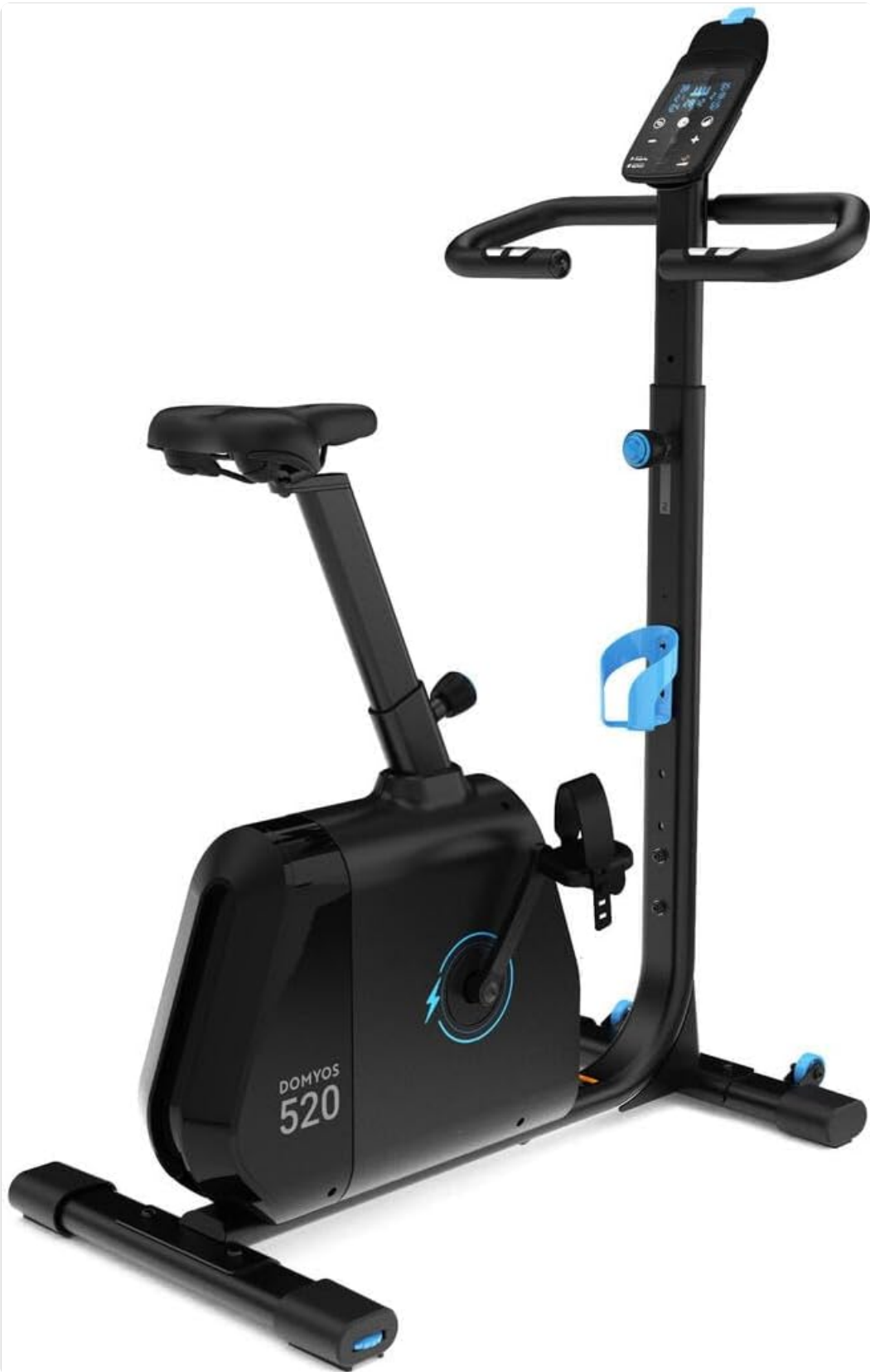
Image: The Domyos EB520 Self-Powered Exercise Bike, showcasing its sleek black design and integrated console.