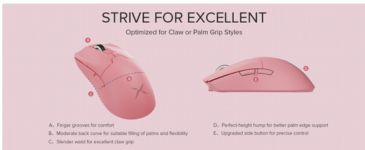
Figure 6: Optimized Grip Styles. This image demonstrates how the DeLUX M800 Ultra mouse is designed to be comfortable for both claw and palm grip users, highlighting its ergonomic contours.

The DeLUX M800 Ultra features an ambidextrous shape, optimized for both claw and fingertip grip styles, providing comfortable and full control. Its lightweight design (55 grams) reduces fatigue during extended use.