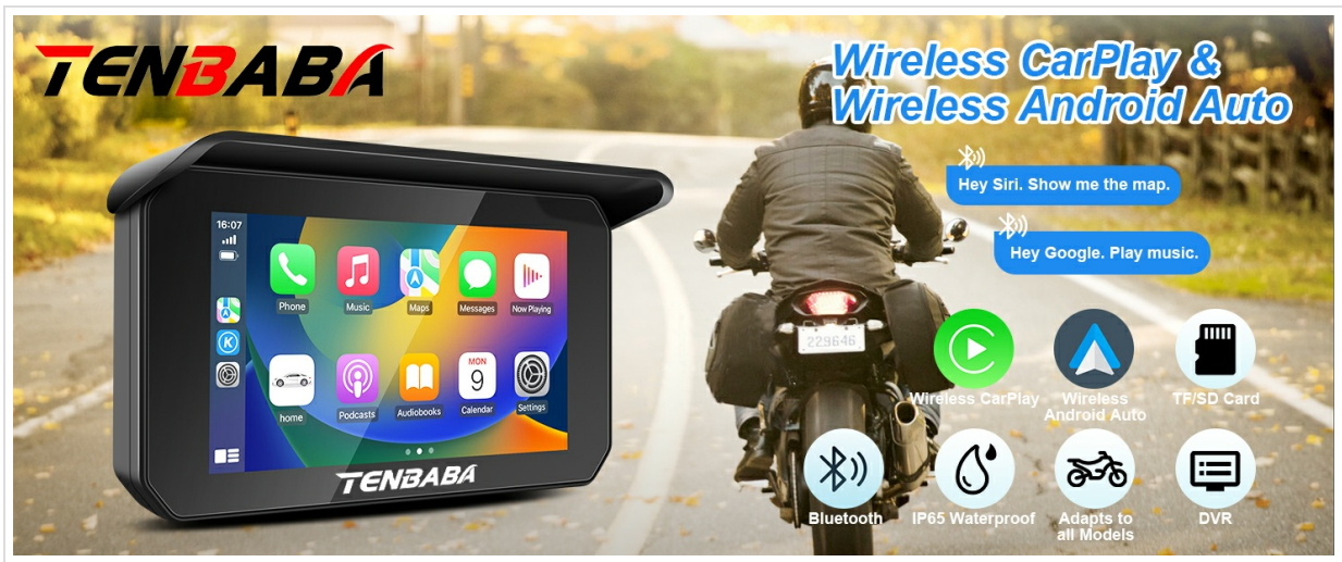
Image: Wireless CarPlay and Android Auto interfaces.