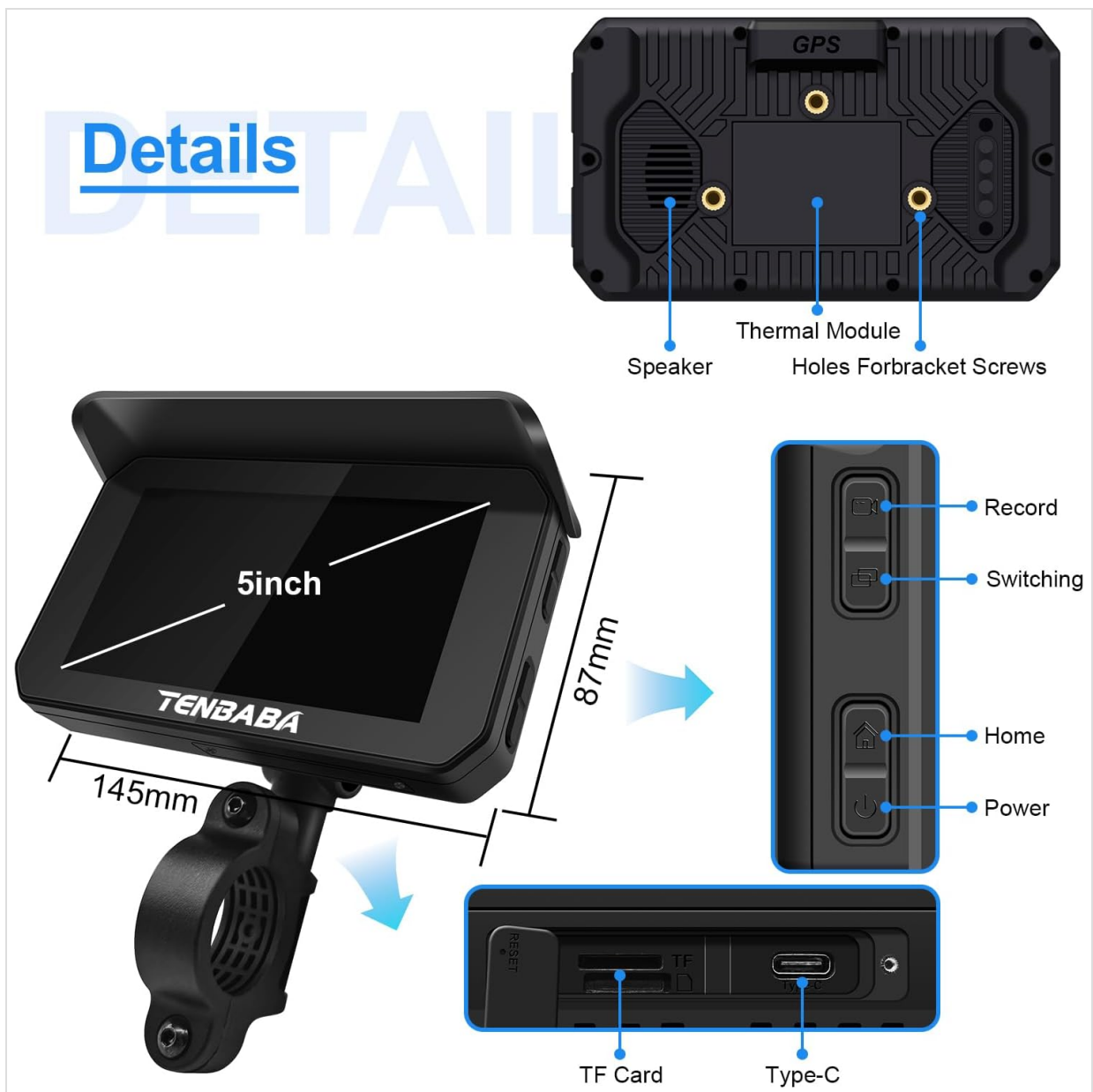
Image: Device details including power button location.