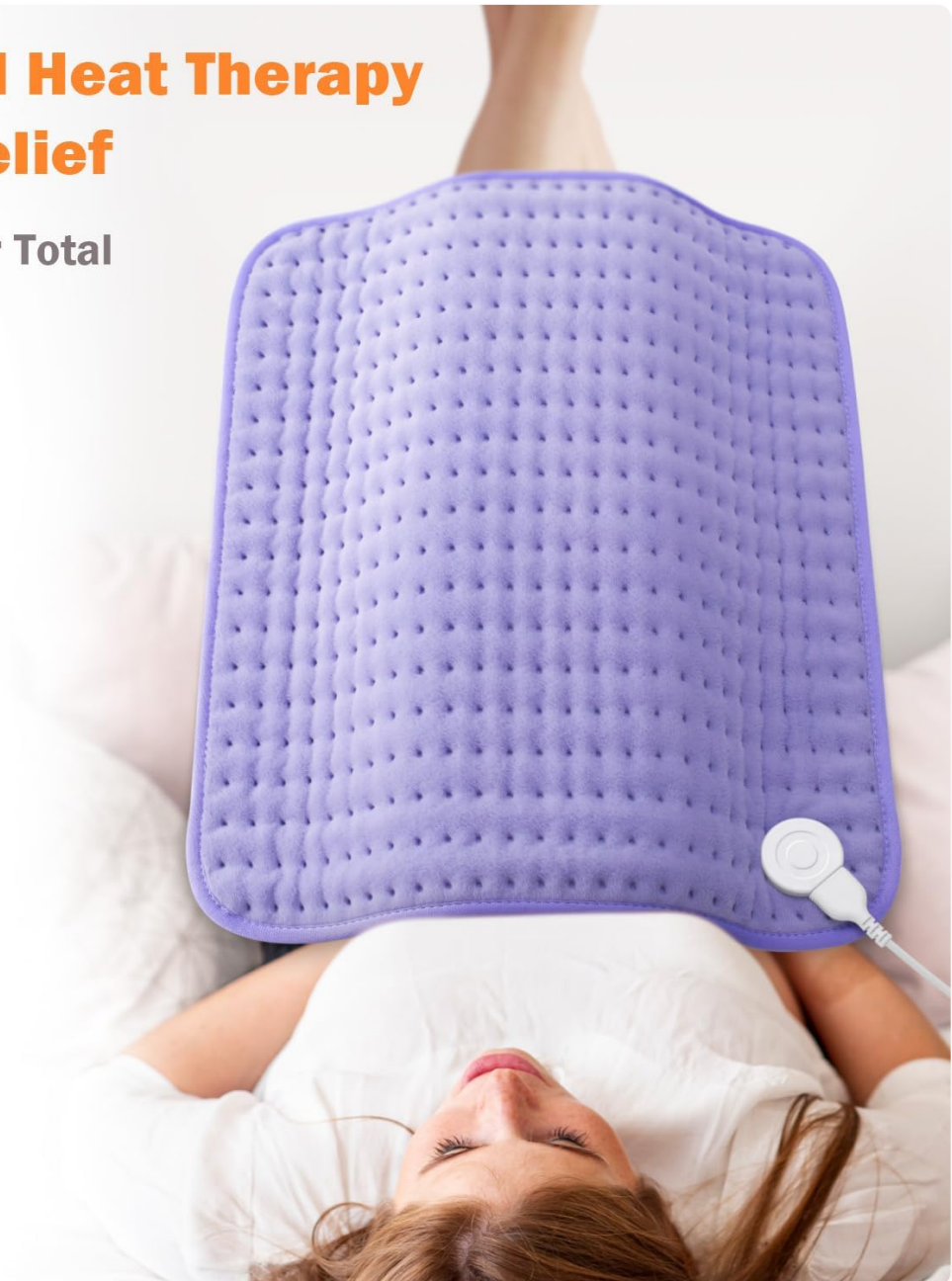
Image: A person relaxing with the Glamigee Ultra-Wide Microplush Heating Pad placed on their lower back, illustrating its wide coverage.