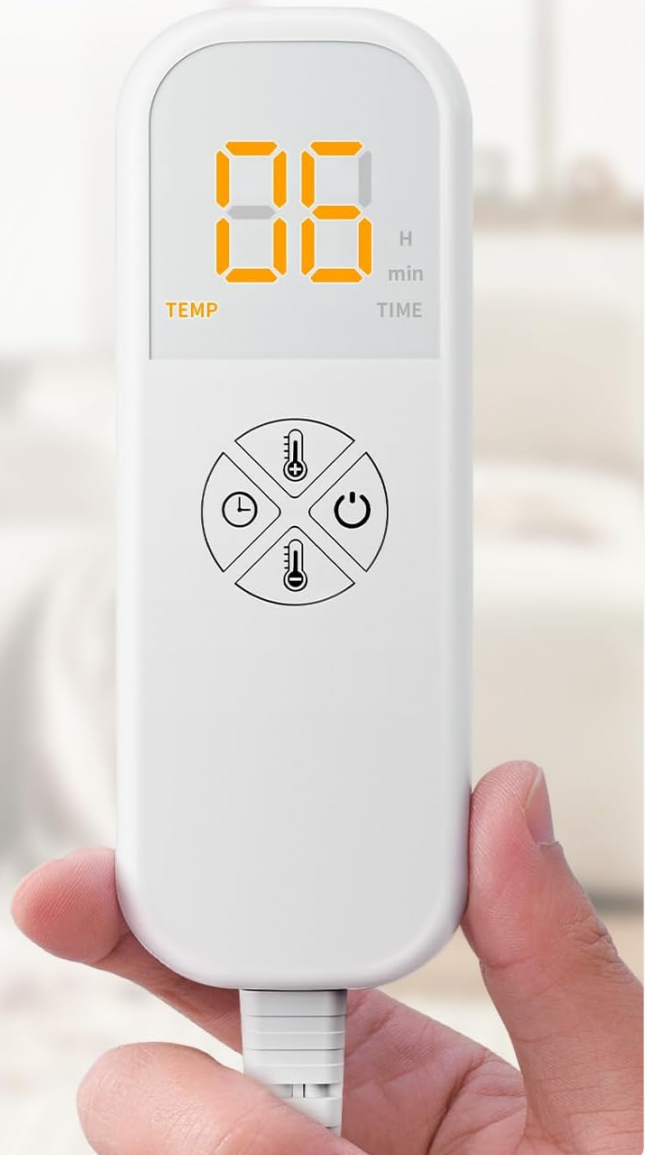
Image: A hand holding the digital controller, displaying the temperature and timer settings on its screen.