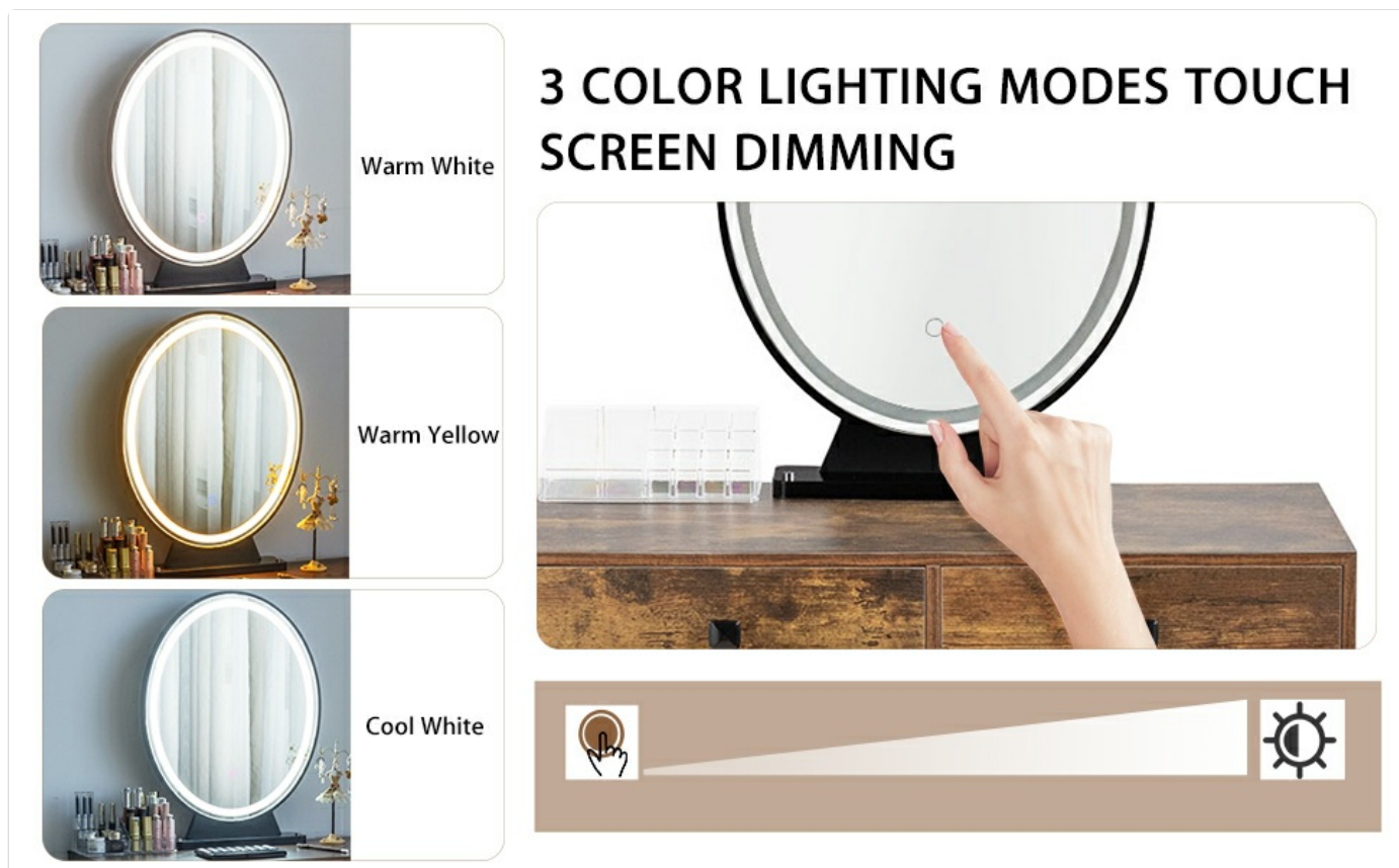
Image: Visual guide demonstrating the touch control for the LED mirror, indicating short press for color changes and long press for brightness adjustment.