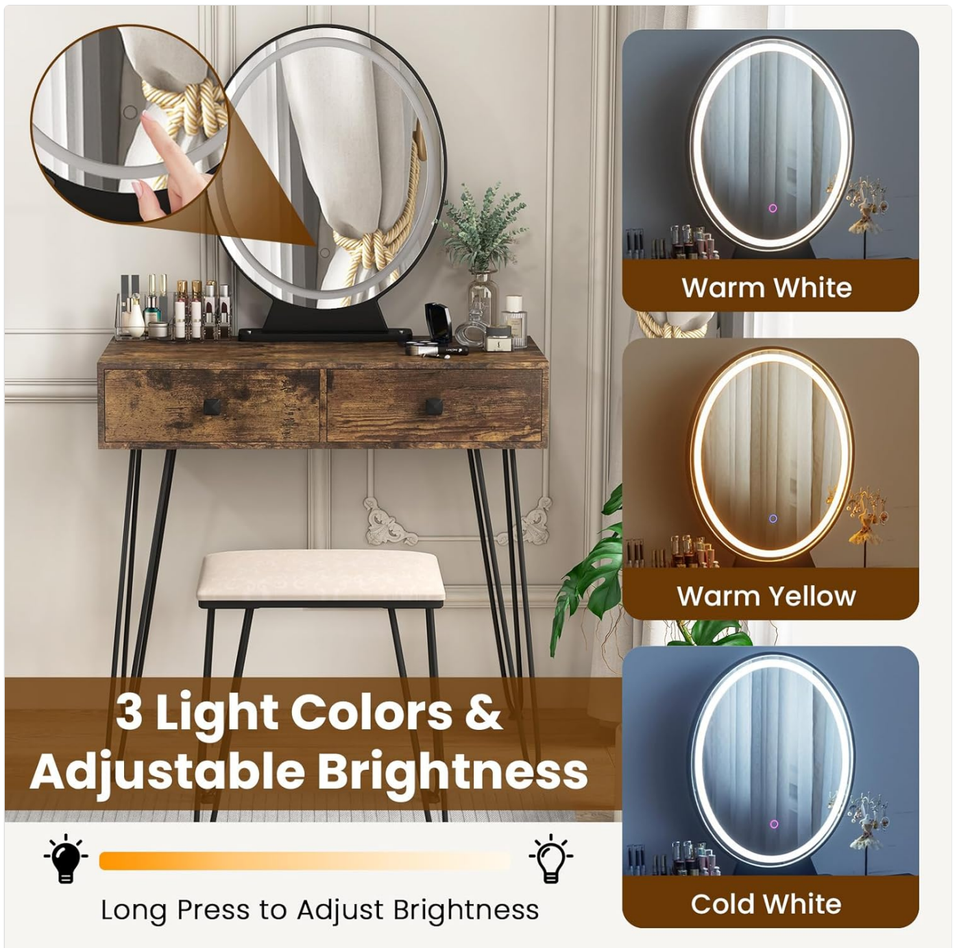
Image: The LED mirror displaying its three distinct lighting modes: Warm White, Warm Yellow, and Cold White, along with an indicator for brightness adjustment.