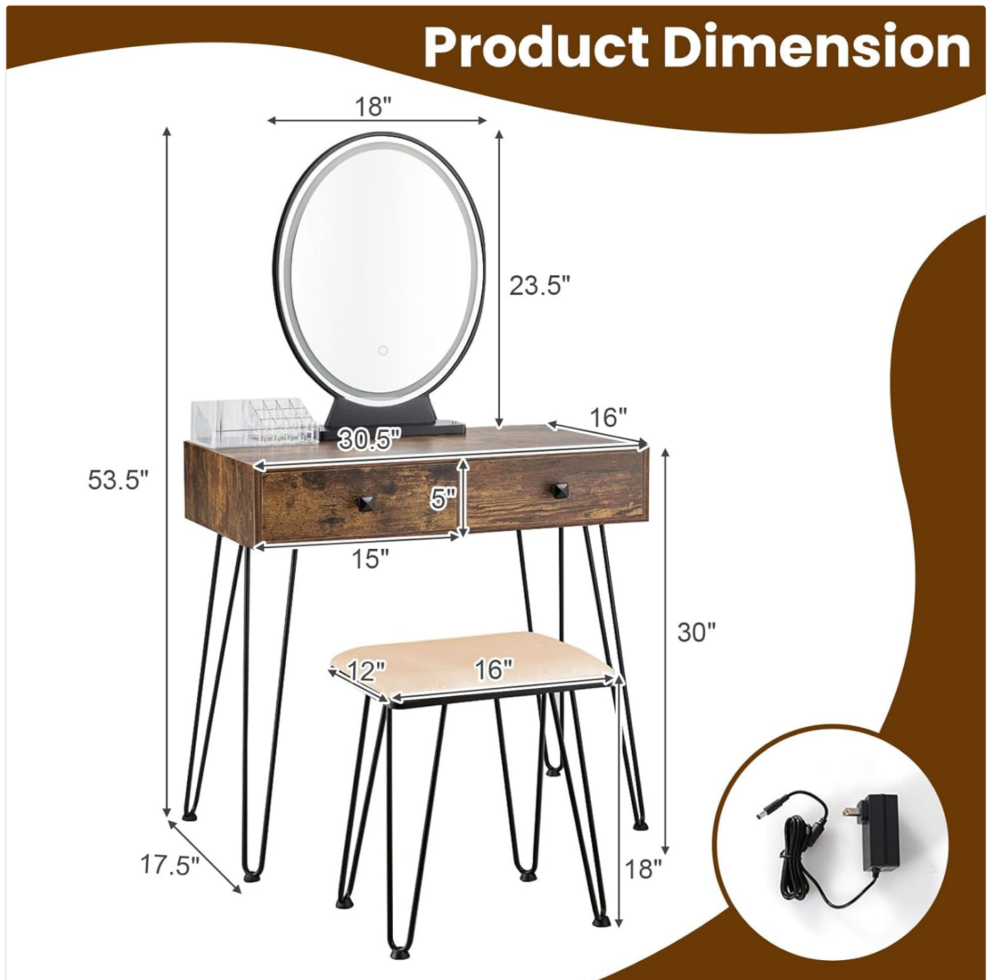
Image: Diagram showing the dimensions of the vanity desk and stool, including the mirror height and desk width/depth.