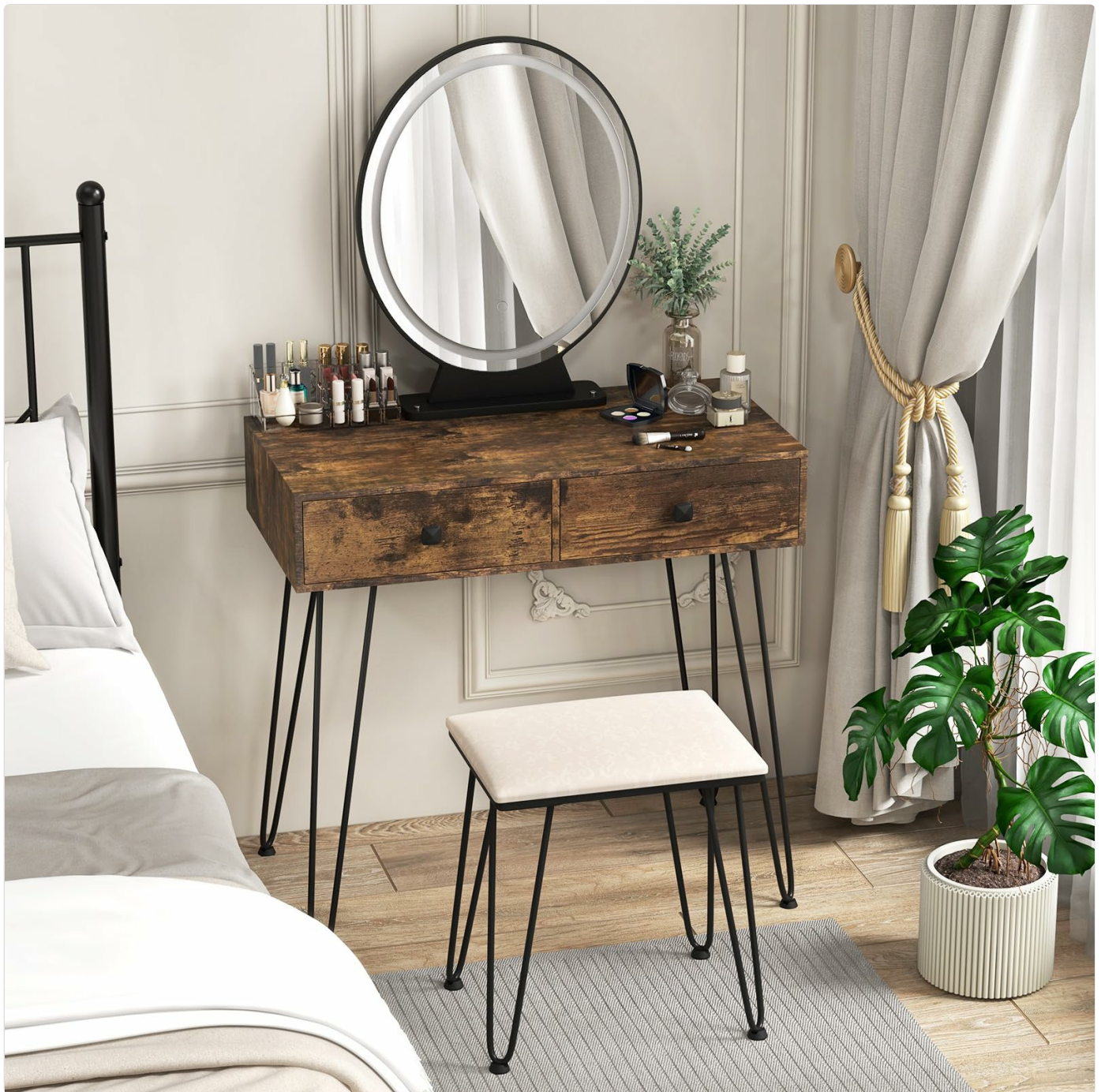
Image: The COSTWAY Vanity Desk with Mirror and Lights, featuring a rustic brown finish, a round LED mirror, two drawers, and a matching stool.