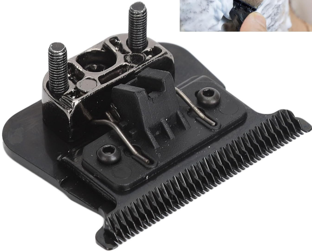
Figure 4: The clipper head in action, suitable for shaving and trimming.

Your browser does not support the video tag.