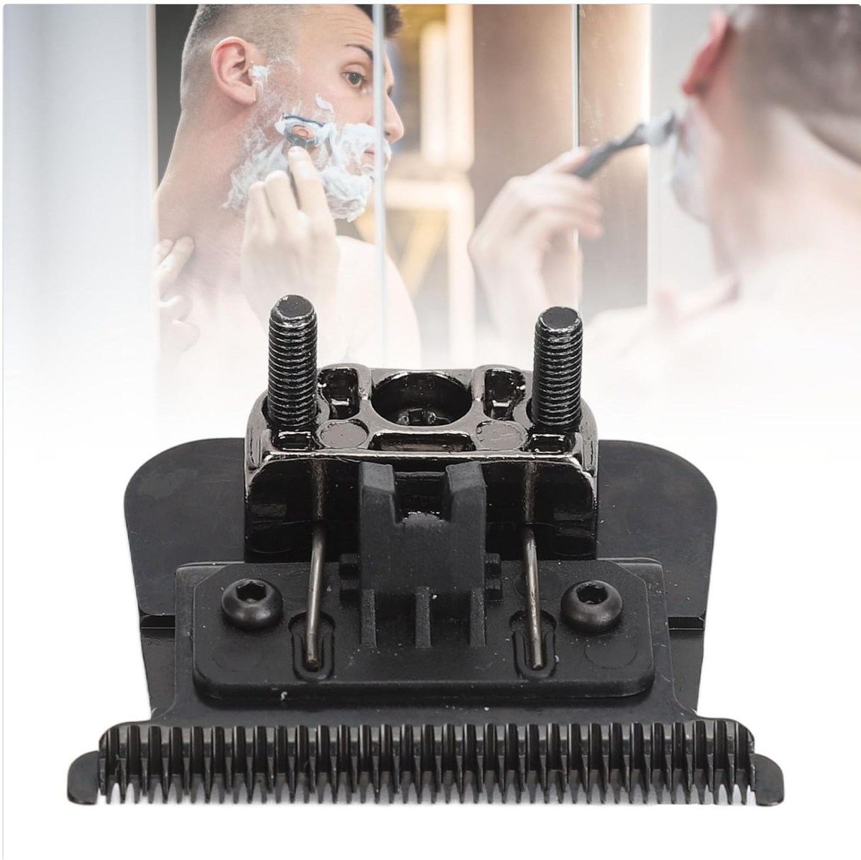
Figure 1: Overall view of the Dioche Hair Clipper Replacement Head.