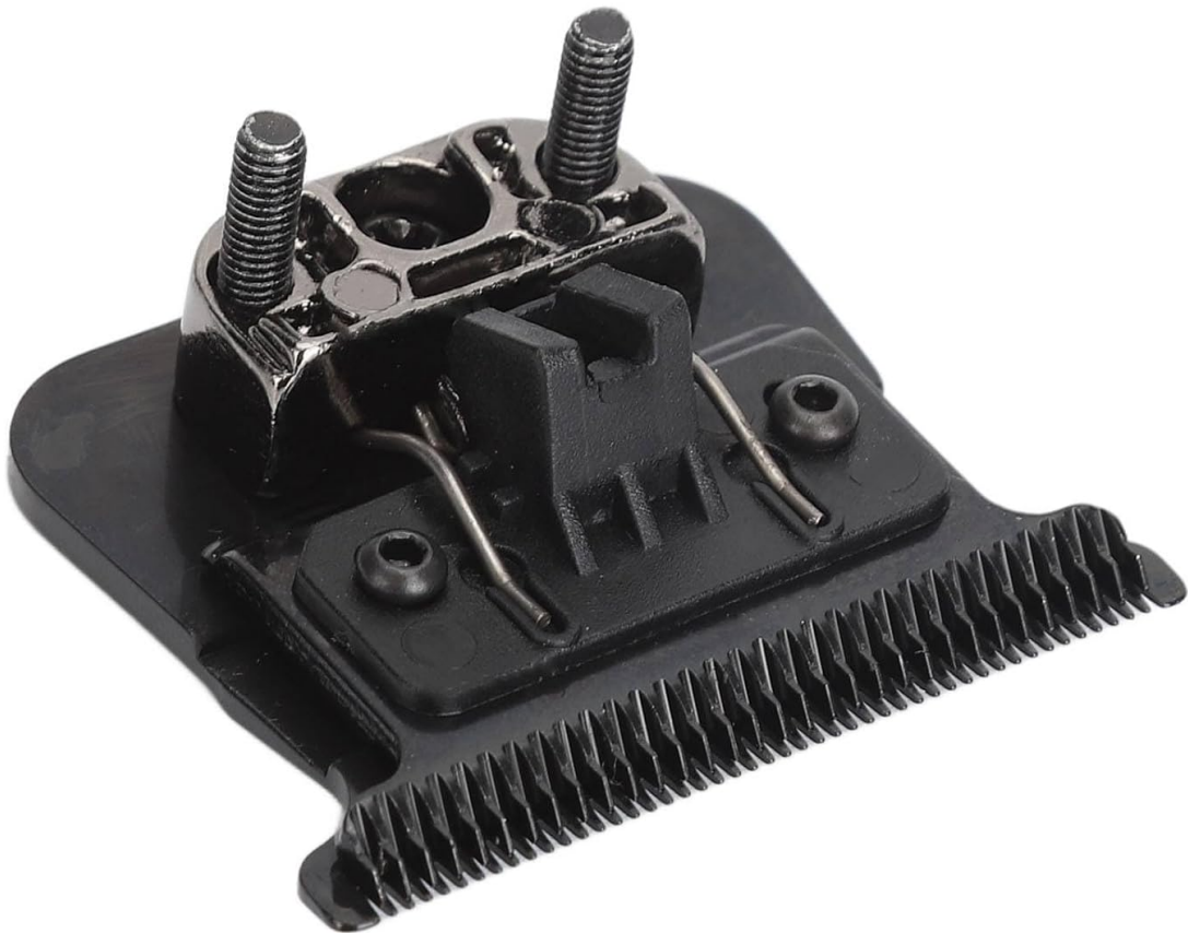
Figure 3: The replacement head's attachment mechanism for easy installation.